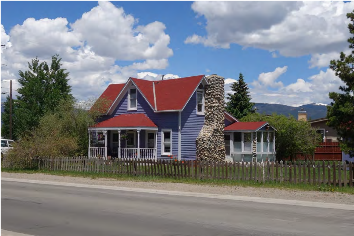
5ST.1749 Looking East Image: 414.8th.1