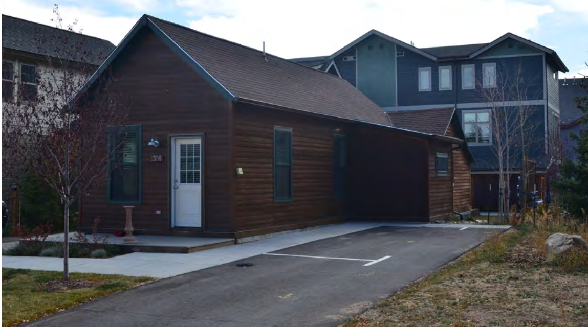
5ST.1753 • Mary Ruth House Looking Southeast Image: 306.GAL.1