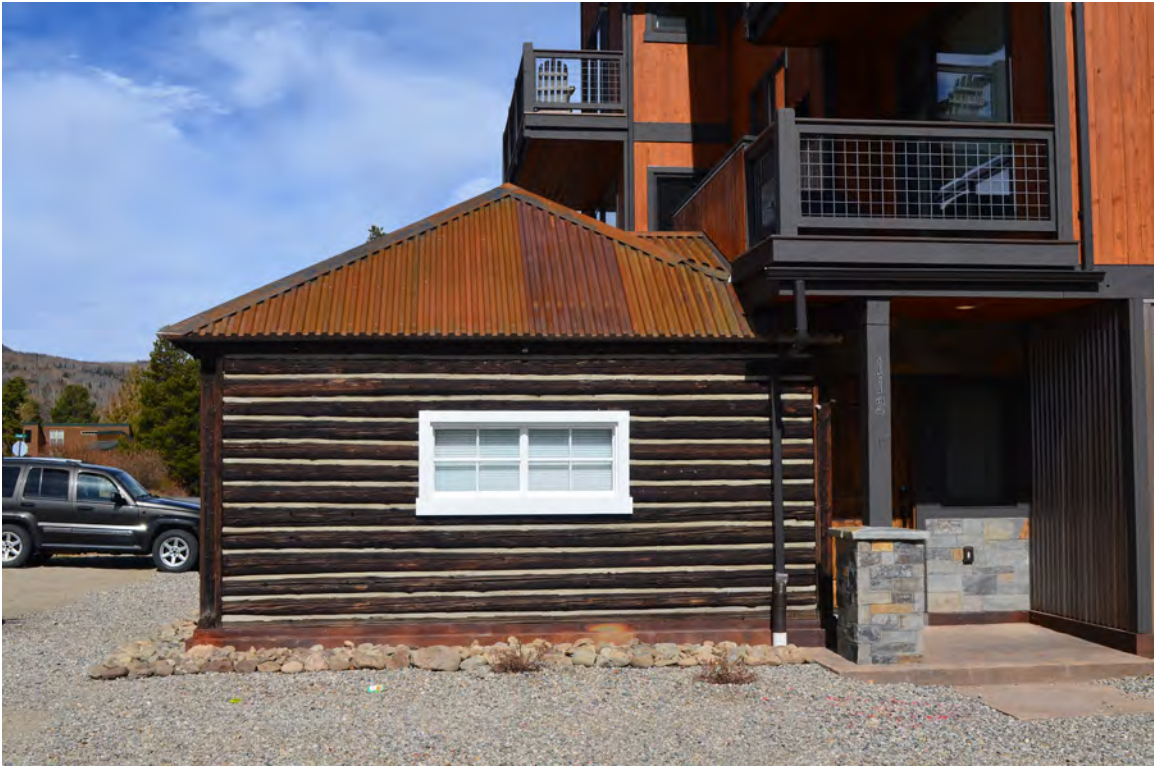
5ST.1745 • Deming Cabin Looking North Image: 112.N5th.5