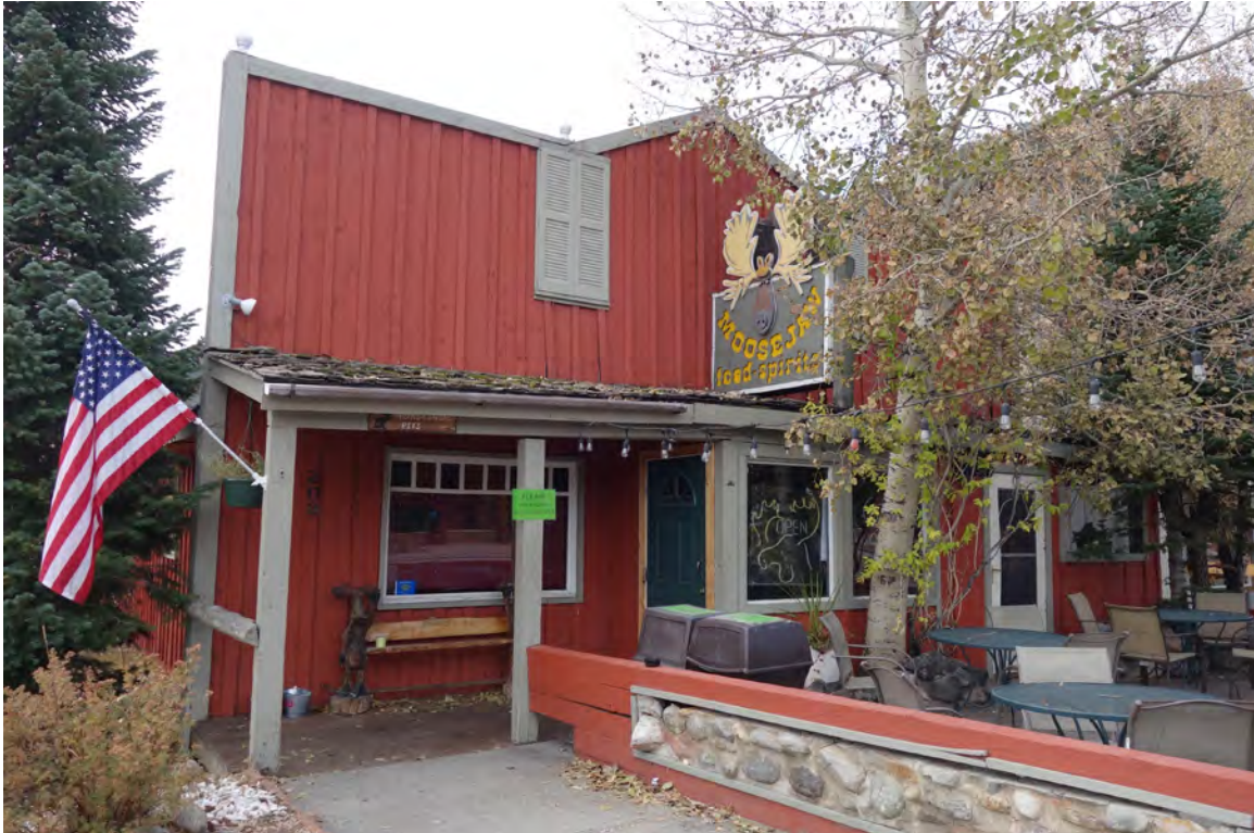
5ST.1761 • Moose Jaw Cafe Looking Southwest Image: 208.MAI.2