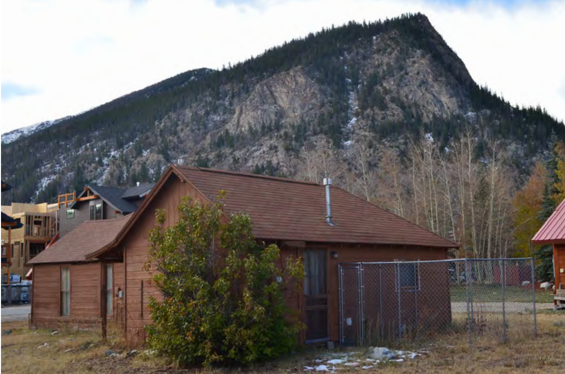
5ST.1750 Looking Southwest Image: 201.GAL.4