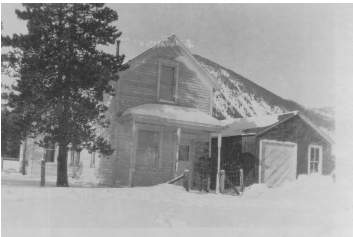
5ST.1743 • Linquist House Looking West Image: 205.N3rd.2

Summit County, Colorado Date Unknown