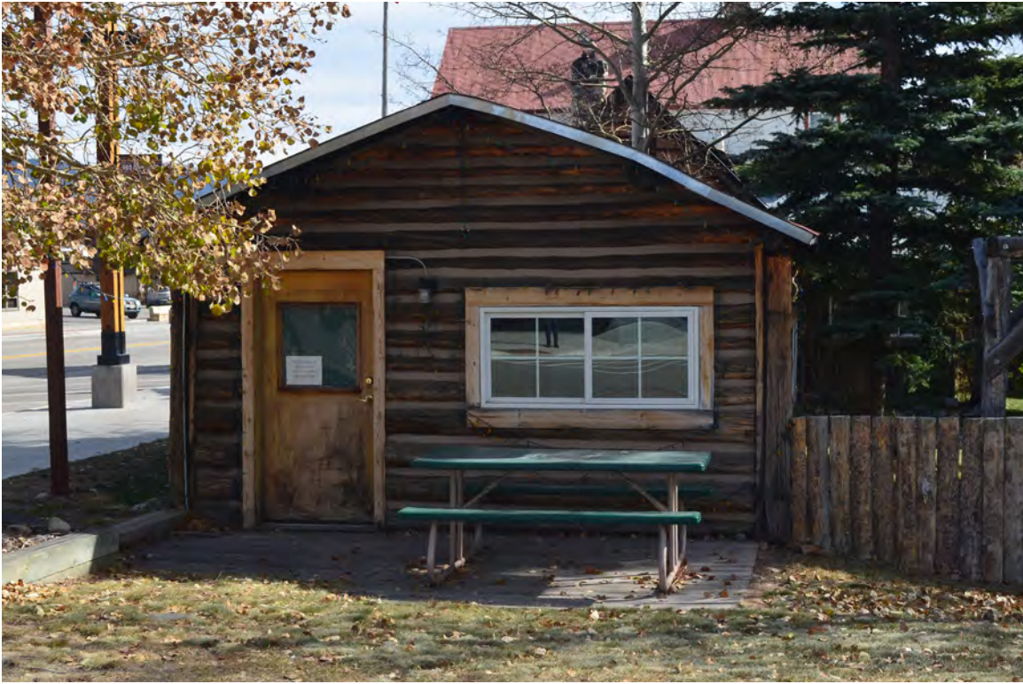
5ST.1763 • Cannam Cabins Cabin 1 Looking East Image: 502a.MAI.1