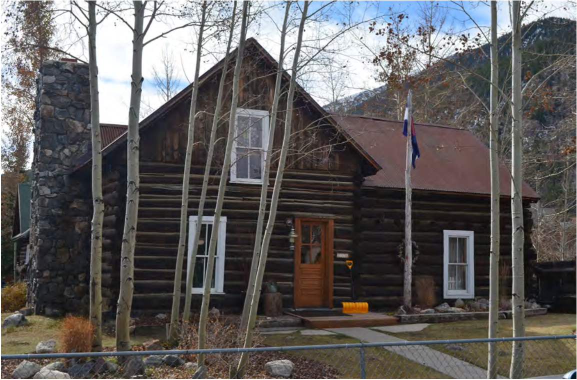
5ST.1752 • Kreamelmeyer House Looking Southwest Image: 216.GAL.3