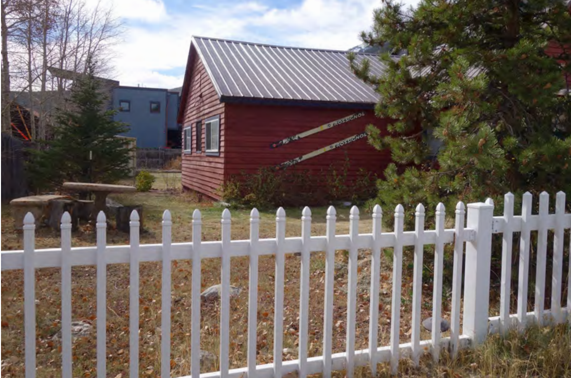
5ST.1751 • Mumford House Looking Southwest Image: 212.GAL.4