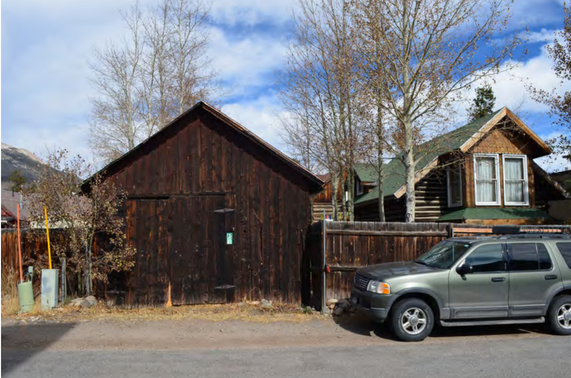
5ST.1752 • Kreamelmeyer House Looking North, Outbuilding 2 Image: 216.GAL.10