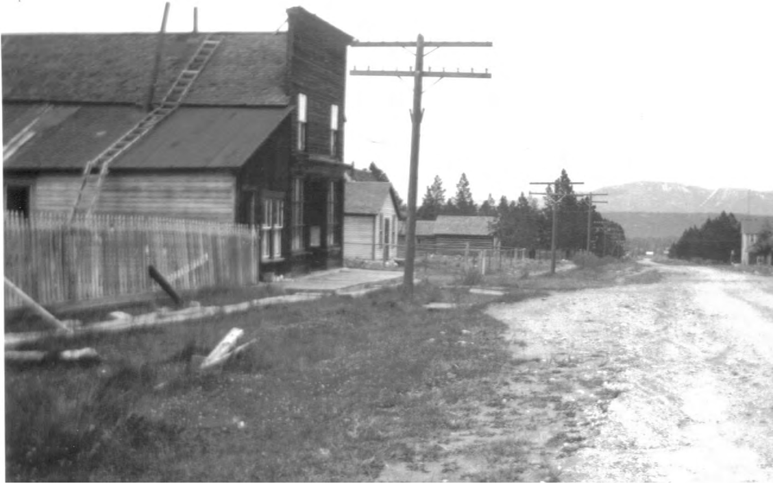
5ST.282 • Frisco Lodge, original facade Looking East Image: 321.MAI.13

Summit County, Colorado date unknown