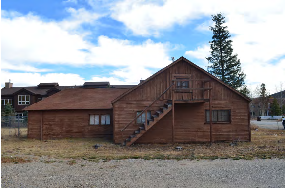
5ST.1750 Looking East Image: 201.GAL.6