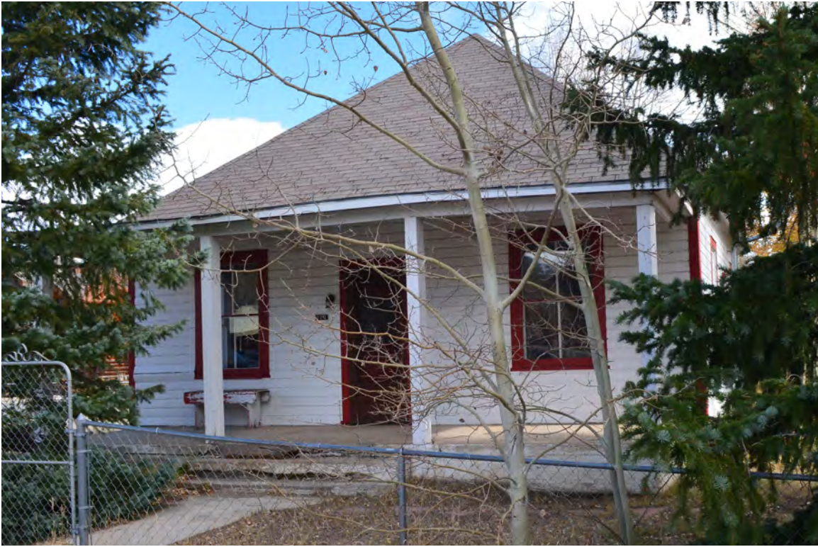
5ST.1744 • Susie Thompson House Looking Northeast Image: 120.N4th.3