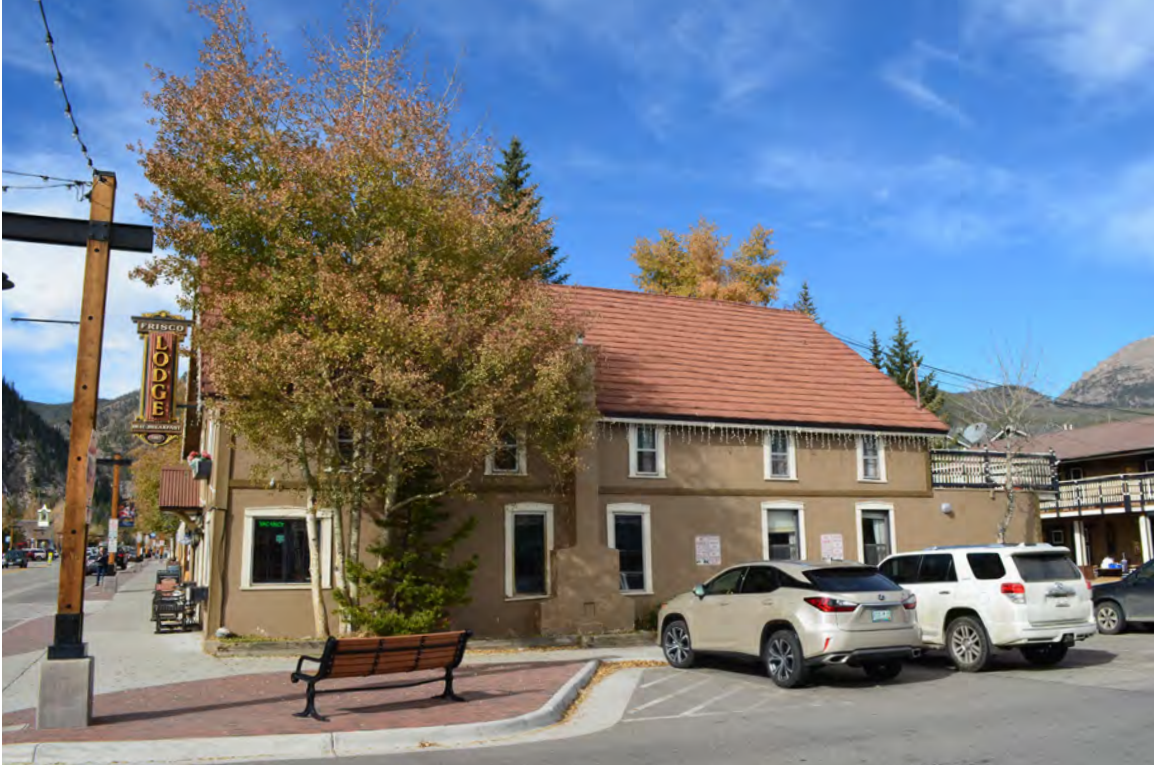
5ST.282 • Frisco Lodge Looking West Image: 321.MAI.4