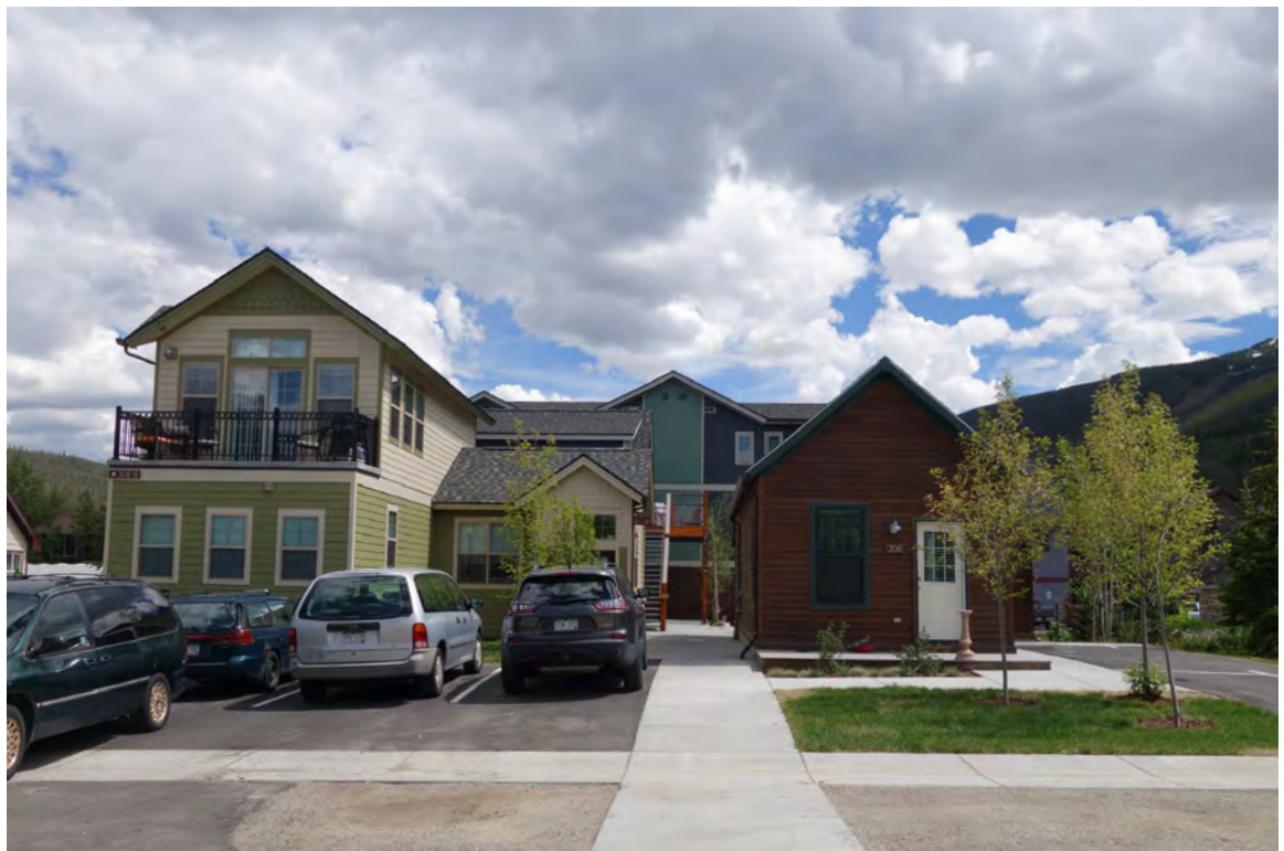
5ST.1753 • Mary Ruth House Looking South overview Image: 308.GAL.4