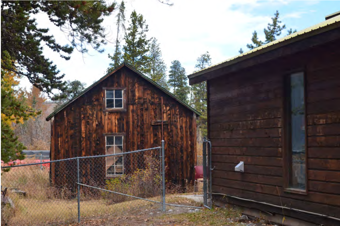
5ST.1754 • Giberson Barn Looking North Image: 313.GAL.2