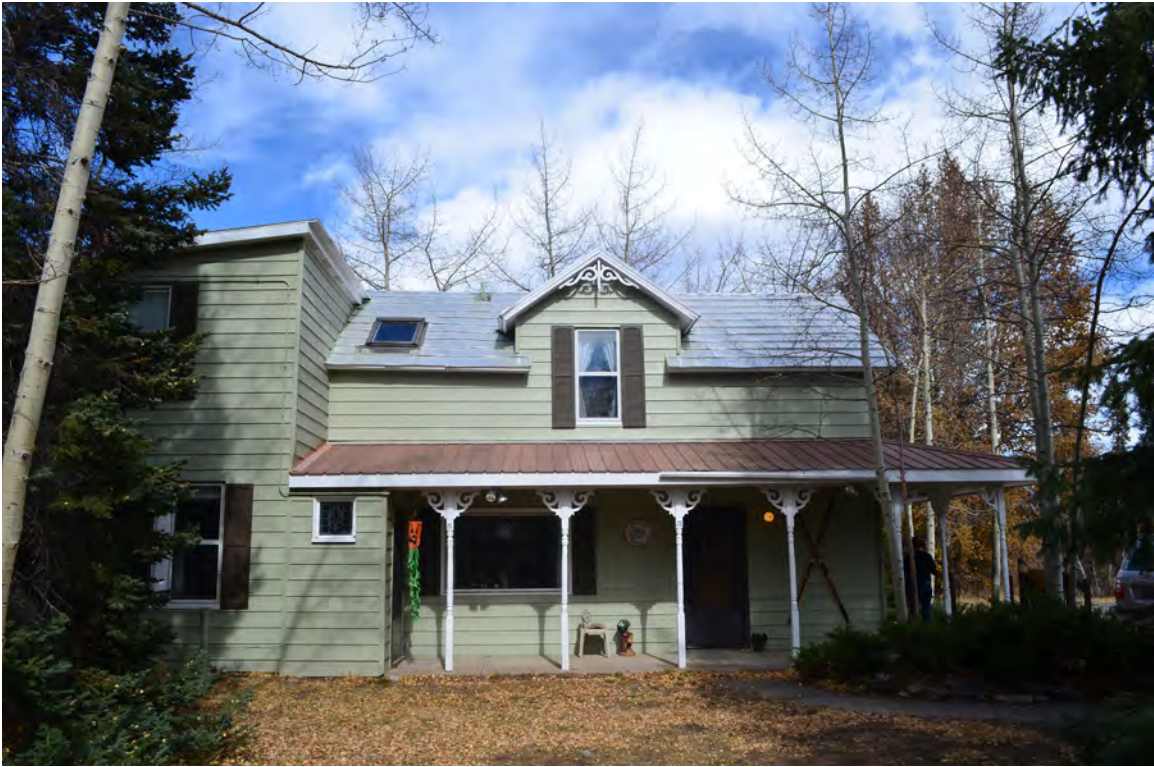
5ST.1743 • Linquist House Looking North Image: 205.N3rd.3