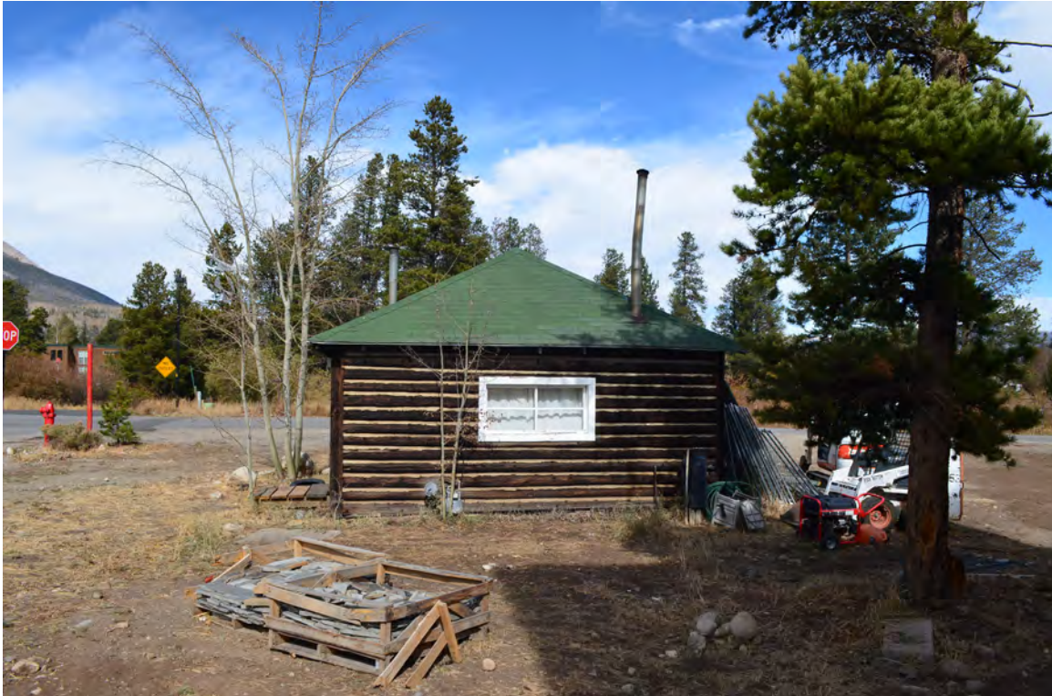
5ST.1746 • Deming Cabin Looking North Image: 116.N5th.6