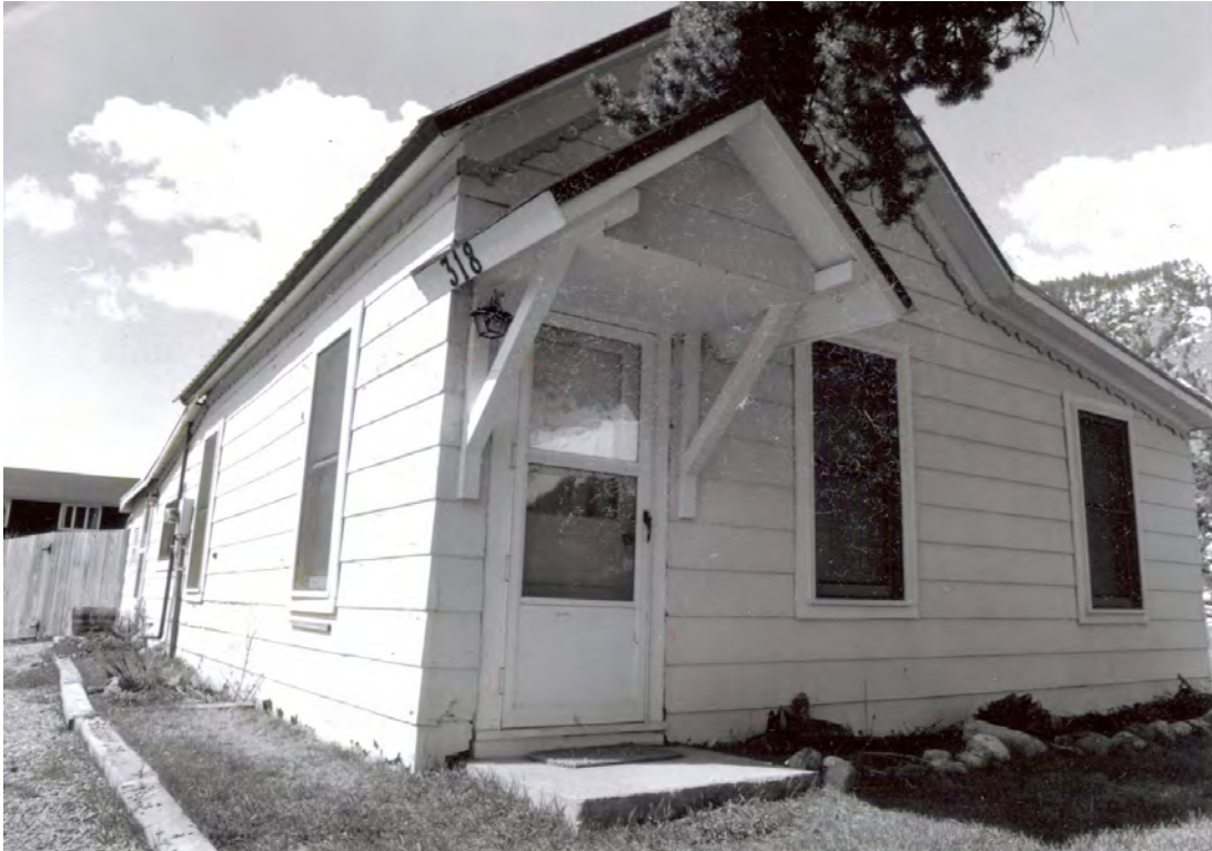
5ST.1755 • Morris House Looking Southwest Image: 318.GAL.2

Summit County, Colorado Date Unknown