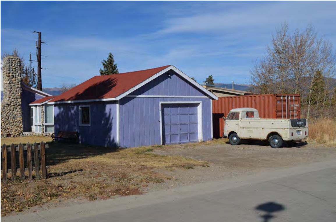
5ST.1749 • Outbuilding Looking Northeast Image: 414.8th.7