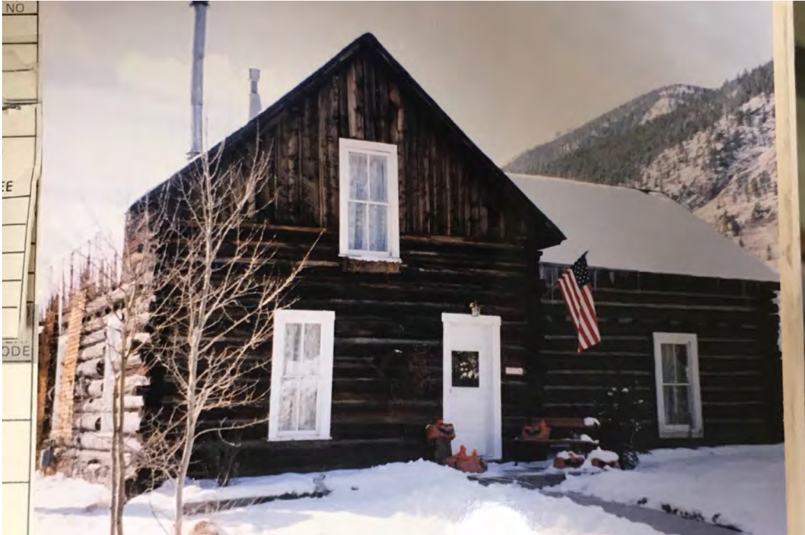
5ST.1752 • Kreamelmeyer House Looking Southwest Image: 216.GAL.2

Summit County, Colorado 1996