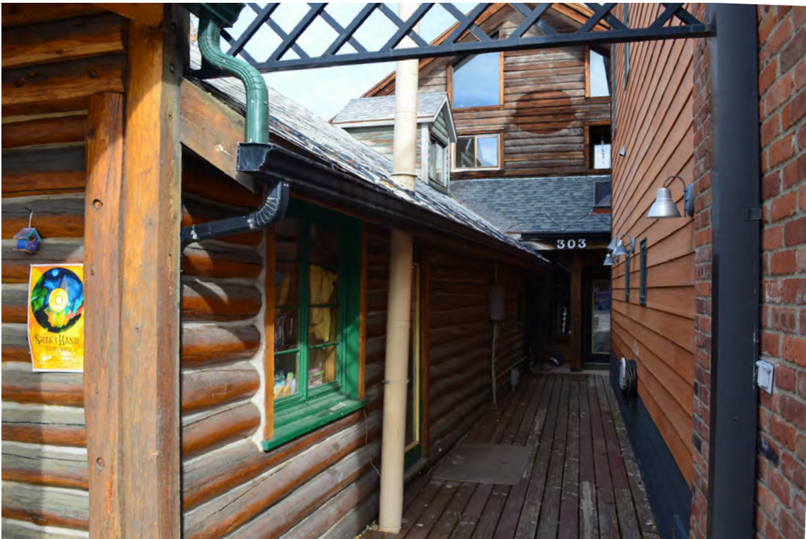
5ST.1762 Looking Northwest Image: 301.MAI.3