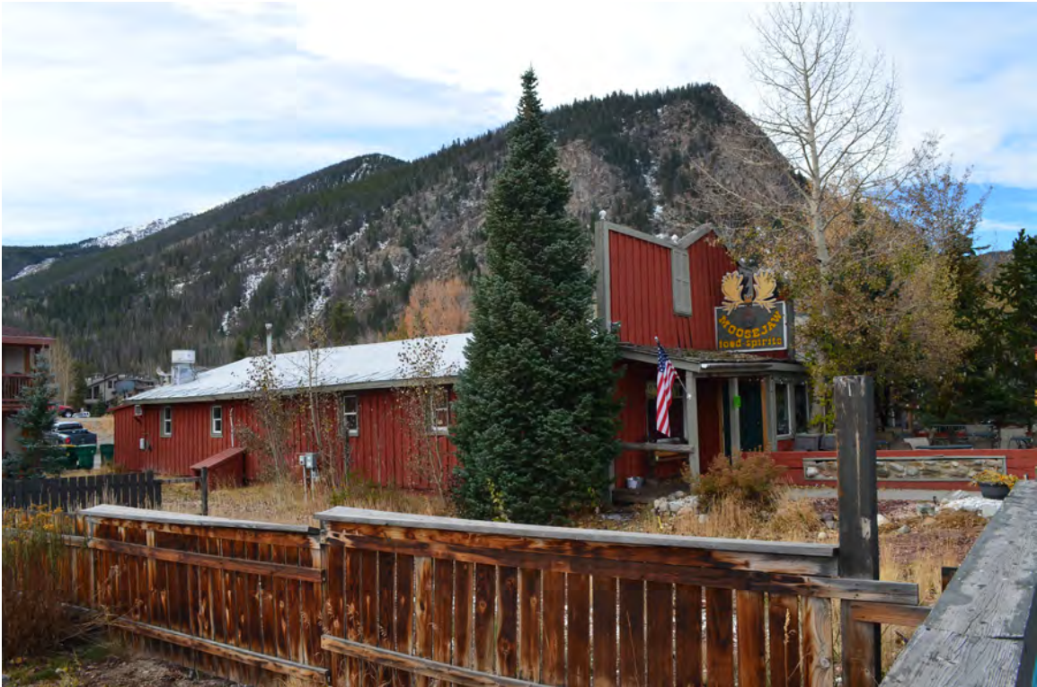
5ST.1761 • Moose Jaw Cafe Looking Southwest Image: 208.MAI.4