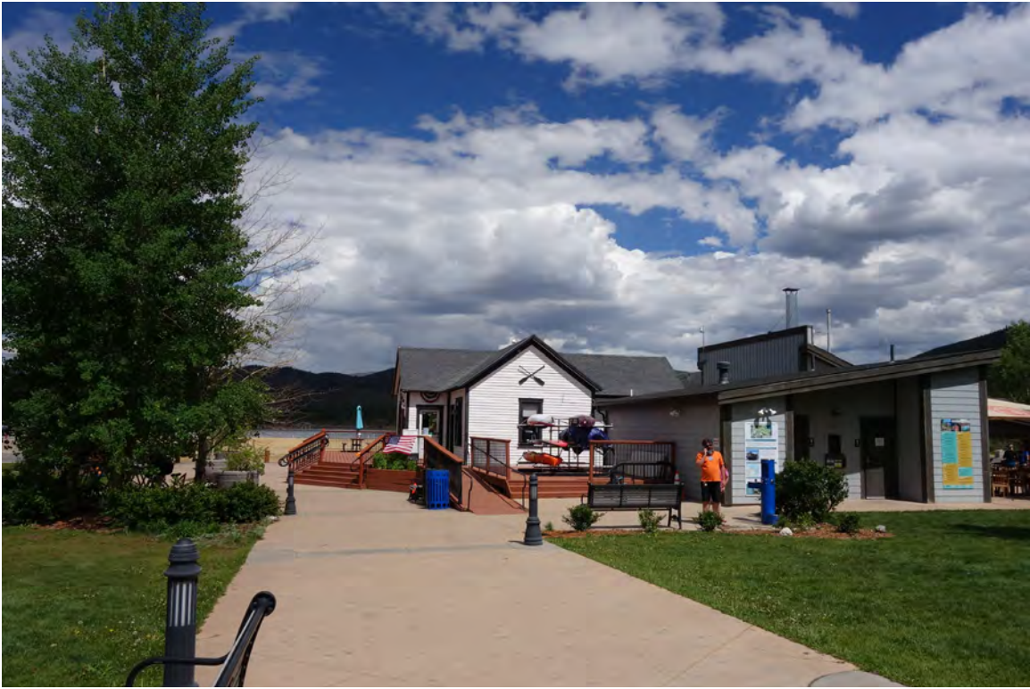
5ST.1765 • Lund House Looking East Image: 267.MAR.7