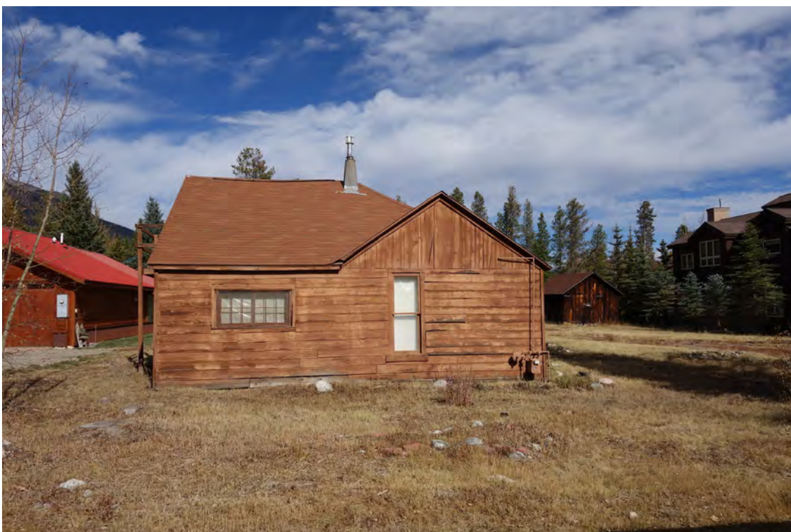
5ST.1750 Looking North Image: 201.GAL.2