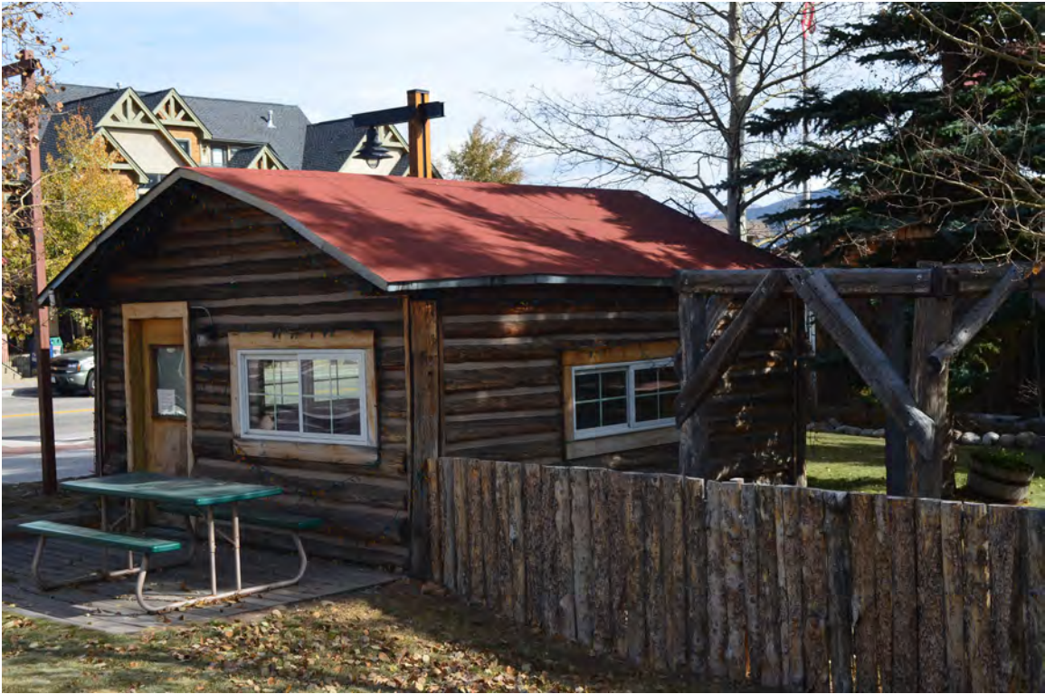
5ST.1763 • Cannam Cabins Cabin 1 Looking Northeast Image: 502a.MAI.3