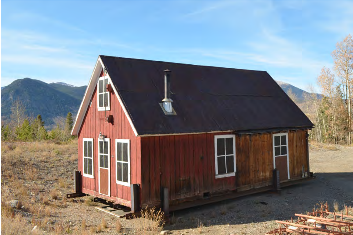
5ST.1766 • Excelsior Mine Office Looking Northeast Image: EXCL.2