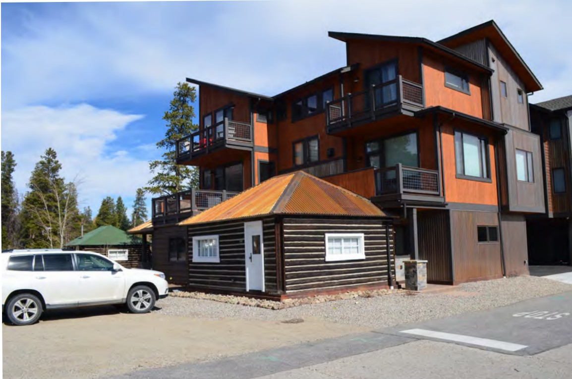
5ST.1745 • Deming Cabin Looking Northeast Image: 112.N5th.4

Summit County, Colorado Date Unknown