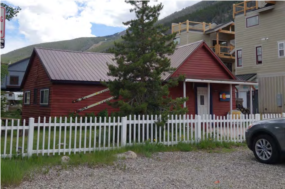
5ST.1751 • Mumford House Looking Southwest Image: 212.GAL.1