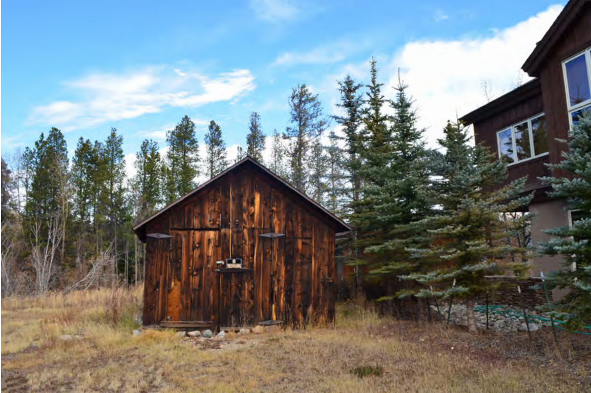
5ST.1750 • Outbuilding Looking North Image: 201.GAL.8