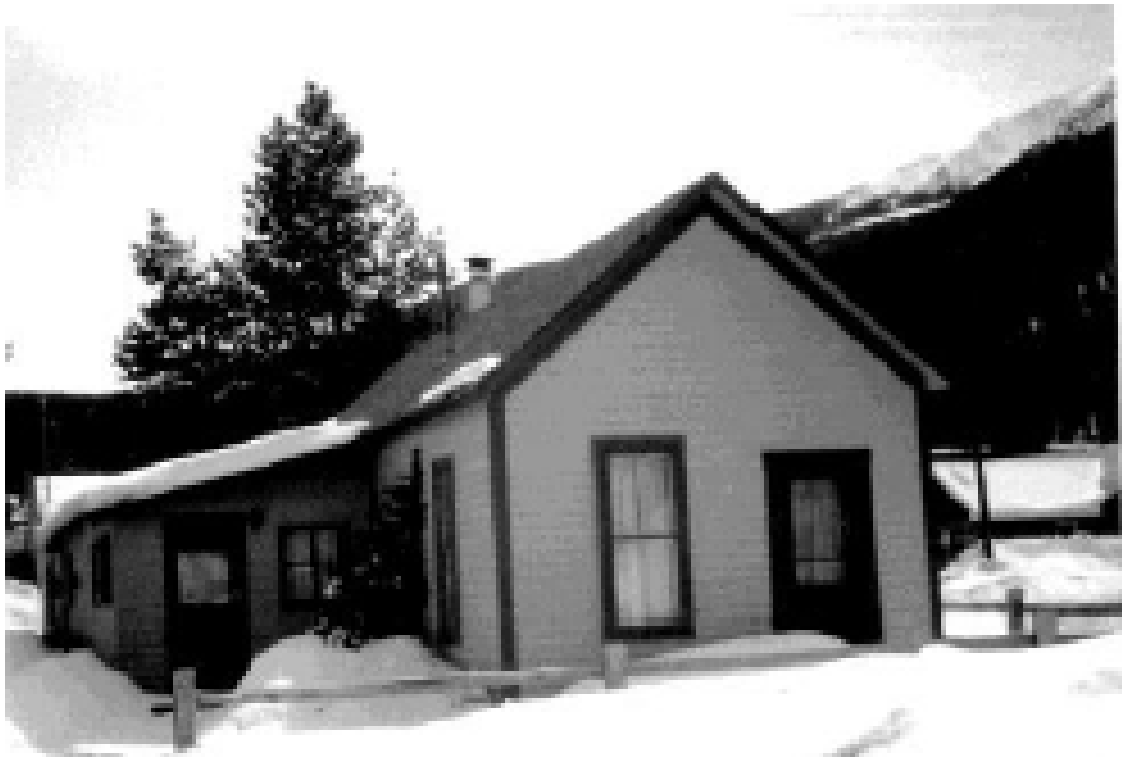
5ST.1753 • Mary Ruth House Historic photo of house in original location at 400 Main St Image: 306.GAL.8

Summit County, Colorado Date Unknown