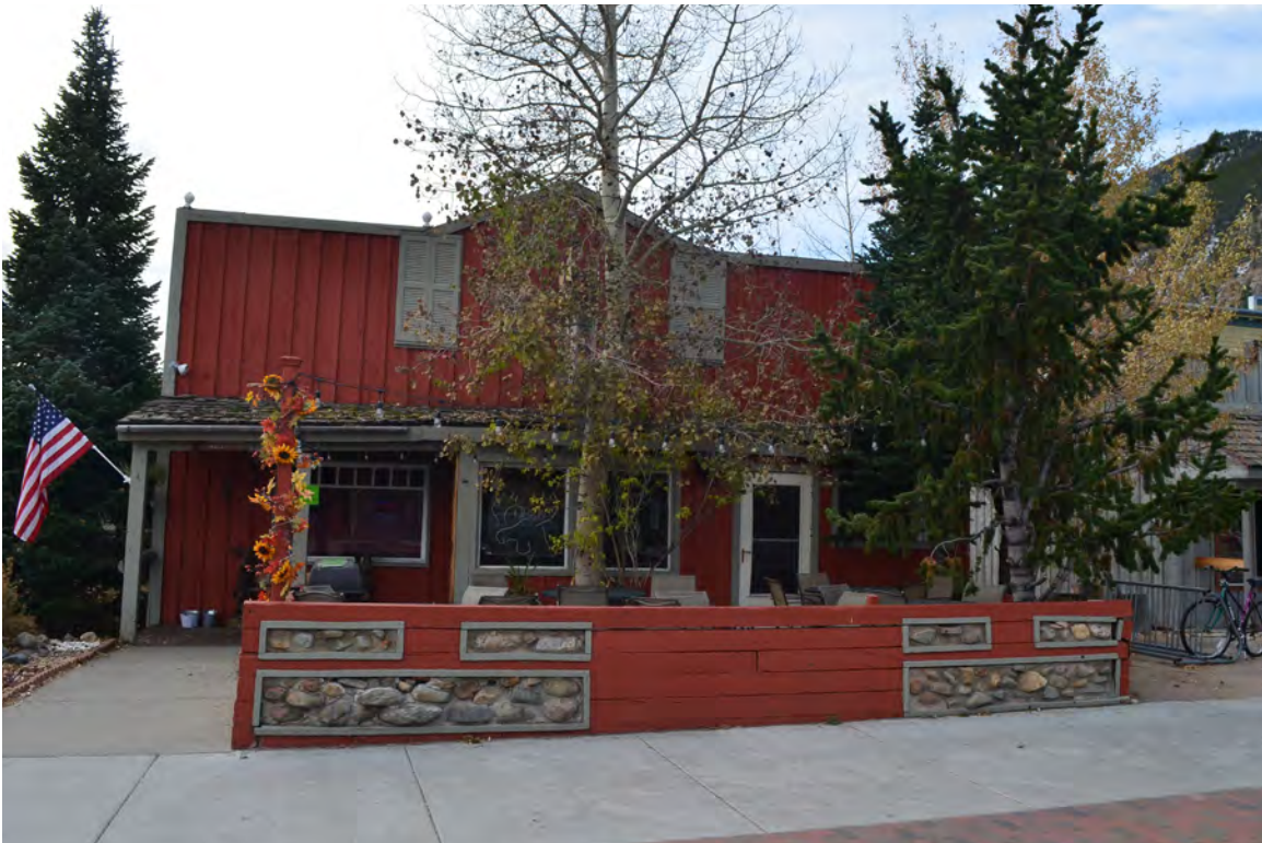
5ST.1761 • Moose Jaw Cafe Looking South Image: 208.MAI.1