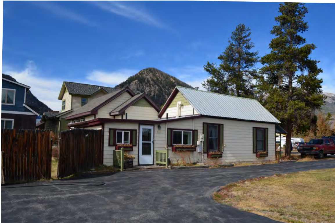
5ST.1755 • Morris House Looking Northwest Image: 318.GAL.6