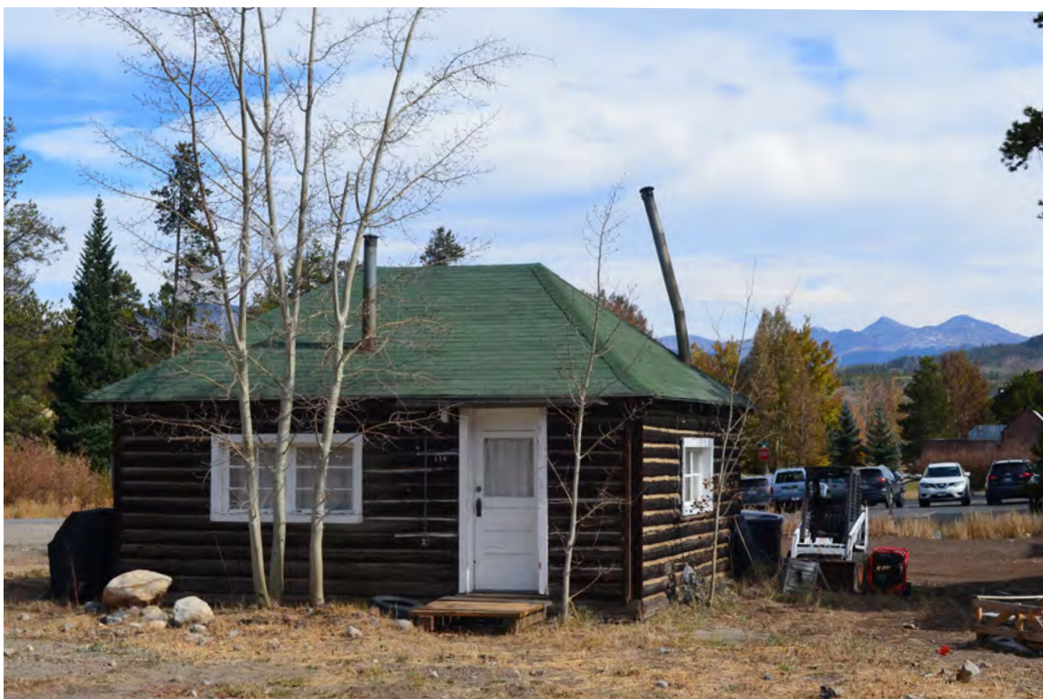
5ST.1746 • Deming Cabin Looking East Image: 116.N5th.1