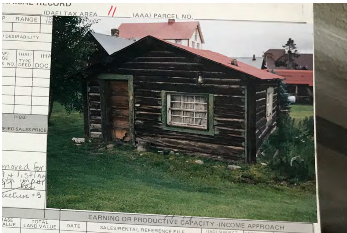
5ST.1763 • Cannam Cabins Cabin 2 Looking East Image: 502a.MAI.10

Summit County, Colorado Date Unknown