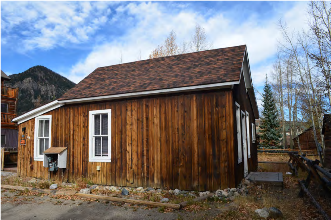
5ST.1758 Looking North Image: 117.GRA.3