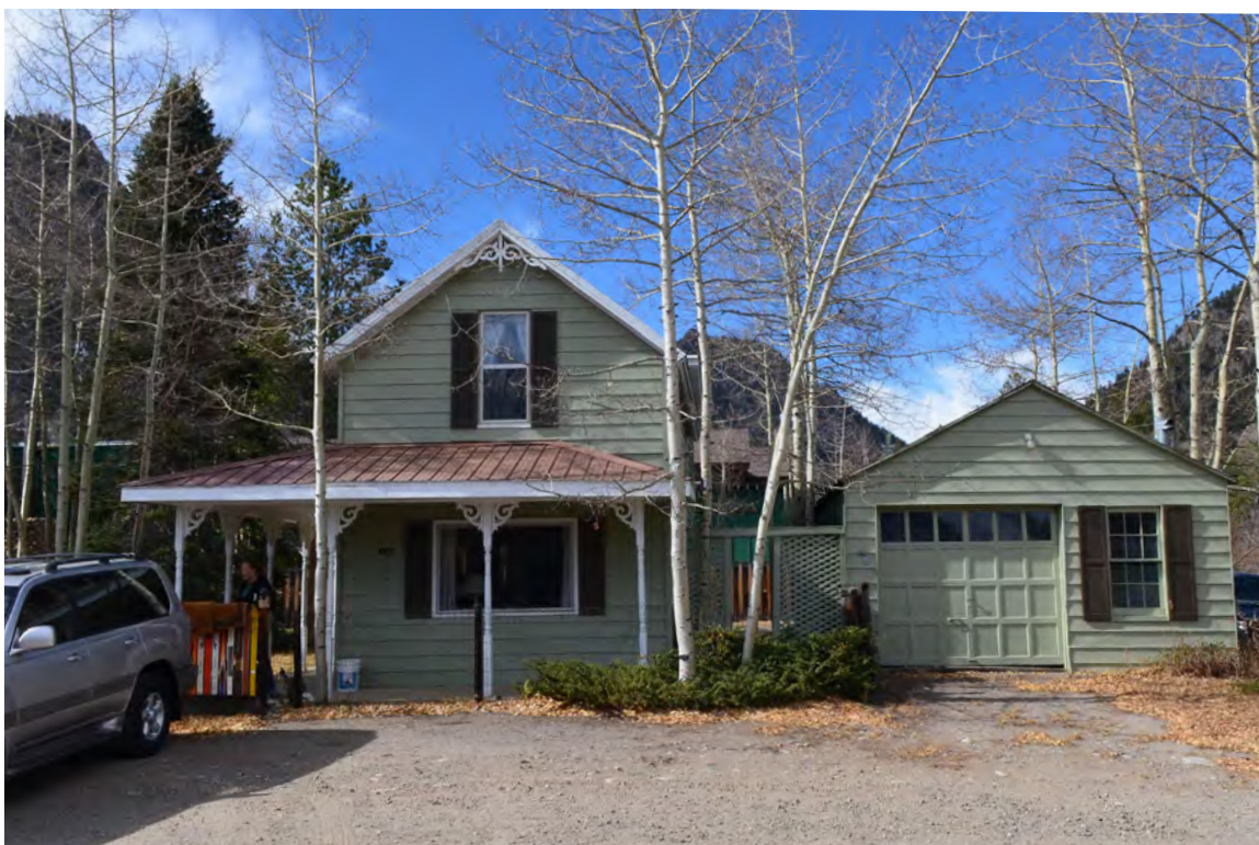
5ST.1743 • Linquist House Looking West Image: 205.N3rd.1