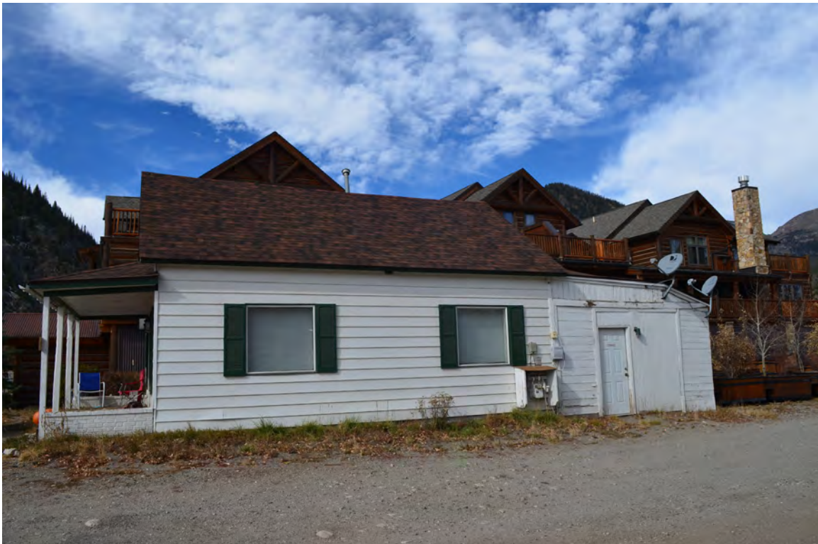
5ST.1757 • Wiley House Looking West Image: 113.GRA.5