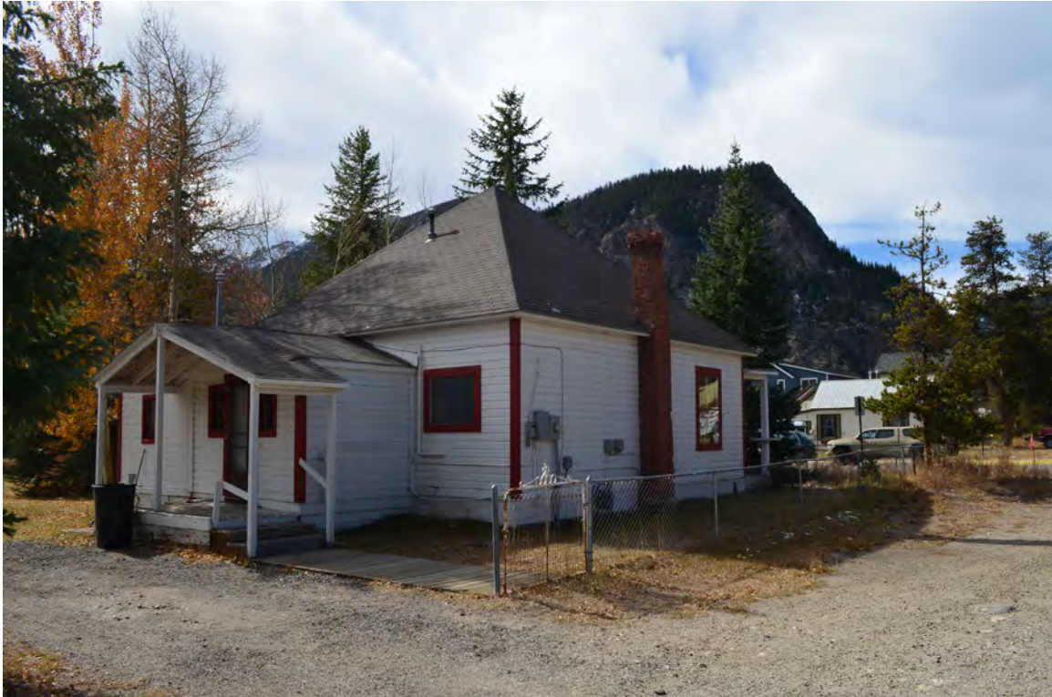
5ST.1744 • Susie Thompson House Looking Southwest Image: 120.N4th.6