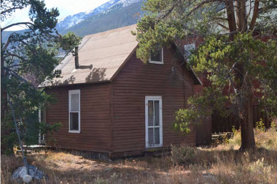
5ST.1756 • Yellow House or Pine Lodge Looking Southwest Image: 420.GAL.4