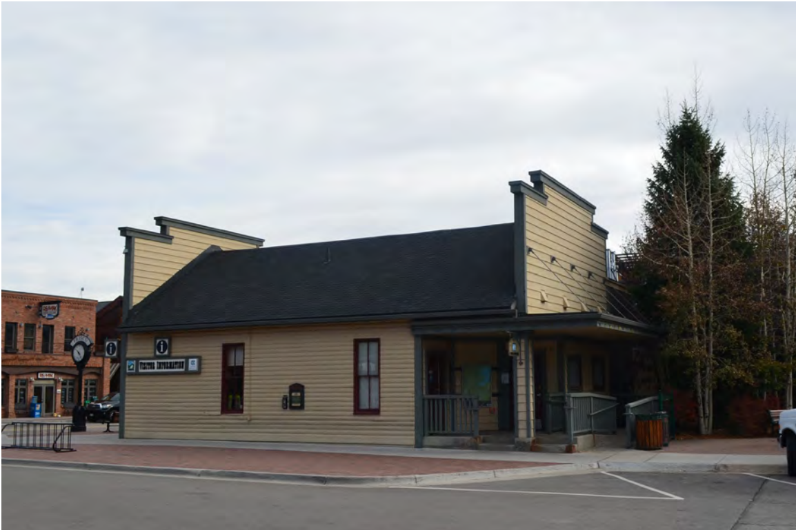
5ST.1073 • Historic Frisco Town Hall Looking Northeast Image: 300.MAI.3