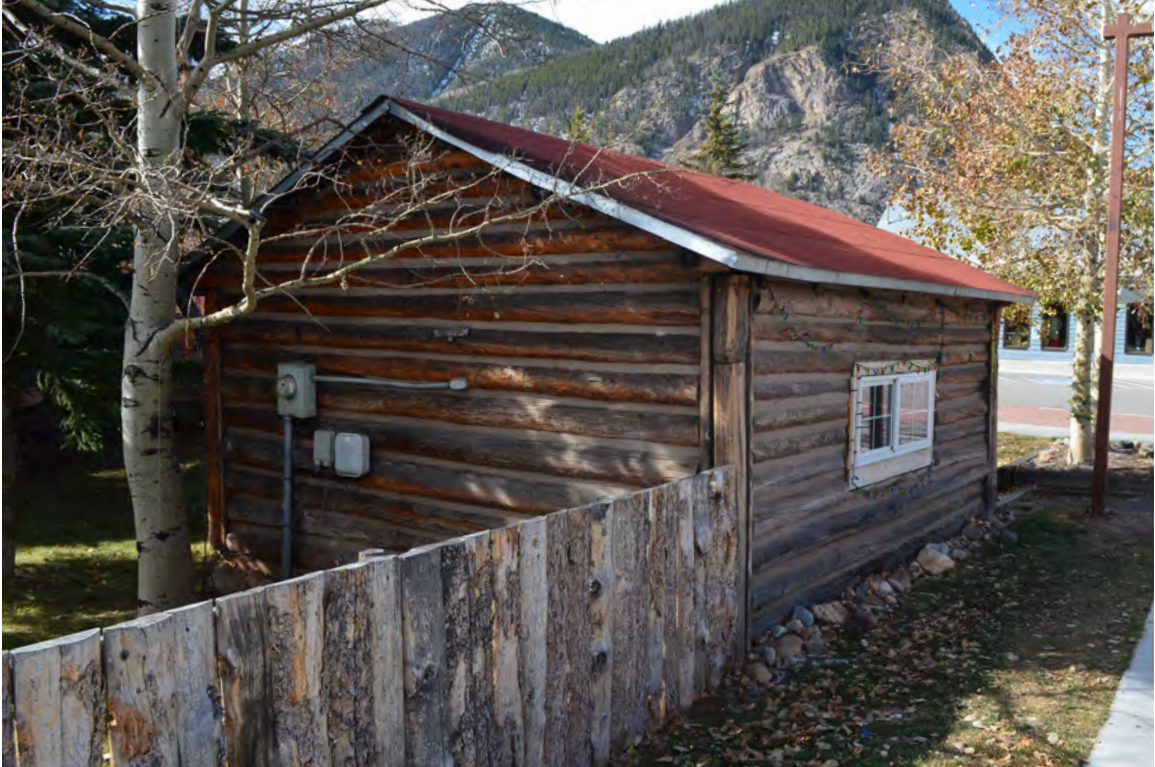
5ST.1763 • Cannam Cabins Cabin 1 Looking Southwest Image: 502a.MAI.4