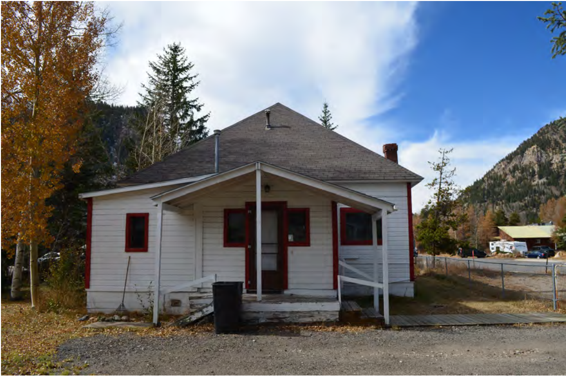
5ST.1744 • Susie Thompson House Looking West Image: 120.N4th.7