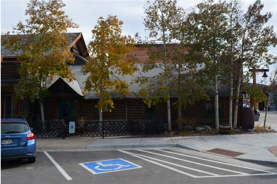
5ST.1762 Looking East Image: 301.MAI.2