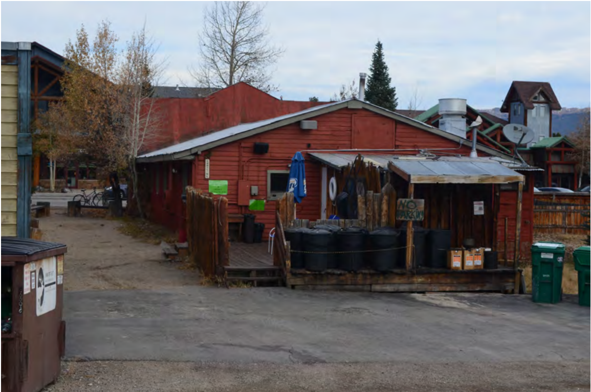
5ST.1761 • Moose Jaw Cafe Looking North Image: 208.MAI.6