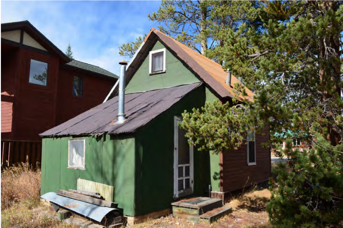
5ST.1756 • Yellow House or Pine Lodge Looking Northwest Image: 420.GAL.6