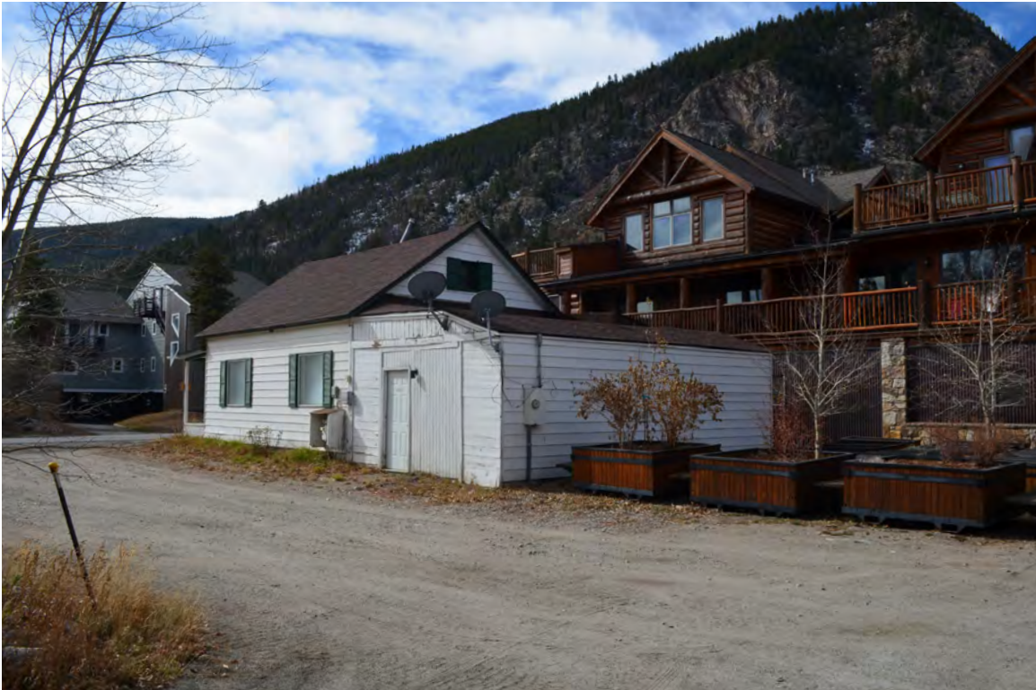
5ST.1757 • Wiley House Looking Southwest Image: 113.GRA.7