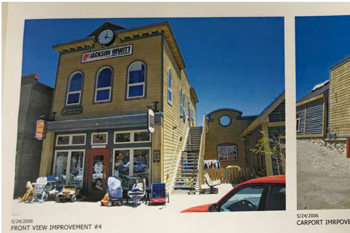
5ST.1760 • Lost Cajun Cafe Associated Buildings Looking East Image: 204.MAI.9

Summit County, Colorado May, 2006