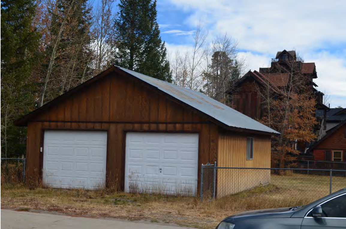
5ST.1744 • Susie Thompson House, outbuilding 2 Looking Southeast Image: 120.N4th.12