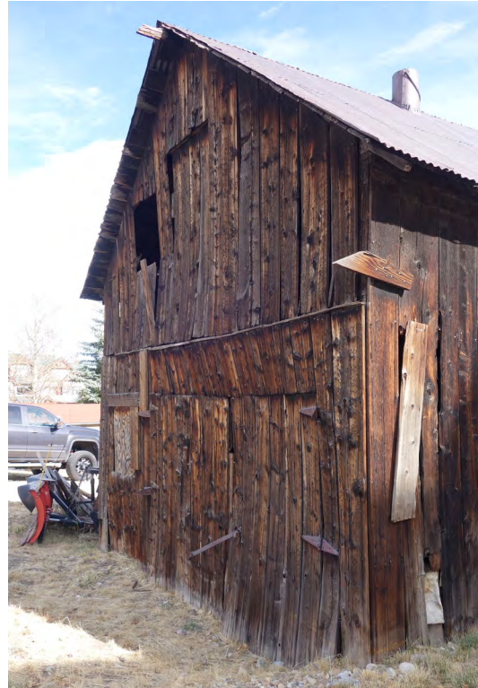
5ST.1764 • Blacksmith Shop Looking Northeast Image: 502b.MAI.6

Summit County, Colorado Date Unknown