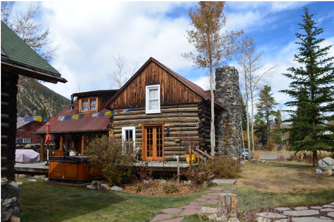
5ST.1752 • Kreamelmeyer House Looking Northwest Image: 216.GAL.5