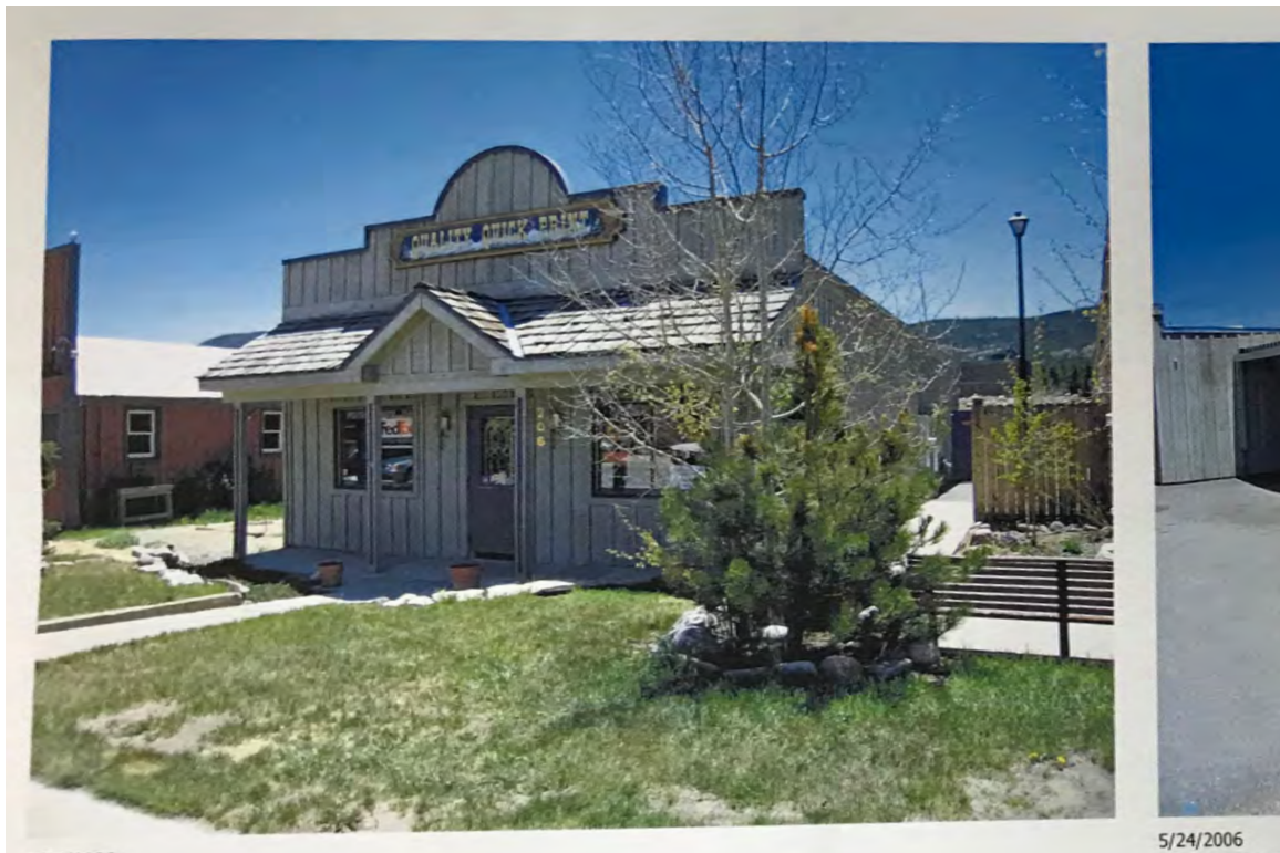
5ST.1760 • Lost Cajun Cafe Associated Buildings Looking Southeast Image: 204.MAI.10

Summit County, Colorado May, 2006