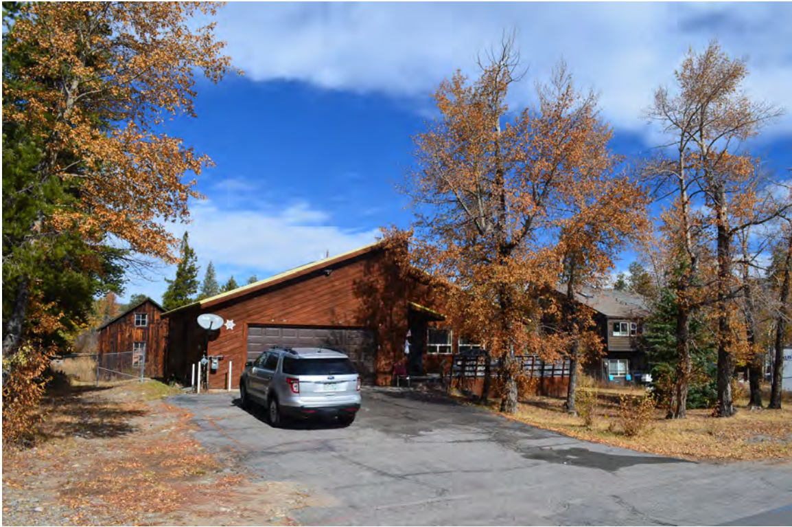
5ST.1754 • Giberson Barn Looking Southwest Image: 313.GAL.5