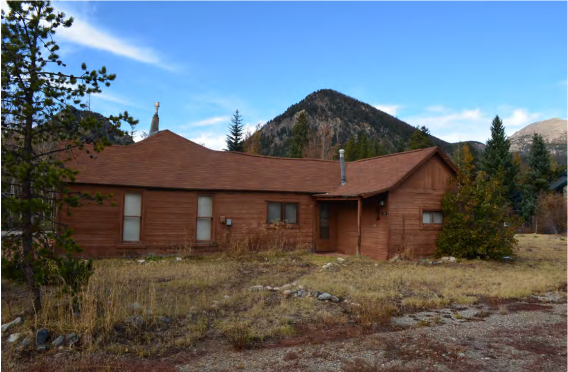
5ST.1750 Looking Northwest Image: 201.GAL.3