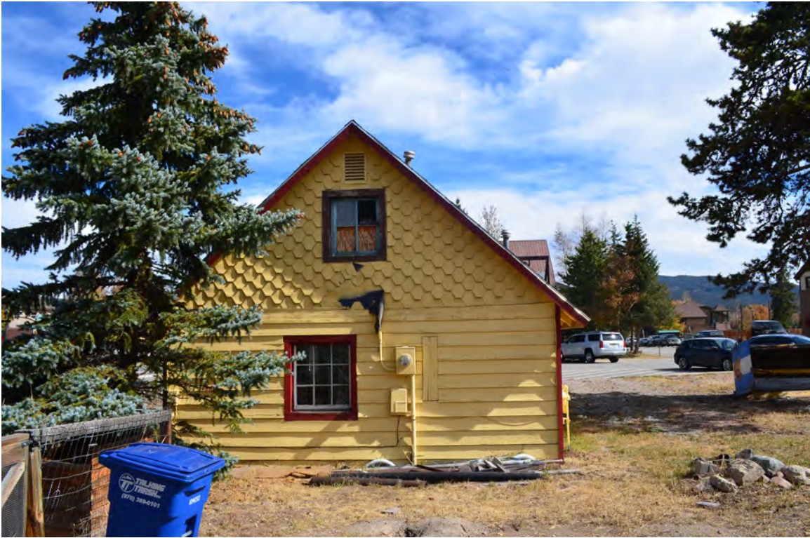
5ST.1747 Looking East Image: 107.S6th.5