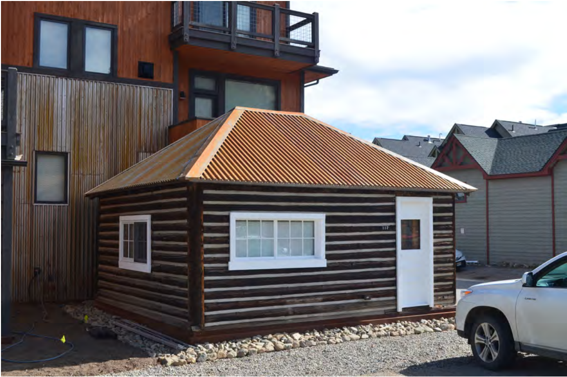
5ST.1745 • Deming Cabin Looking Southeast Image: 112.N5th.7