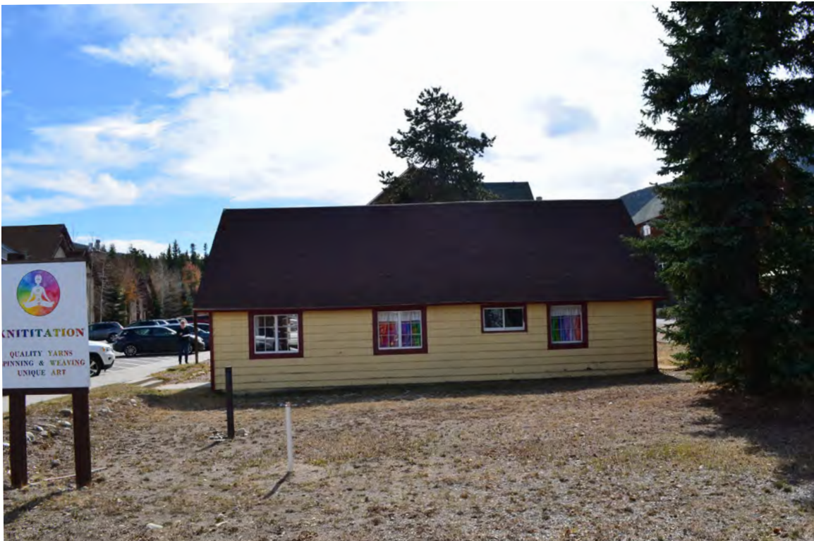
5ST.1747 Looking South Image: 107.S6th.4