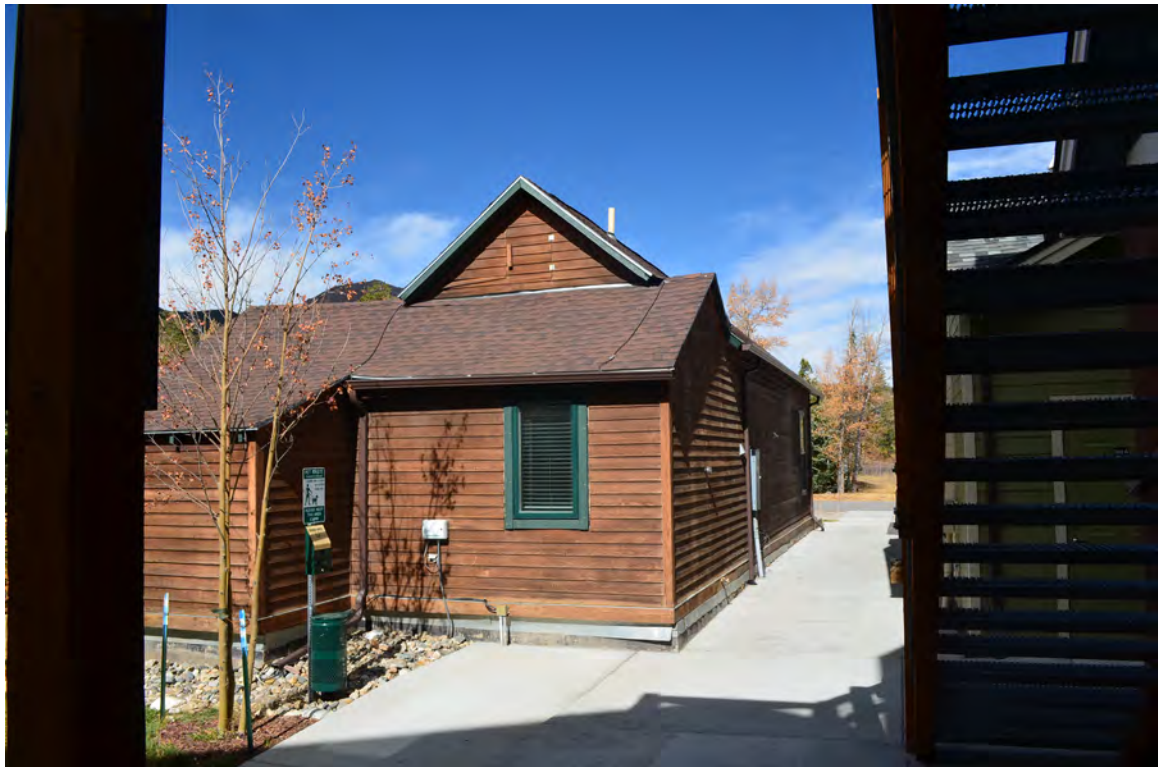
5ST.1753 • Mary Ruth House Looking East Image: 306.GAL.7