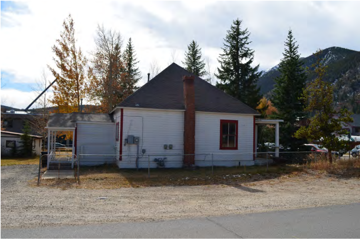
5ST.1744 • Susie Thompson House Looking Southwest Image: 120.N4th.5