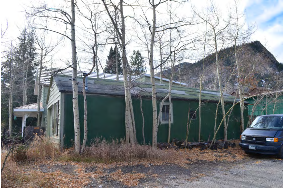
5ST.1743 • Linquist House Looking Southwest Image: 205.N3rd.6