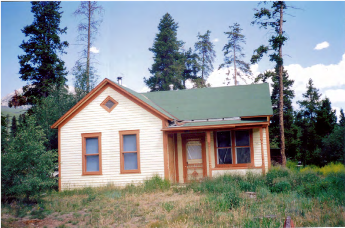
5ST.1765 • Lund House Looking North House at original location at 403 Galena St Image: 267.MAR.11

Summit County, Colorado Date Unknown