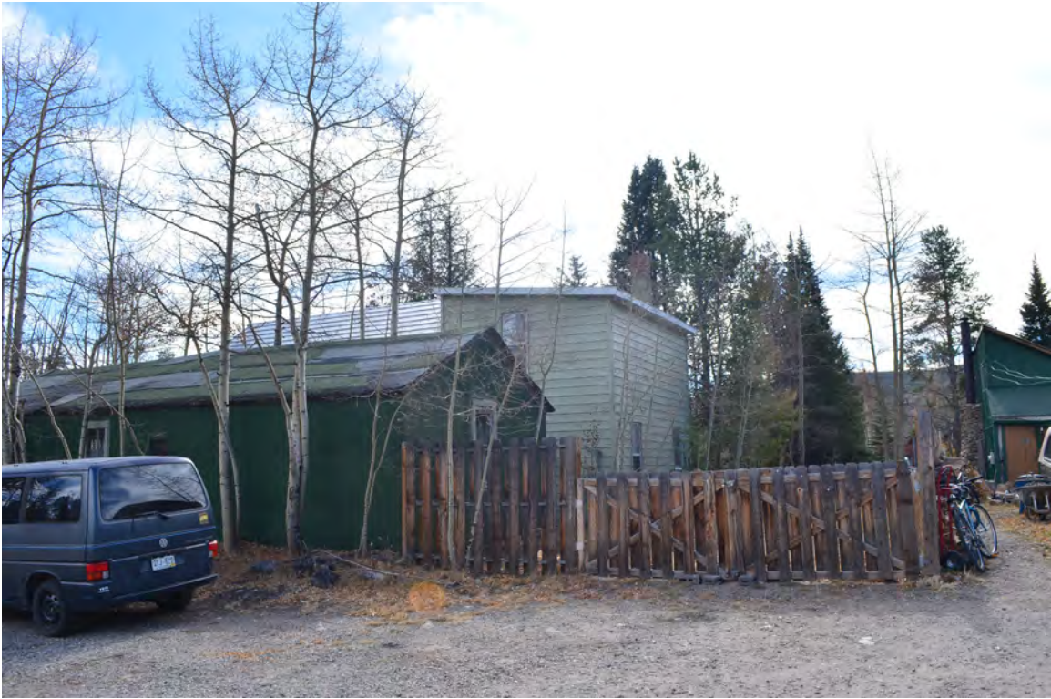
5ST.1743 • Linquist House Looking Southeast Image: 205.N3rd.5