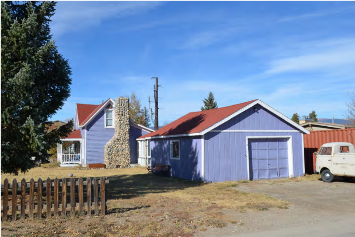
5ST.1749 Outbuilding Looking North Image: 414.8th.5