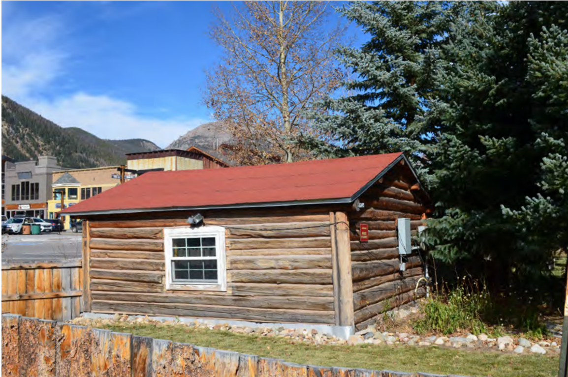
5ST.1763 • Cannam Cabins Cabin 2 Looking Northwest Image: 502a.MAI.6