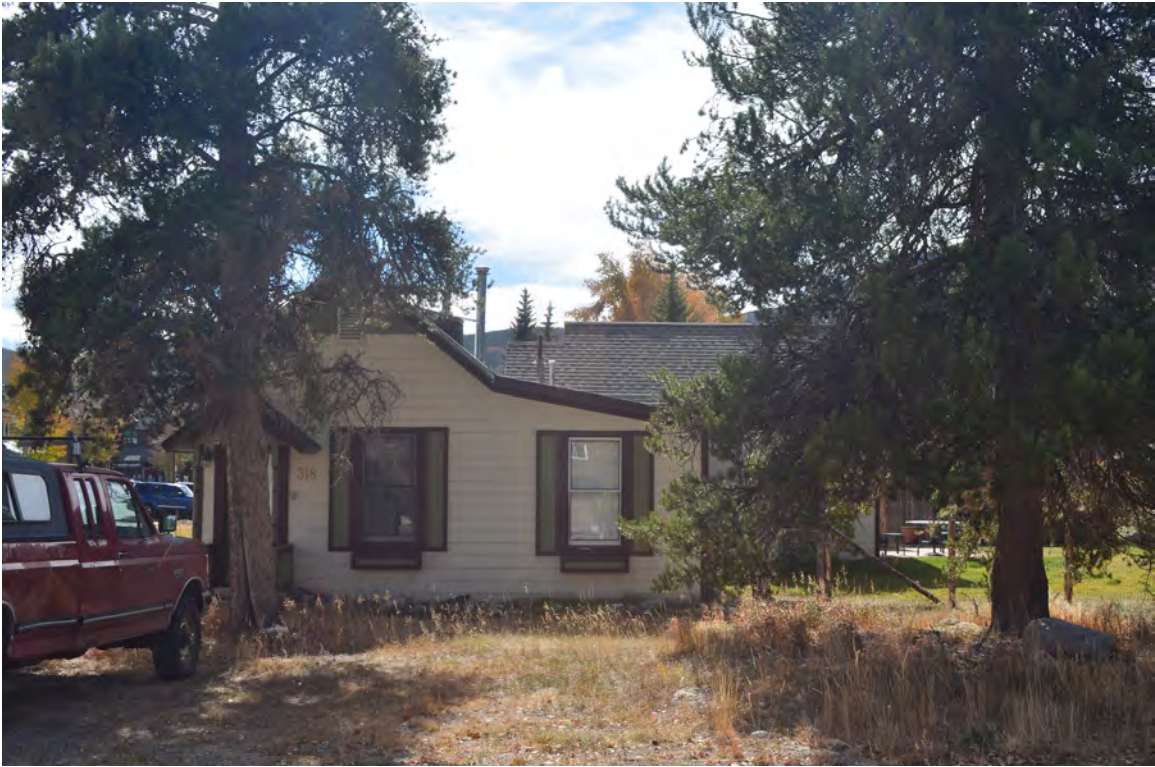
5ST.1755 • Morris House Looking South Image: 318.GAL.3