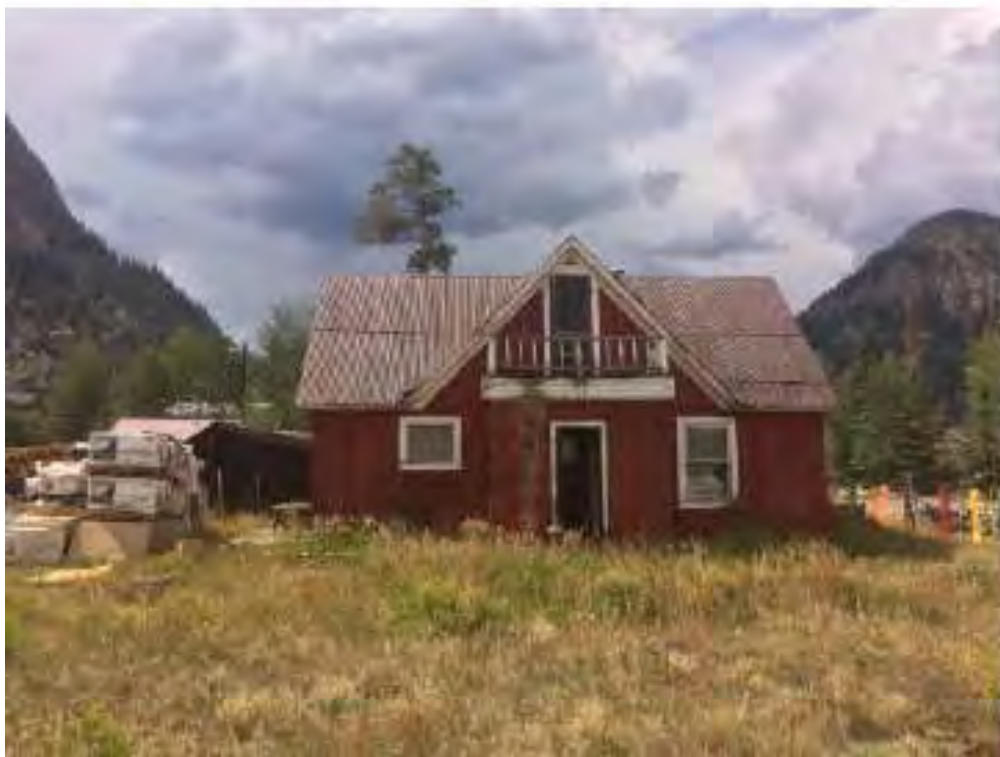
5ST.1766 • Excelsior Mine Office Appears to be looking West Image: EXCL.6

Summit County, Colorado date unknown