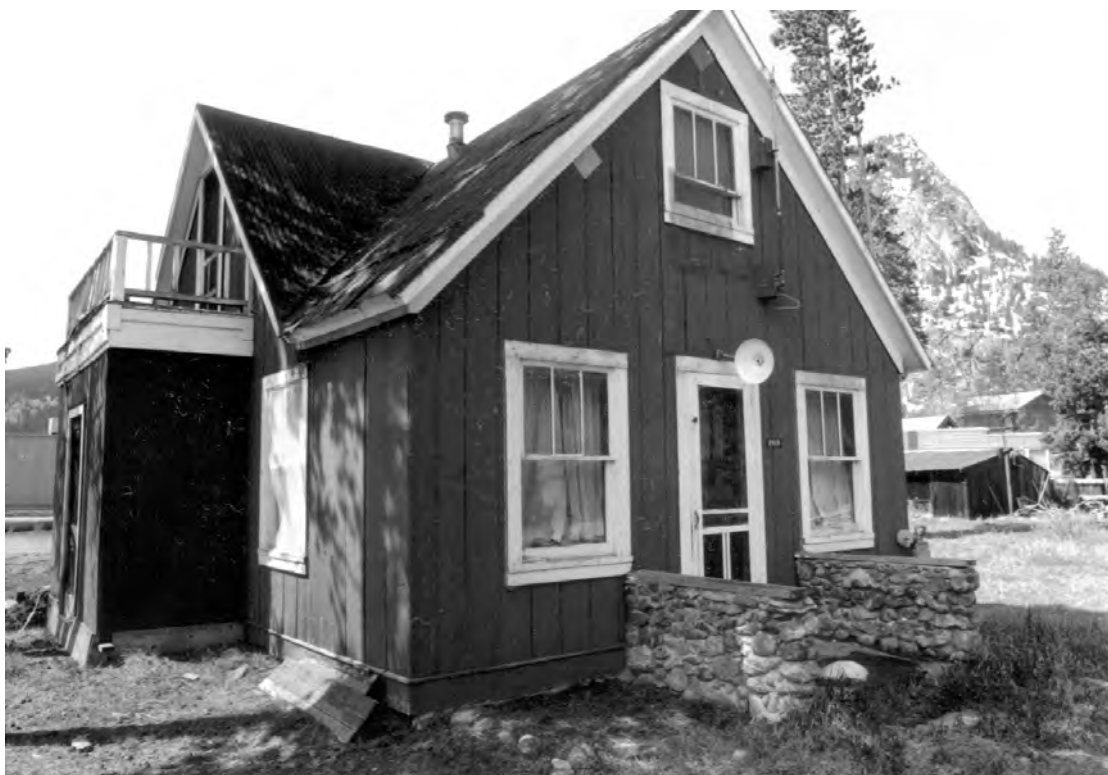
5ST.1766 • Excelsior Mine Office Appears to be looking southwest Image: EXCL.8

Summit County, Colorado date unknown