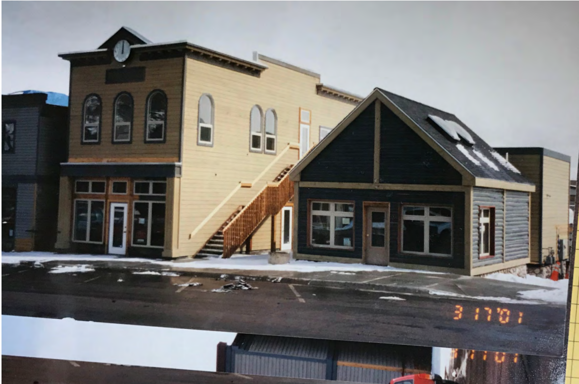
5ST.1760 • Lost Cajun Cafe Associated Buildings Looking East Image: 204.MAI.8

Summit County, Colorado March, 2001