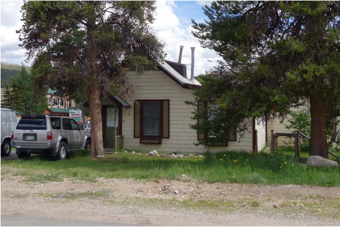
5ST.1755 • Morris House Looking South Image: 318.GAL.1