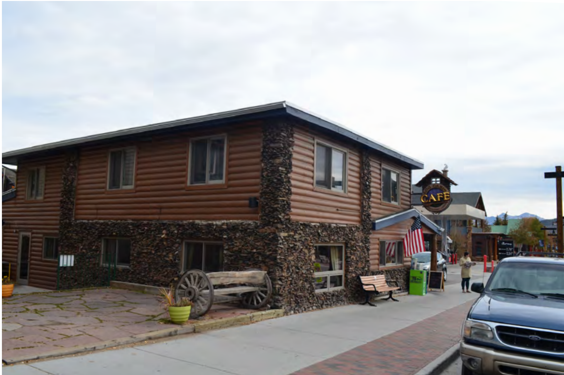
5ST.1759 • Log Cabin Cafe Looking Northeast Image: 121.MAI.2