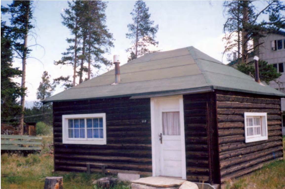
5ST.1745 • Deming Cabin Looking Northeast Image: 112.N5th.2

Summit County, Colorado Date Unknown