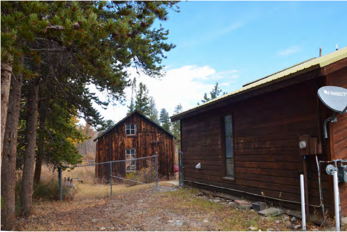
5ST.1754 • Giberson Barn Looking North Image: 313.GAL.1