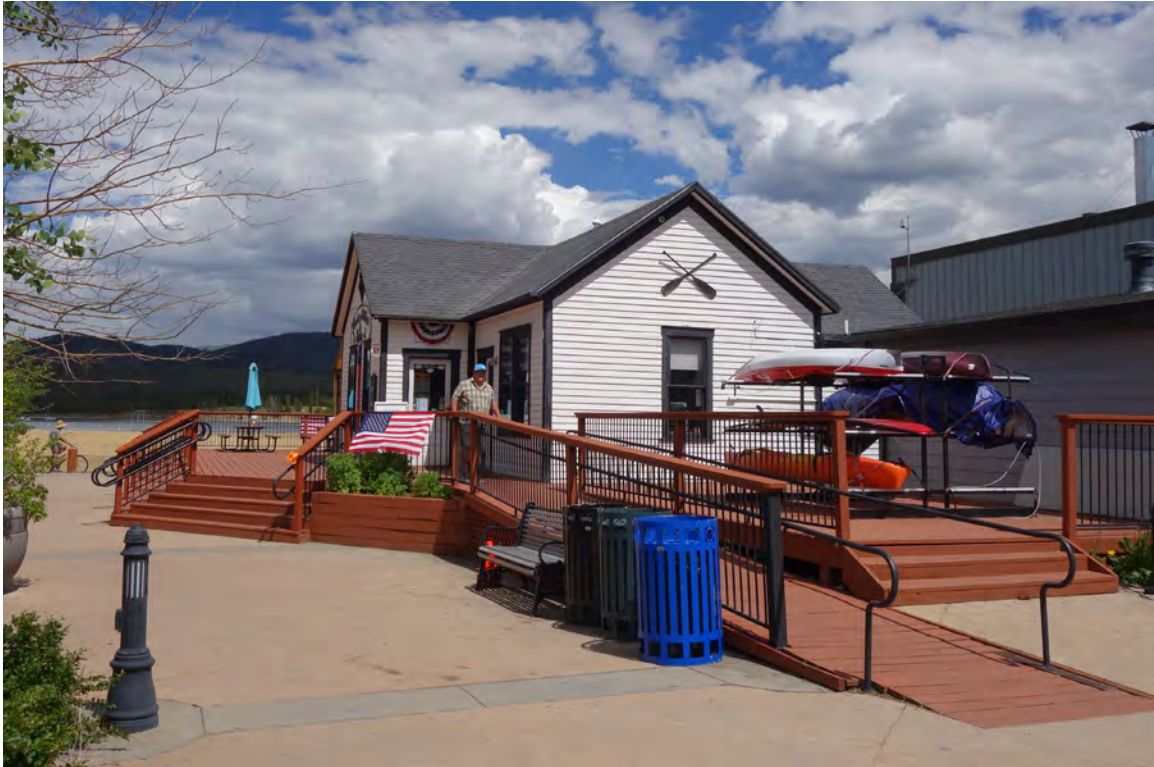
5ST.1765 • Lund House Looking East Image: 267.MAR.2