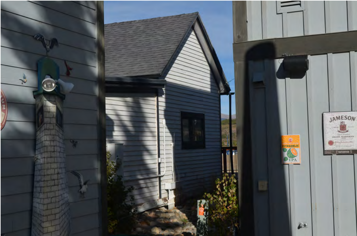
5ST.1765 • Lund House Looking Northeast Image: 267.MAR.5