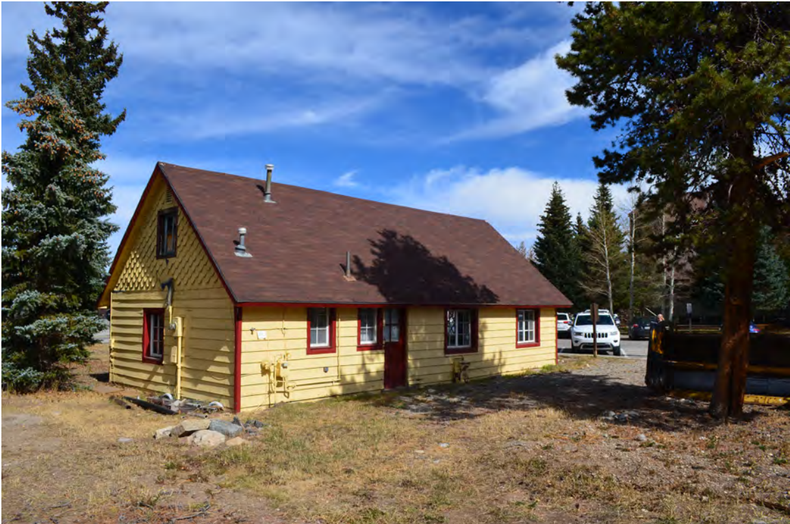
5ST.1747 Looking Northeast Image: 107.S6th.3