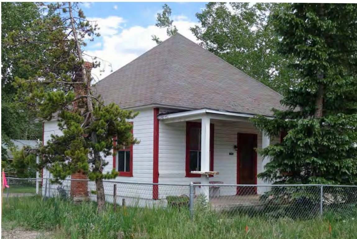
5ST.1744 • Susie Thompson House Looking Southeast Image: 120.N4th.1