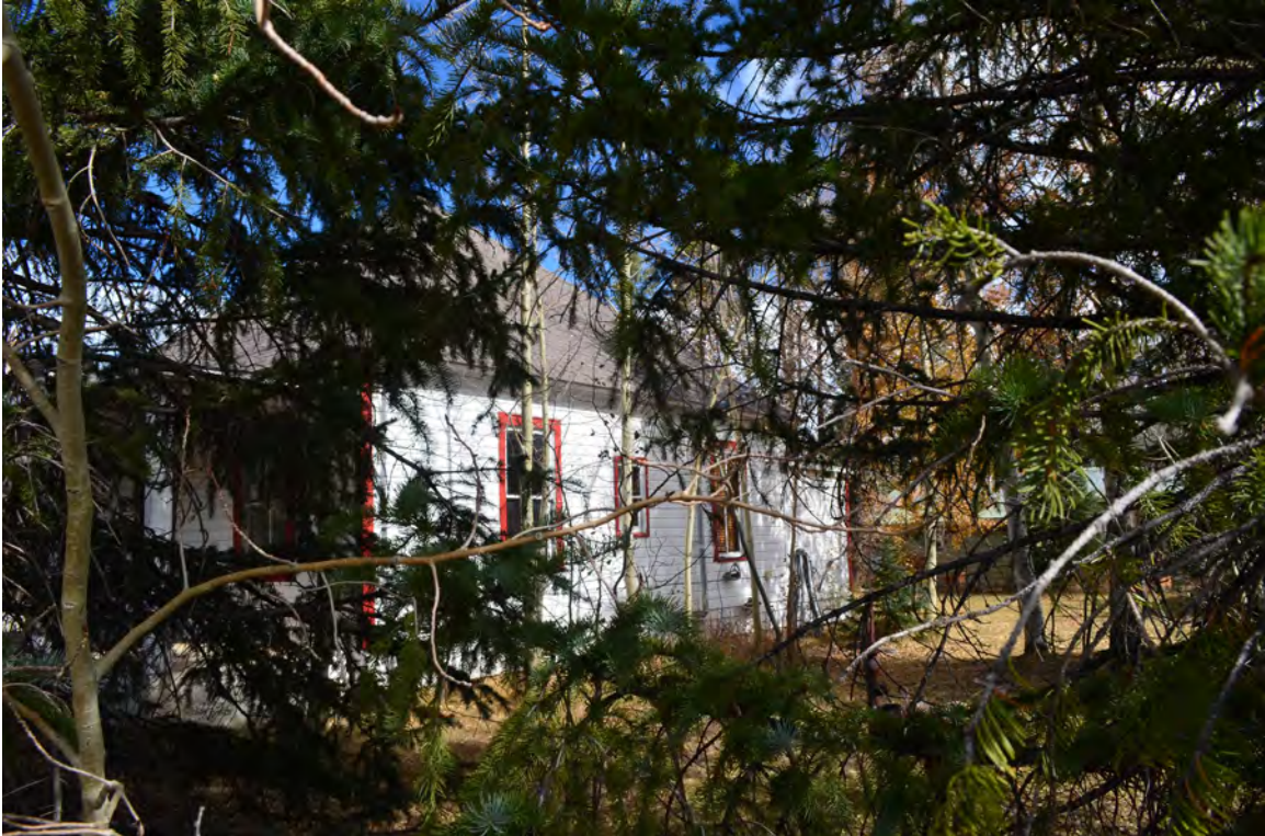
5ST.1744 • Susie Thompson House Looking Northeast Image: 120.N4th.8