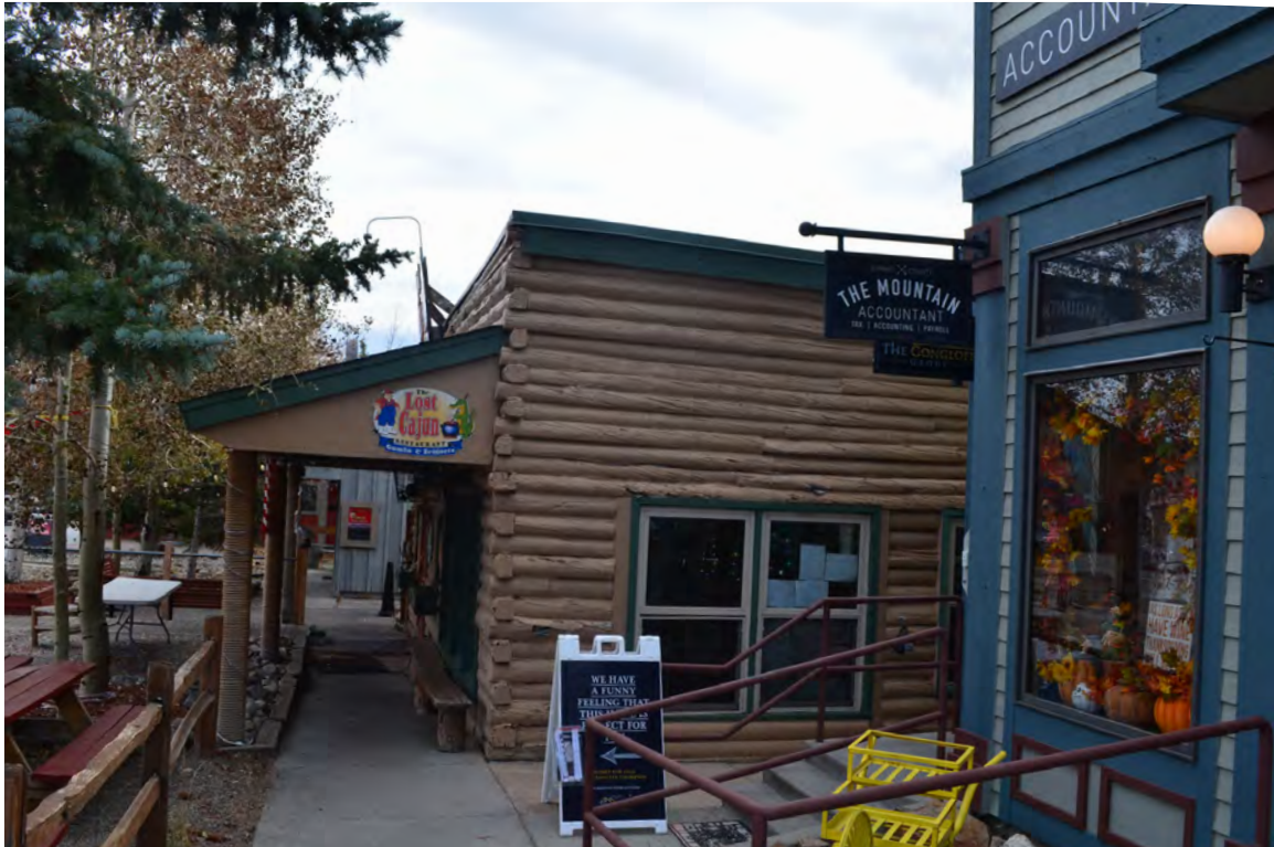
5ST.1760 • Lost Cajun Cafe Looking East Image: 204.MAI.2