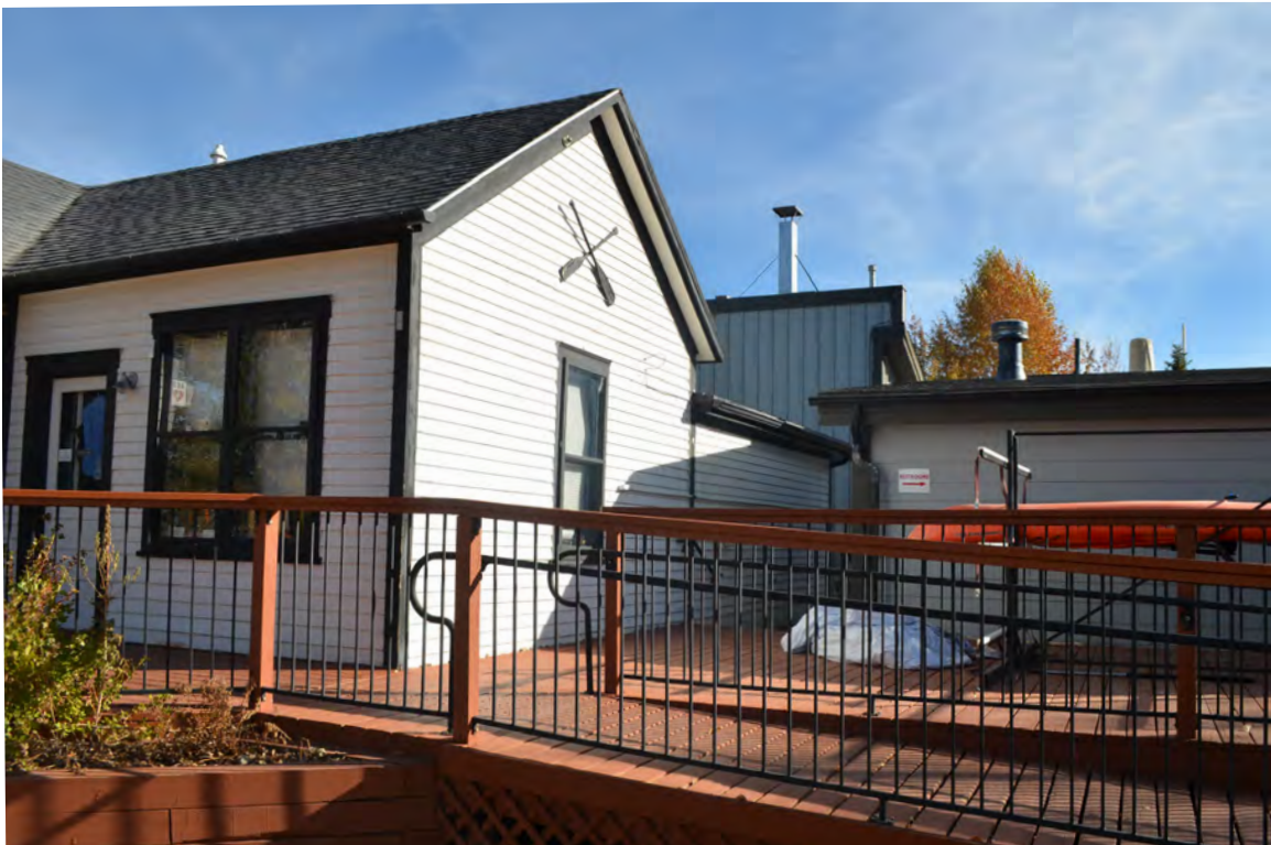
5ST.1765 • Lund House Looking Southeast Image: 267.MAR.4