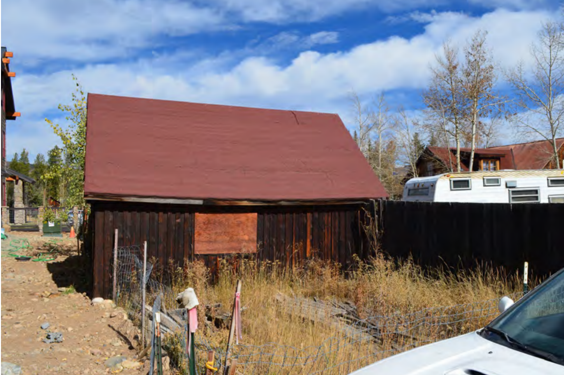
5ST.1751 • Mumford House Looking North Image: 212.GAL.8