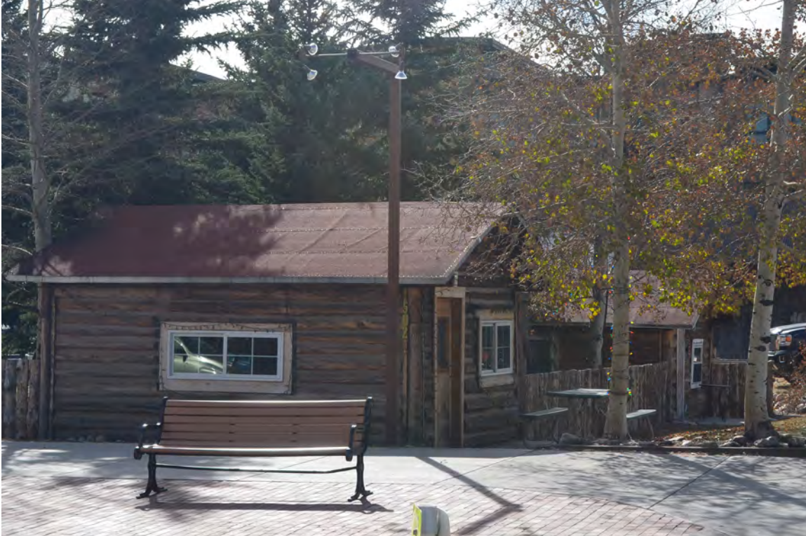
5ST.1763 • Cannam Cabins Both Cabins Looking Southeast Image: 502a.MAI.8