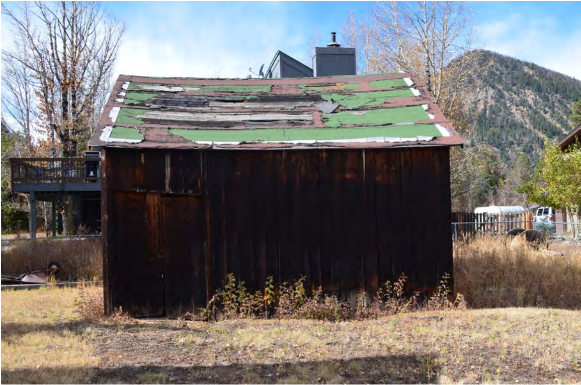
5ST.1754 • Giberson Barn Looking West Image: 313.GAL.3