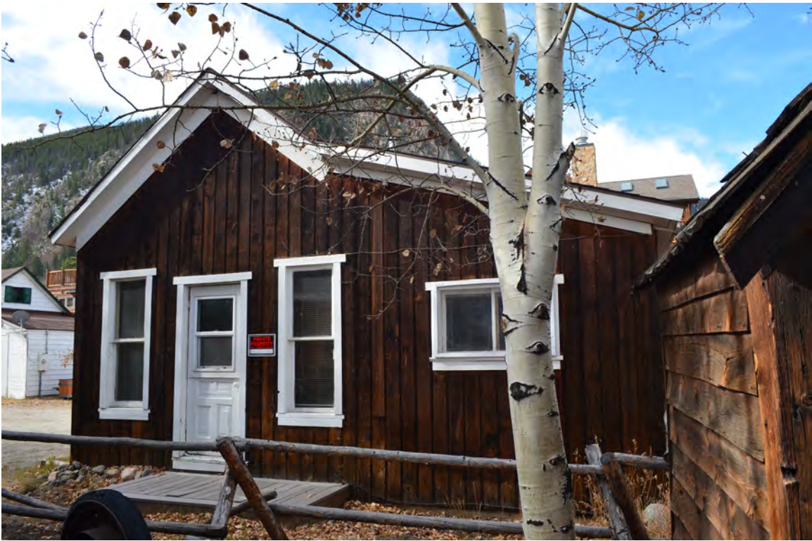
5ST.1758 Looking East Image: 117.GRA.1