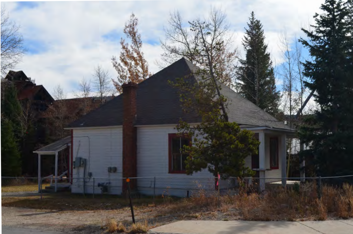
5ST.1744 • Susie Thompson House Looking Southeast Image: 120.N4th.4