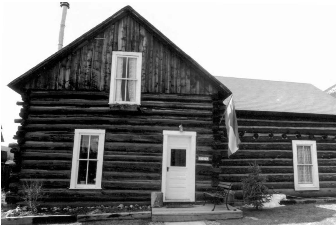
5ST.1752 • Kreamelmeyer House Looking South Image: 216.GAL.6

Summit County, Colorado Date Unknown