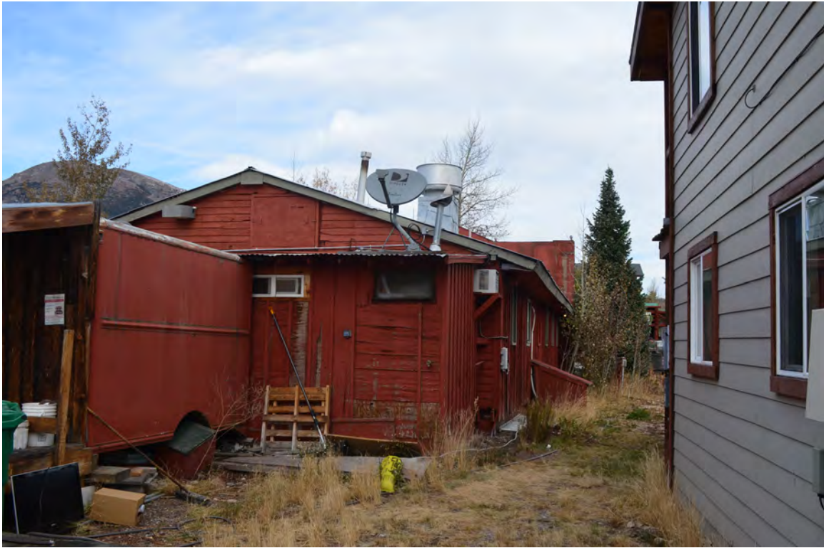
5ST.1761 • Moose Jaw Cafe Looking North Image: 208.MAI.7