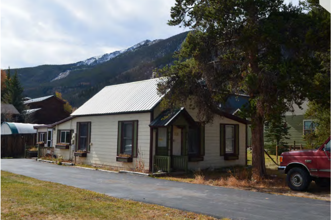
5ST.1755 • Morris House Looking Southwest Image: 318.GAL.4