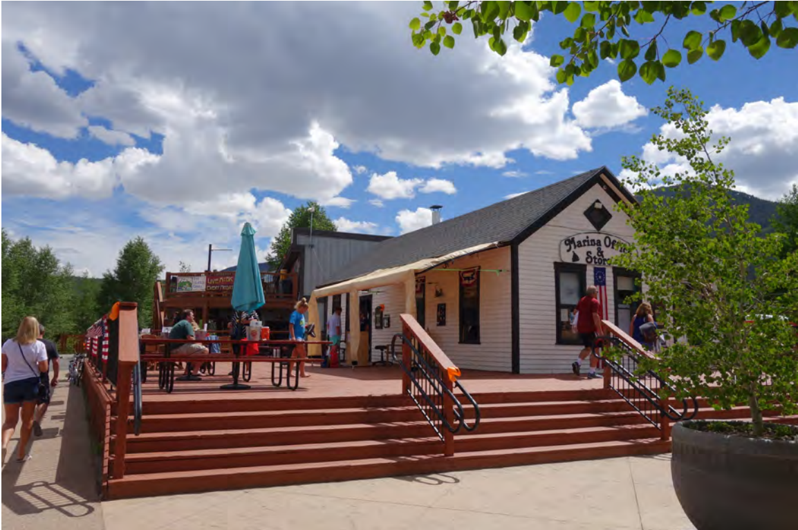
5ST.1765 • Lund House Looking Southwest Image: 267.MAR.8