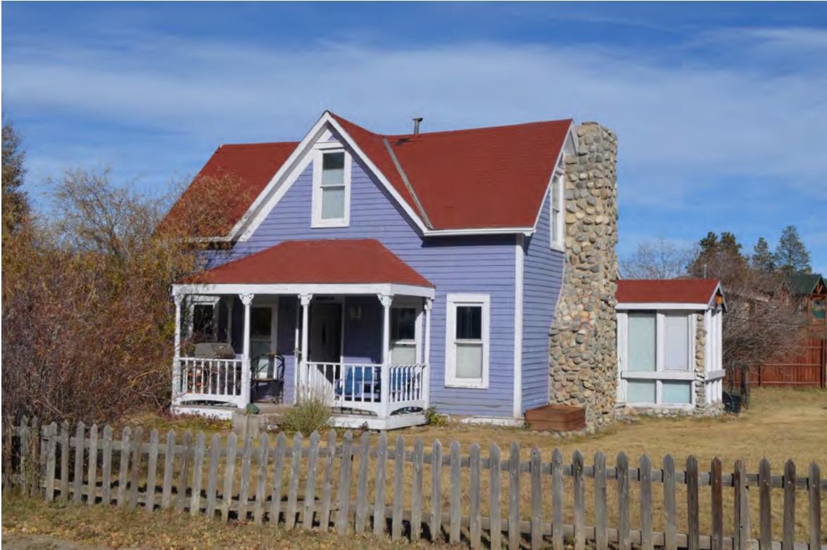
5ST.1749 Looking East Image: 414.8th.2