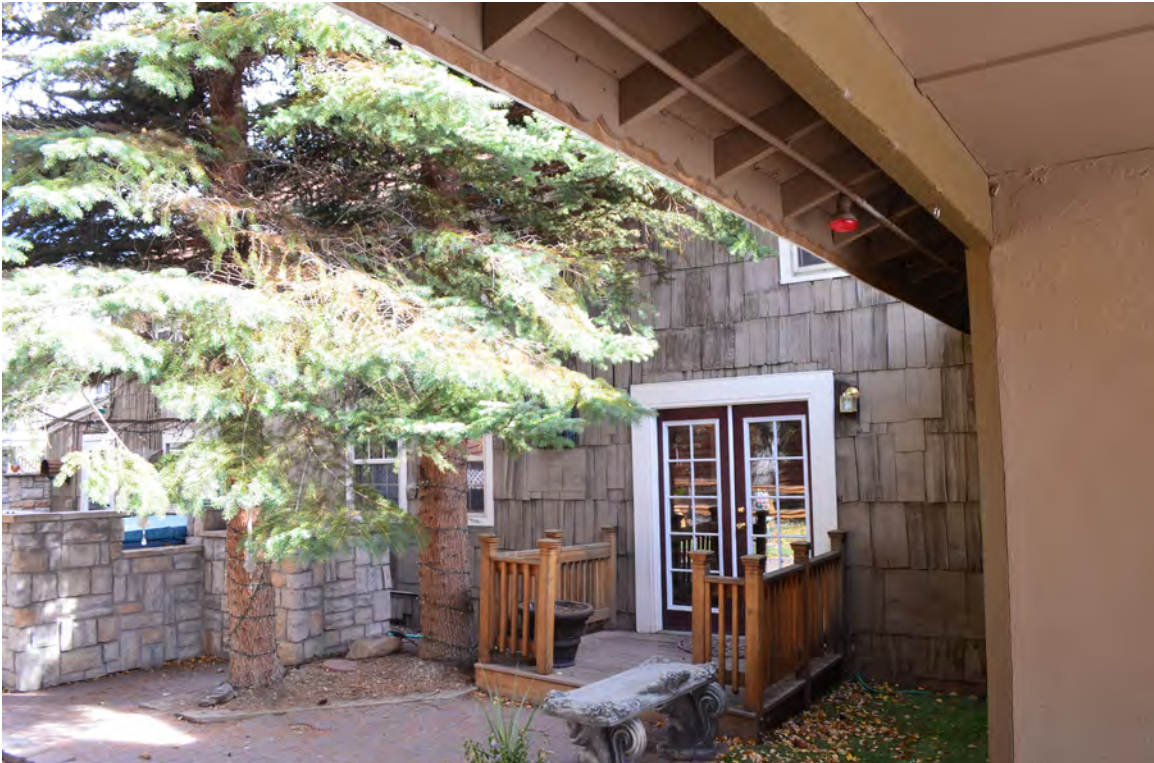
5ST.282 • Frisco Lodge Looking East Image: 321.MAI.8