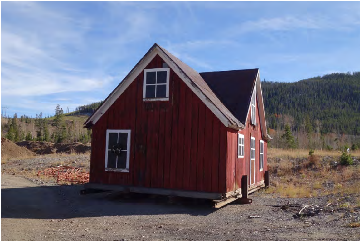
5ST.1766 • Excelsior Mine Office Looking Southwest Image: EXCL.5