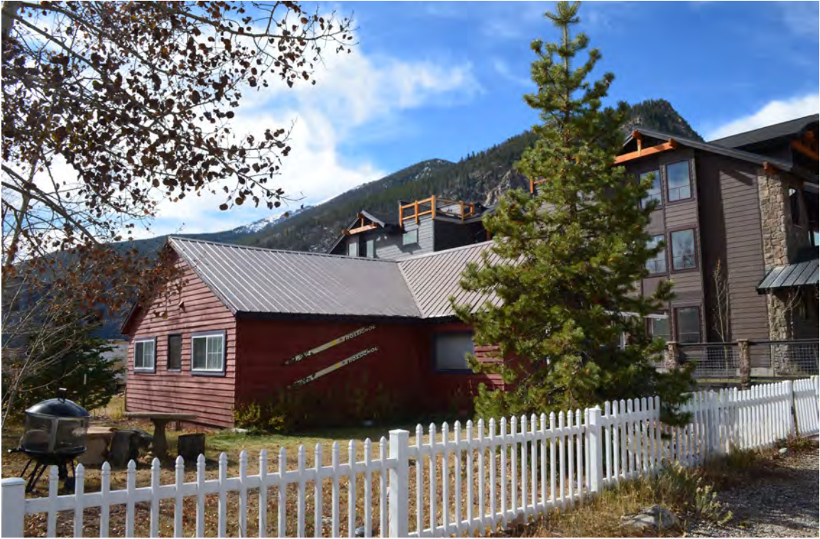
5ST.1751 • Mumford House Looking Southwest Image: 212.GAL.3