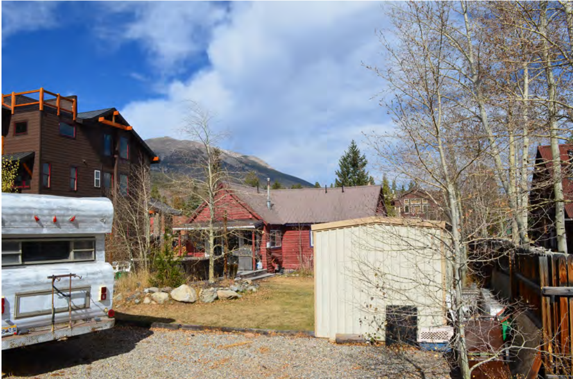
5ST.1751 • Mumford House Looking North Image: 212.GAL.6