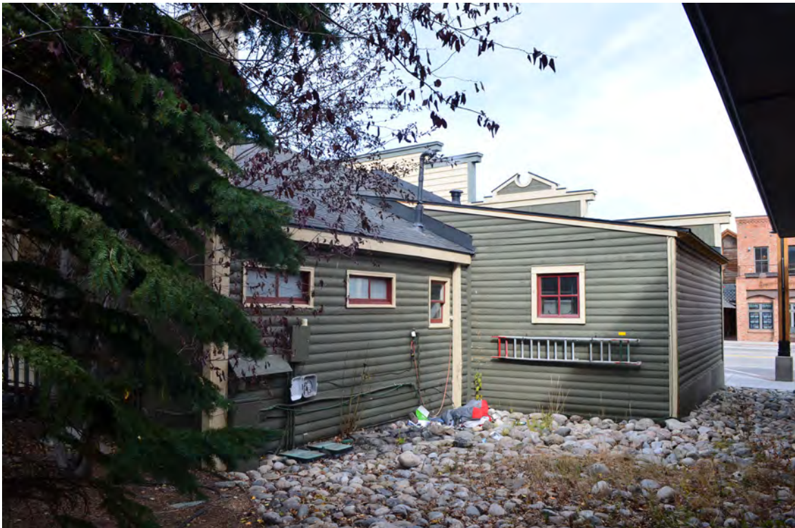
5ST.1073 • Historic Frisco Town Hall Looking Northwest Image: 300.MAI.5