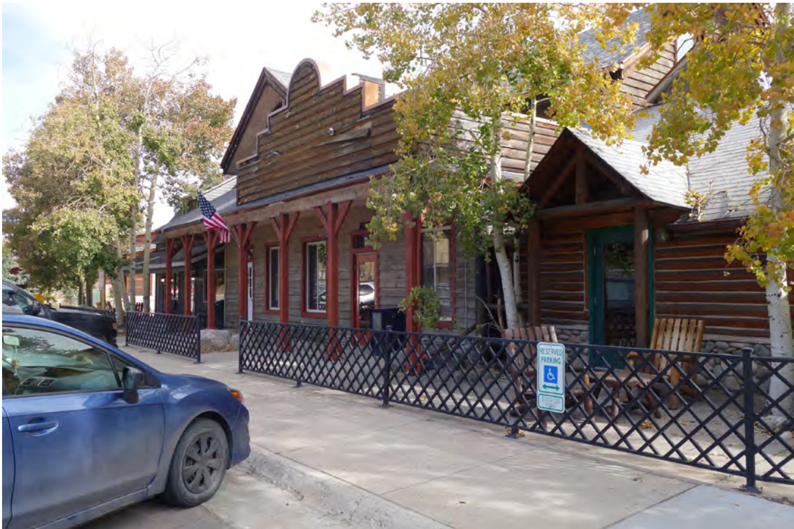
5ST.1762 Looking Northeast Image: 301.MAI.5