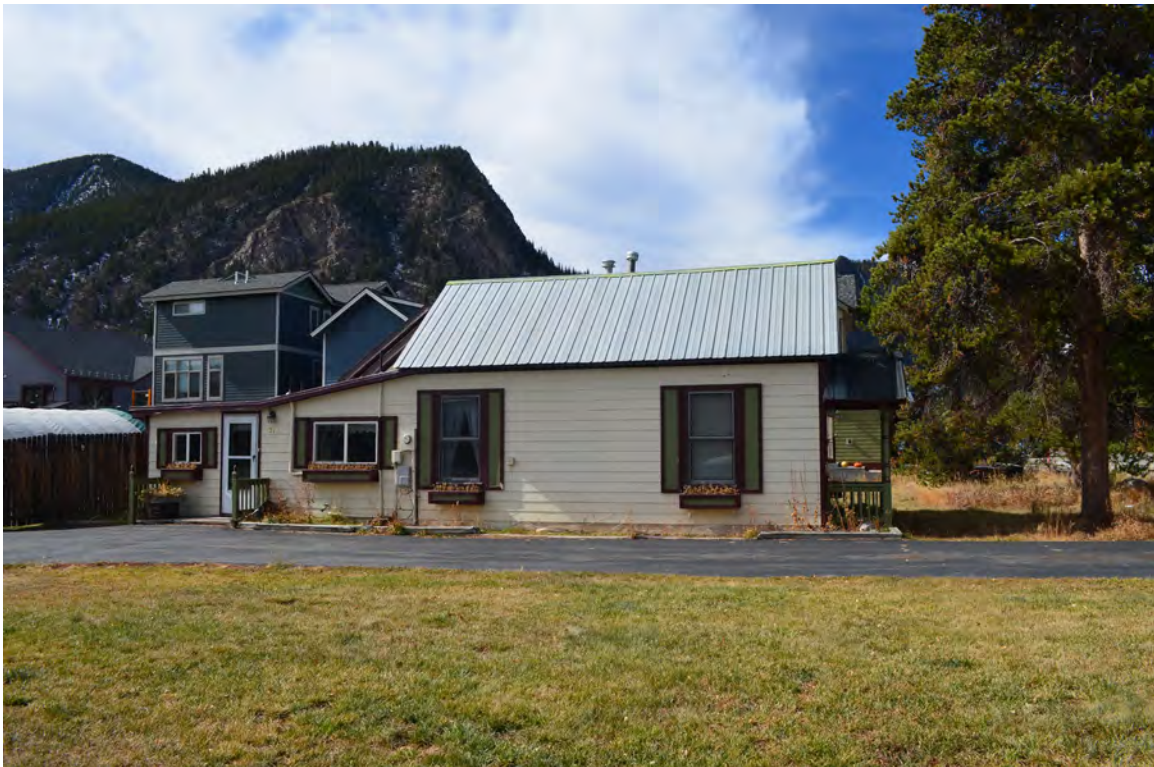
5ST.1755 • Morris House Looking West Image: 318.GAL.5