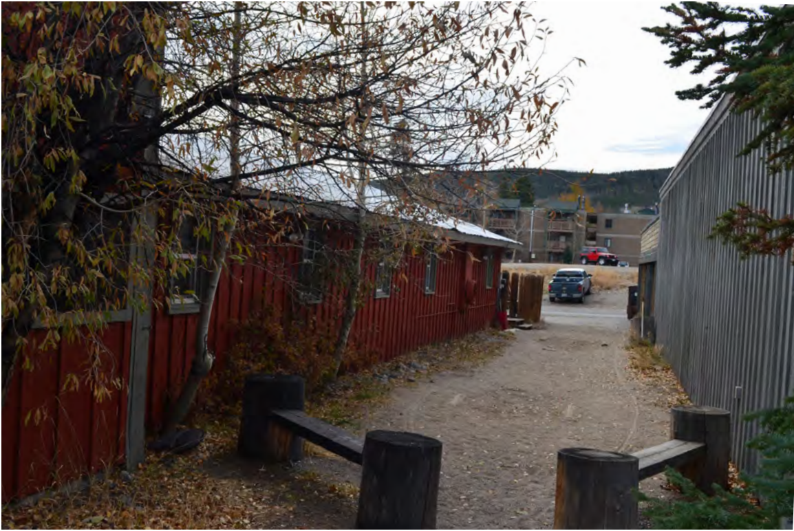
5ST.1761 • Moose Jaw Cafe Looking Southeast Image: 208.MAI.3