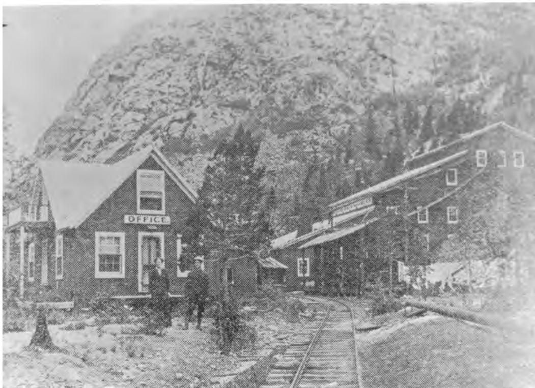
5ST.1766 • Excelsior Mine Office Unknown view direction Image: EXCL.7

Summit County, Colorado date unknown