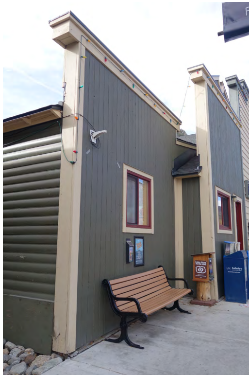
5ST.1073 • Historic Frisco Town Hall Looking West, detail Image: 300.MAI.7