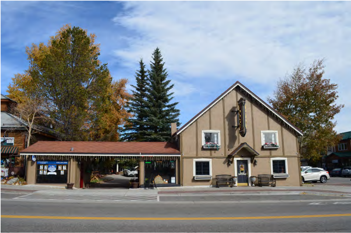
5ST.282 • Frisco Lodge Looking North Image: 321.MAI.1