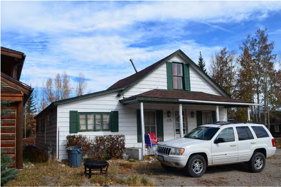
5ST.1757 • Wiley House Looking Northeast Image: 113.GRA.1