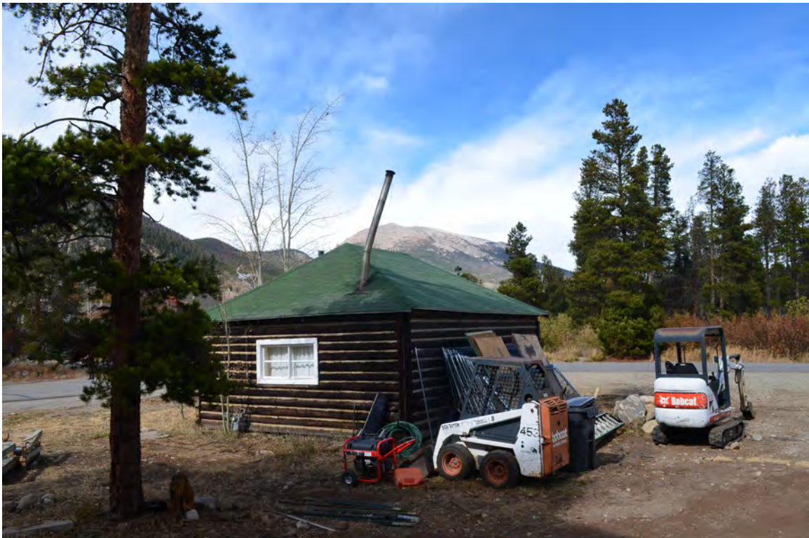
5ST.1746 • Deming Cabin Looking Northwest Image: 116.N5th.5