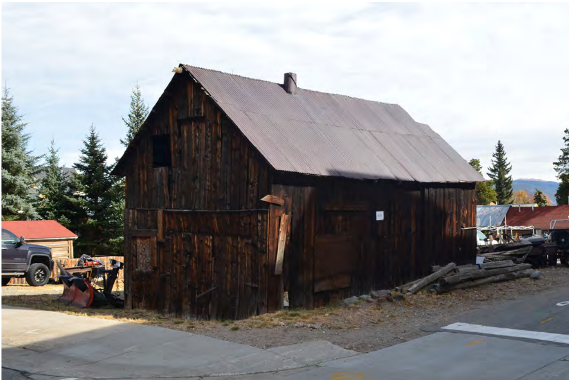
5ST.1764 • Blacksmith Shop Looking Northeast Image: 502b.MAI.1