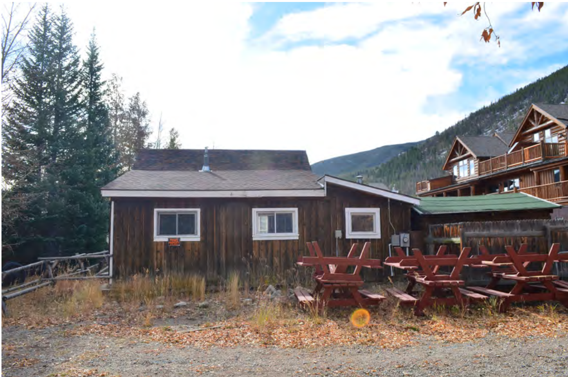
5ST.1758 Looking East Image: 117.GRA.5