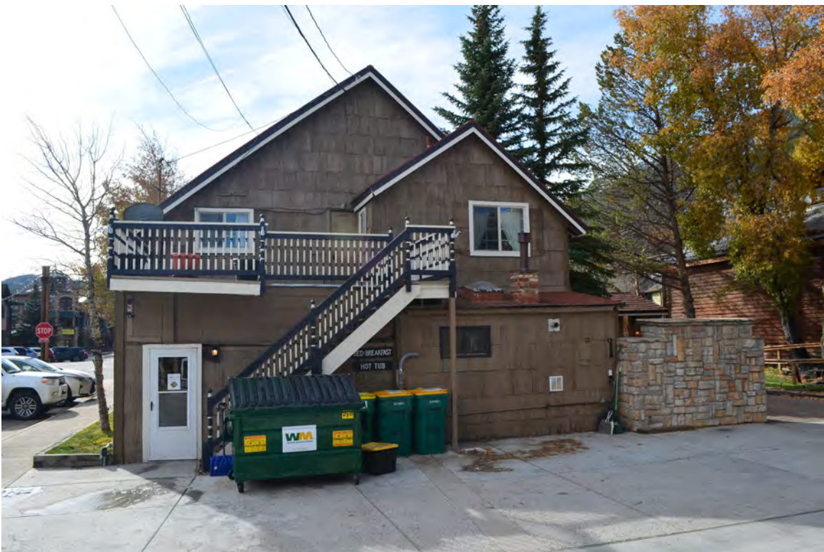
5ST.282 • Frisco Lodge Looking South Image: 321.MAI.6