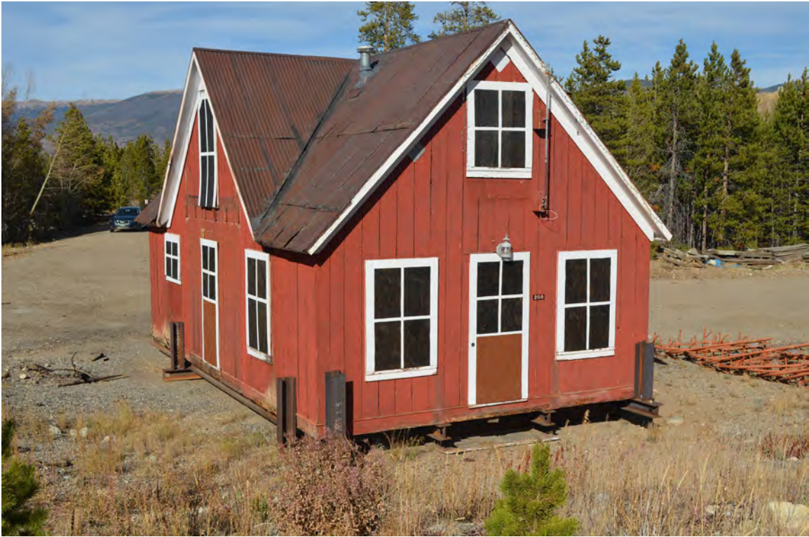
5ST.1766 • Excelsior Mine Office Looking Southeast* Image: EXCL.1