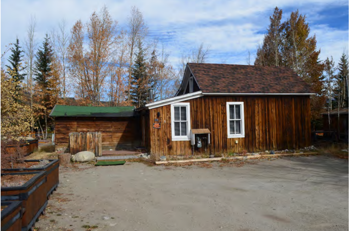
5ST.1758 Looking North Image: 117.GRA.4