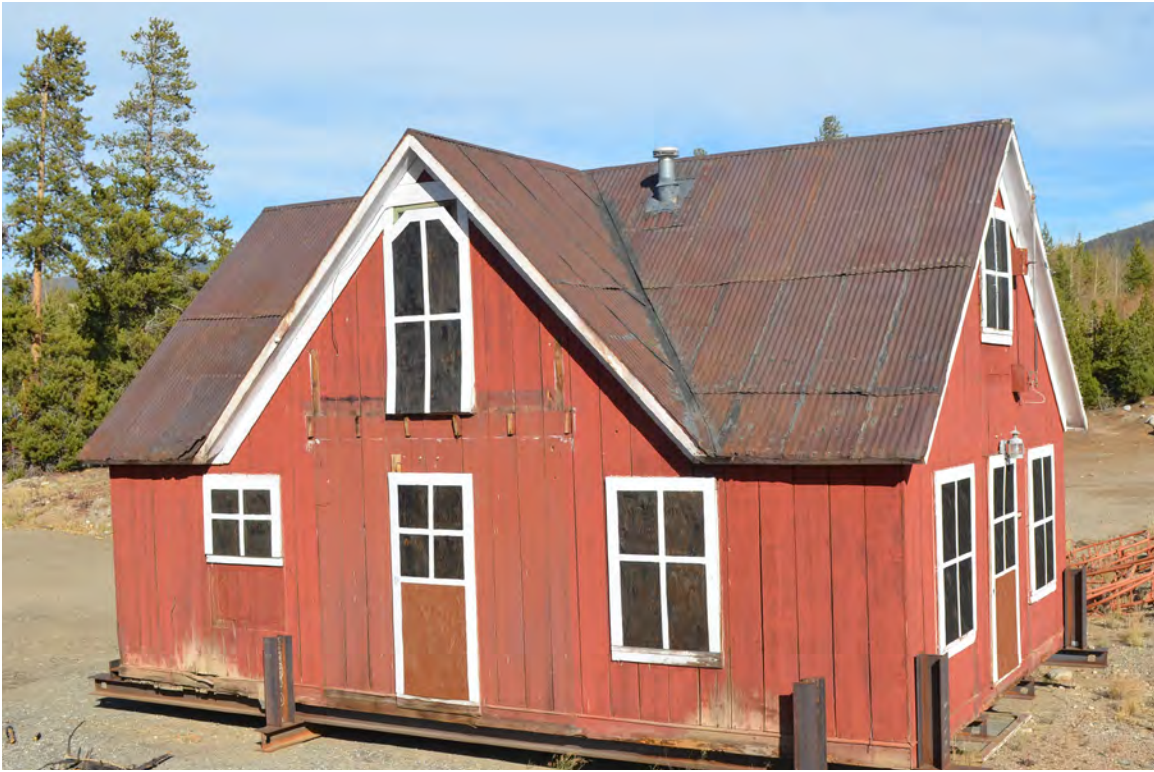
5ST.1766 • Excelsior Mine Office Looking South Image: EXCL.3