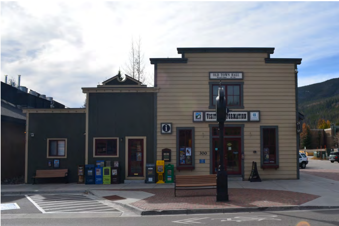
5ST.1073 • Historic Frisco Town Hall Looking South Image: 300.MAI.1