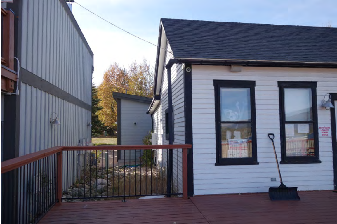
5ST.1765 • Lund House Looking Southwest Image: 267.MAR.10