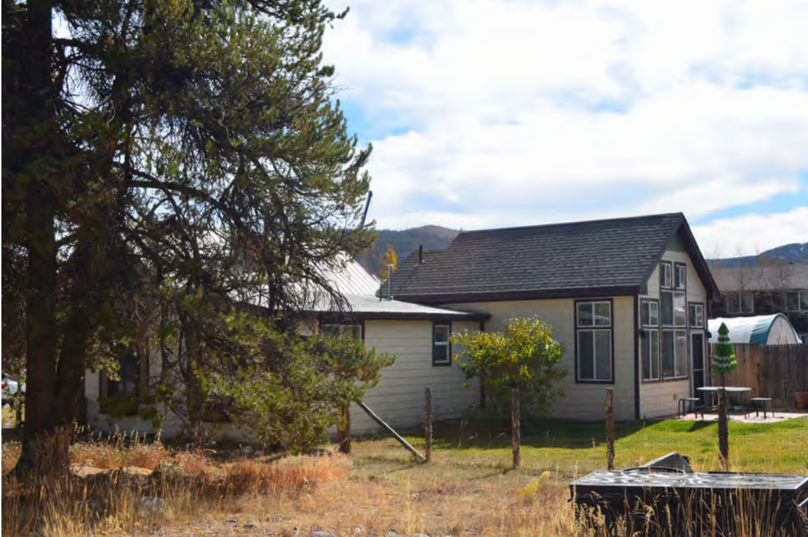
5ST.1755 • Morris House Looking Southeast Image: 318.GAL.8