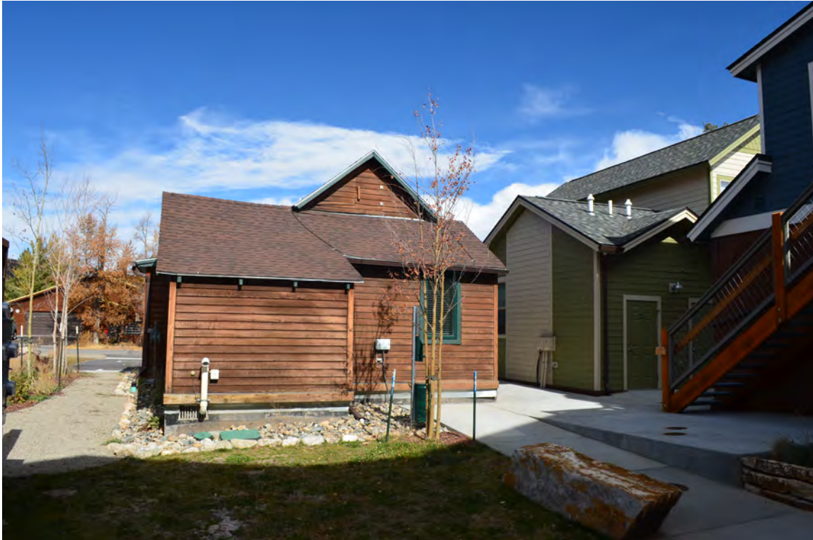
5ST.1753 • Mary Ruth House Looking North Image: 306.GAL.6