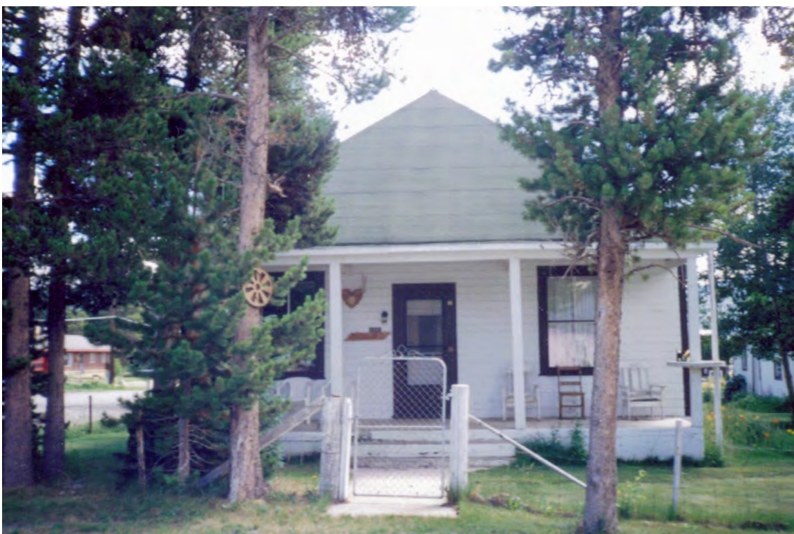
5ST.1744 • Susie Thompson House Looking East Image: 120.N4th.2

Summit County, Colorado Date Unknown