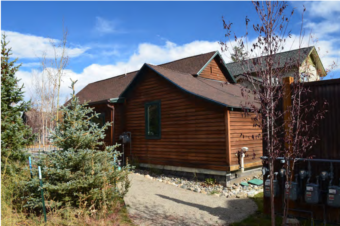
5ST.1753 • Mary Ruth House Looking Northeast Image: 308.GAL.5