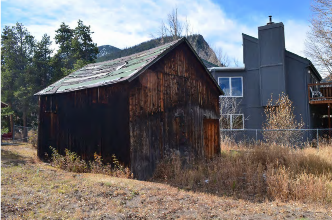
5ST.1754 • Giberson Barn Looking Southwest Image: 313.GAL.4