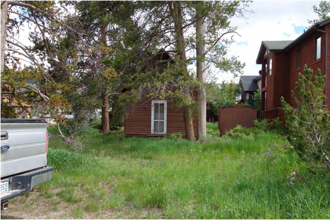
5ST.1756 • Yellow House or Pine Lodge Looking South Image: 420.GAL.3