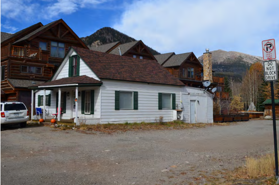
5ST.1757 • Wiley House Looking Northwest Image: 113.GRA.4

Summit County, Colorado 1922