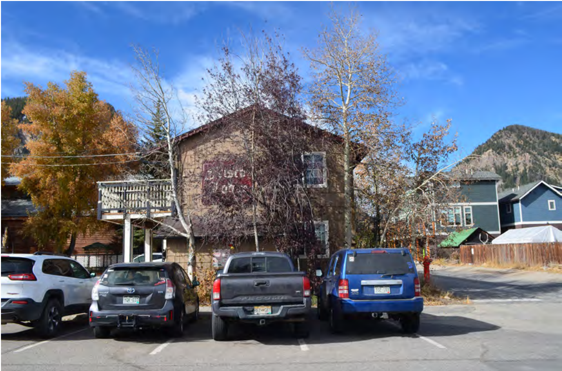
5ST.282 • Frisco Lodge, annex Looking West Image: 321.MAI.10

Summit County, Colorado date unknown