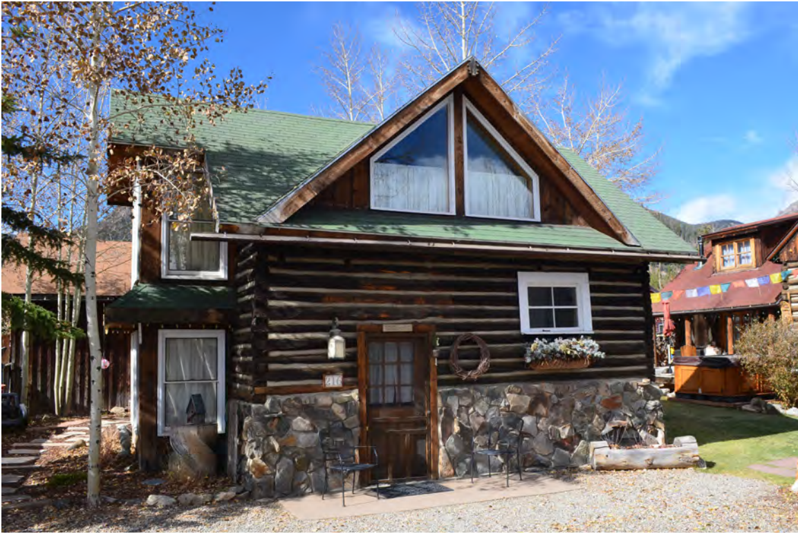
5ST.1752 • Kreamelmeyer House Looking West, Outbuilding 1 Image: 216.GAL.7