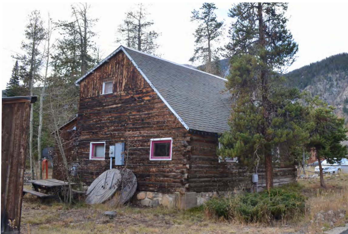
Summit County, Colorado April 2020