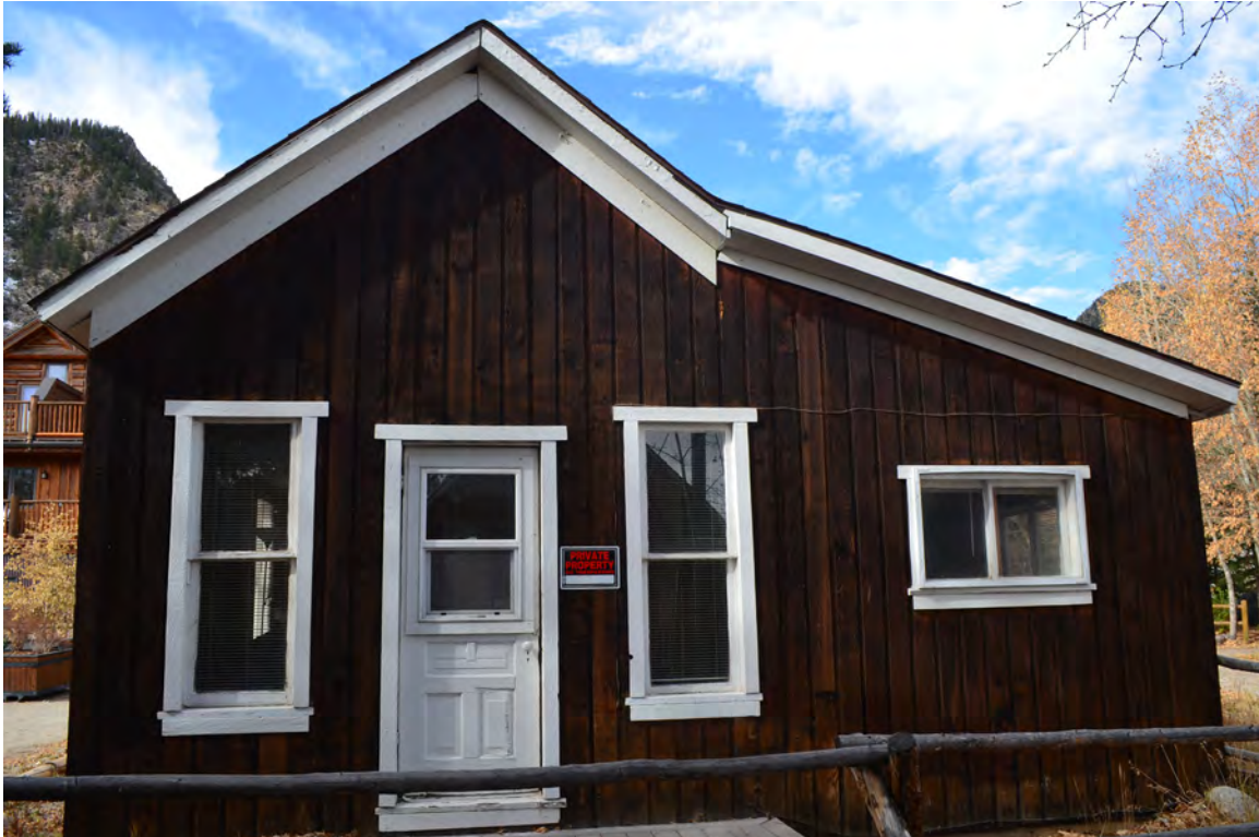
5ST.1758 Looking East Image: 117.GRA.2