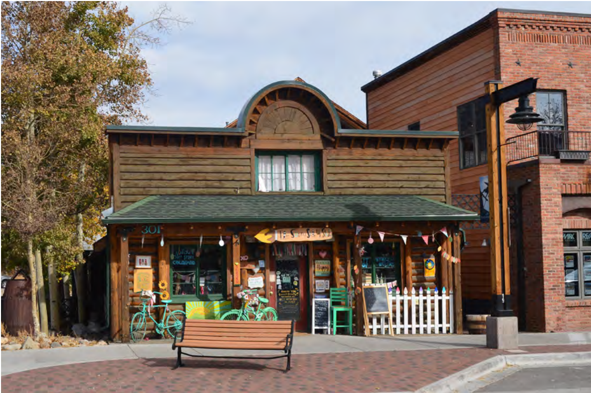
5ST.1762 Looking North Image: 301.MAI.1