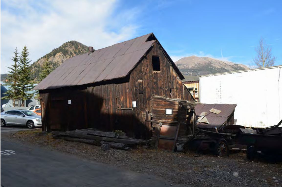
5ST.1764 • Blacksmith Shop Looking Northwest Image: 502b.MAI.4