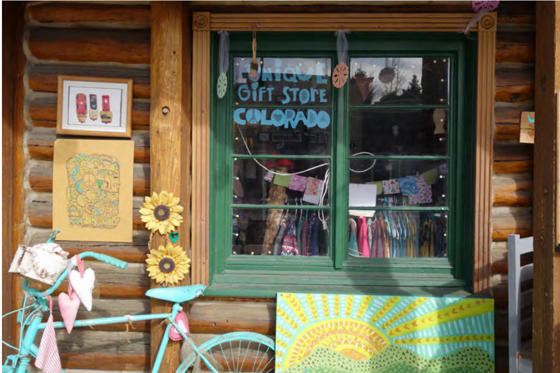
5ST.1762 Looking North, detail Image: 301.MAI.6