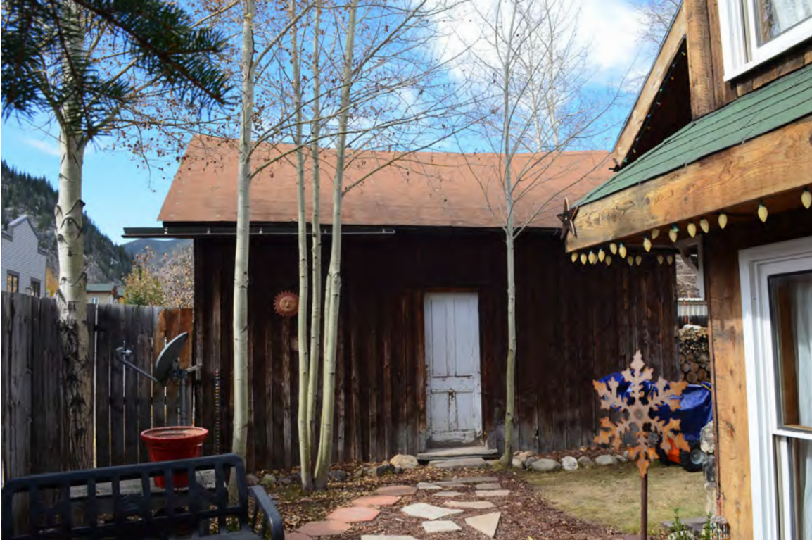
5ST.1752 • Kreamelmeyer House Looking West, Outbuilding 2 Image: 216.GAL.12