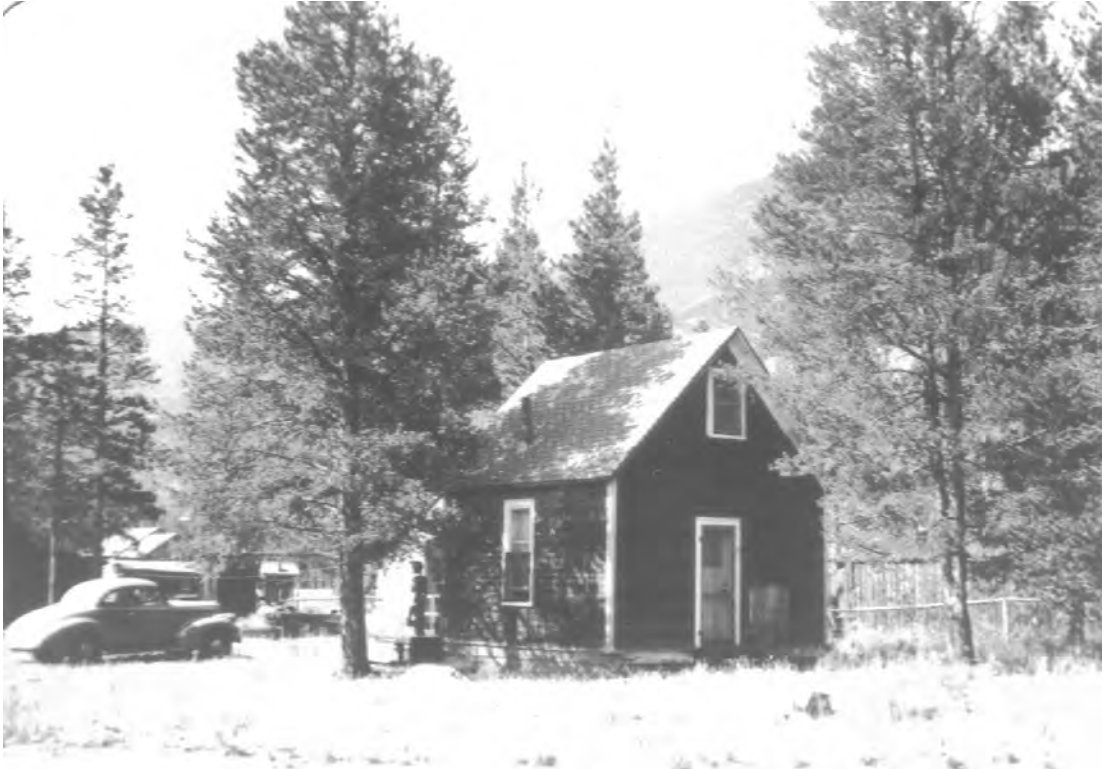
5ST.1756 • Yellow House or Pine Lodge Looking Southwest Image: 420.GAL.2

Summit County, Colorado Date Unknown