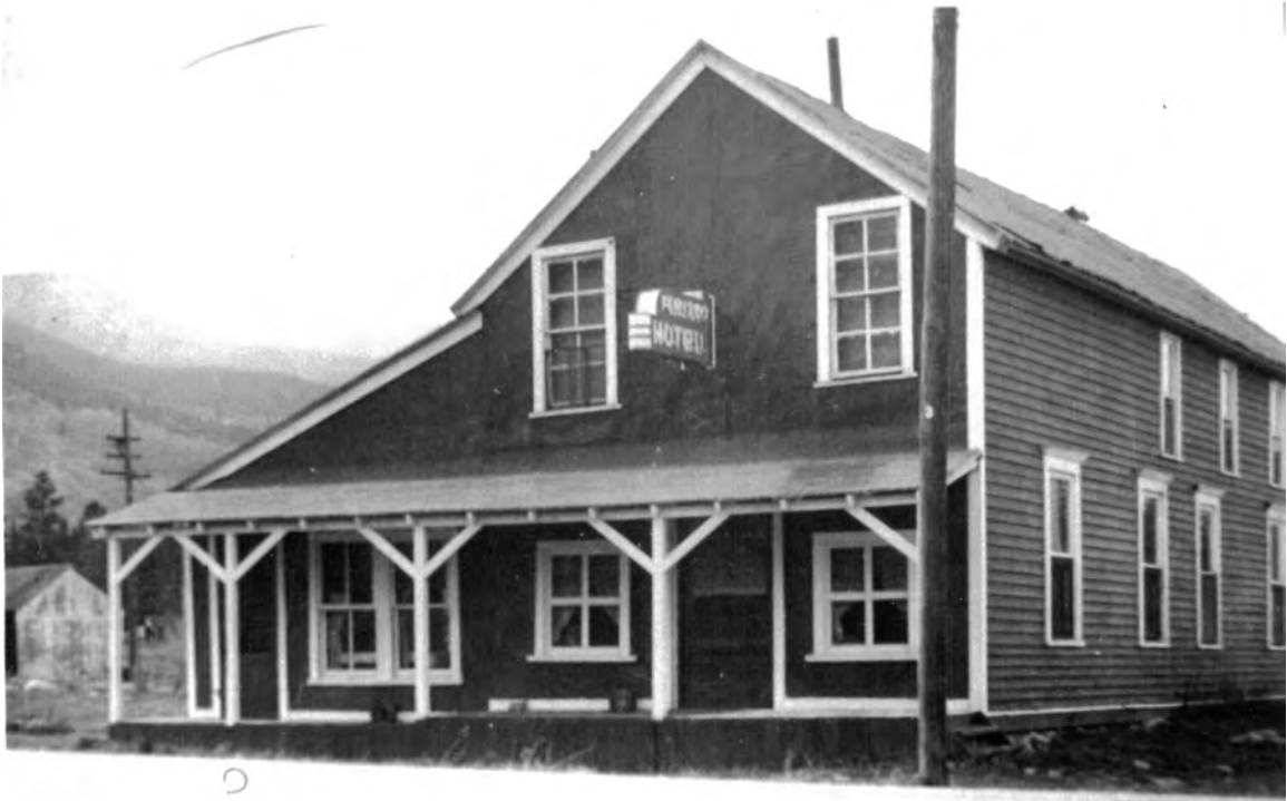
5ST.282 • Frisco Lodge, original facade Looking North Image: 321.MAI.14

Summit County, Colorado date unknown