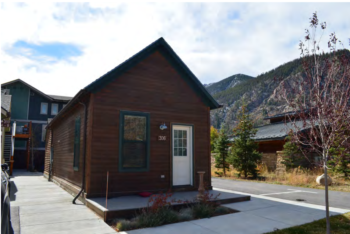
5ST.1753 • Mary Ruth House Looking Southwest Image: 306.GAL.2