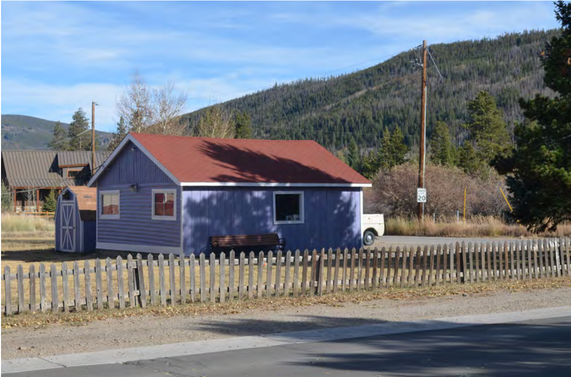
5ST.1749 • Outbuilding Looking Southwest Image: 414.8th.8