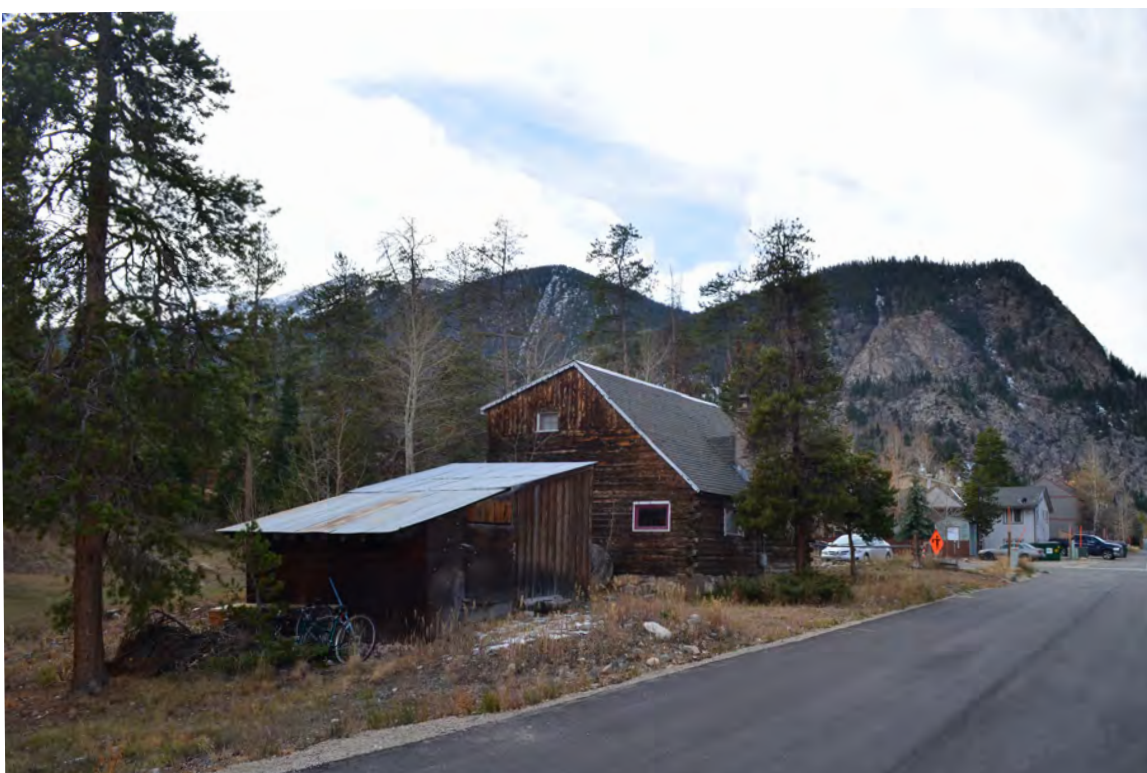
5ST.1748 Looking Southwest Image: 212.N6th.4