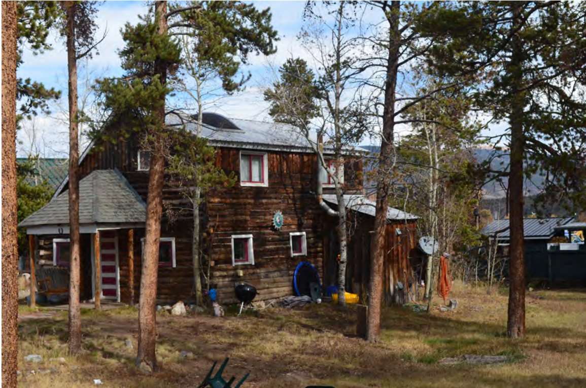
5ST.1748 Looking Northeast Image: 212.N6th.6