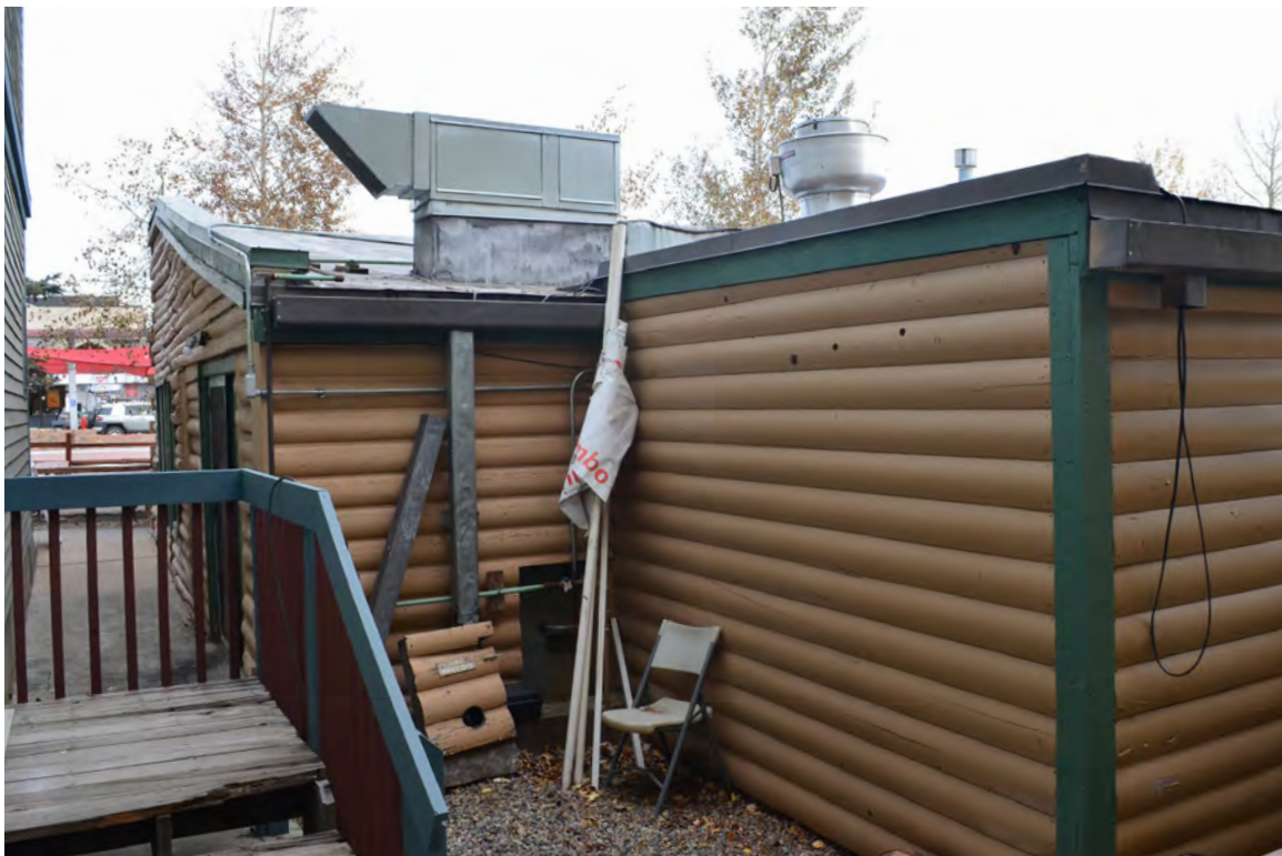
5ST.1760 • Lost Cajun Cafe Looking North Image: 204.MAI.6