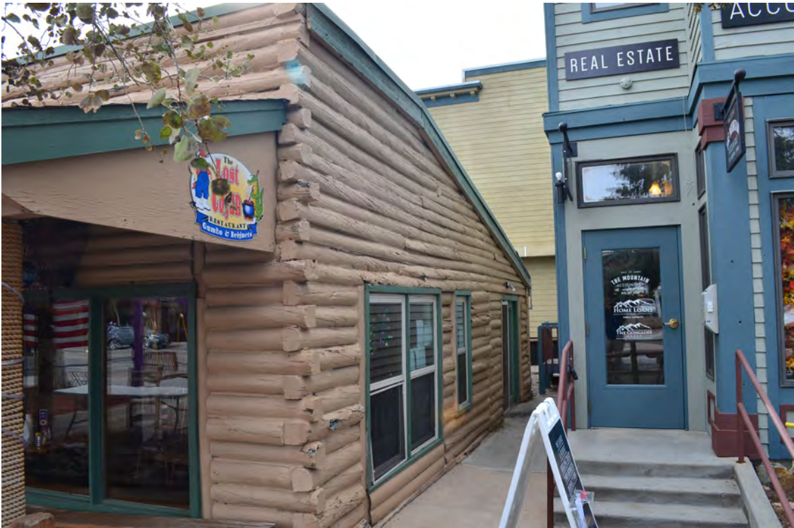
5ST.1760 • Lost Cajun Cafe Looking South Image: 204.MAI.3