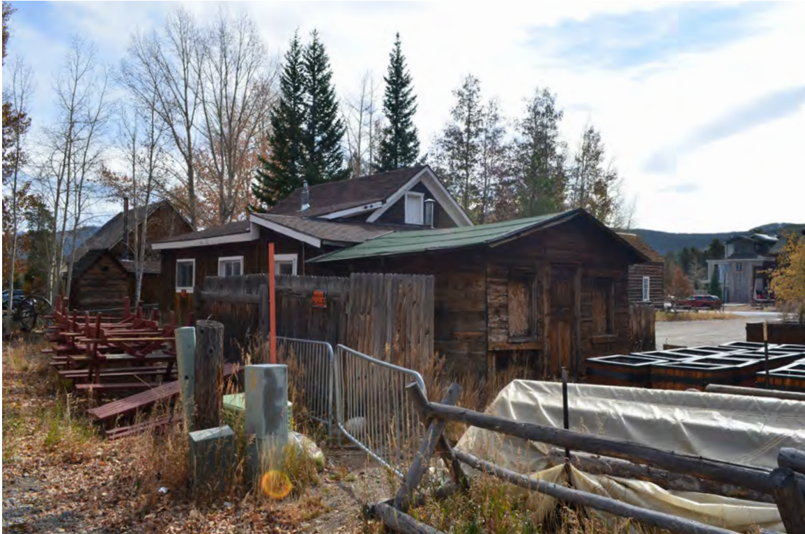
5ST.1758 Looking Southeast Image: 117.GRA.6