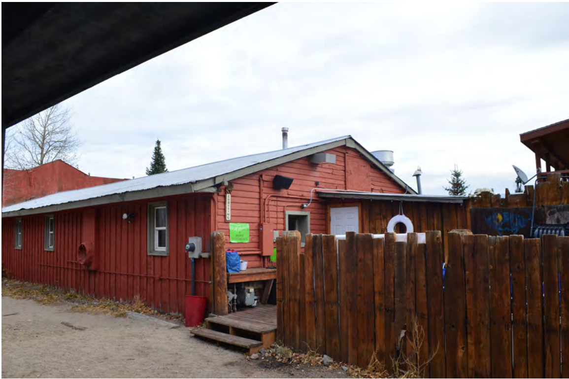
5ST.1761 • Moose Jaw Cafe Looking Northeast Image: 208.MAI.5