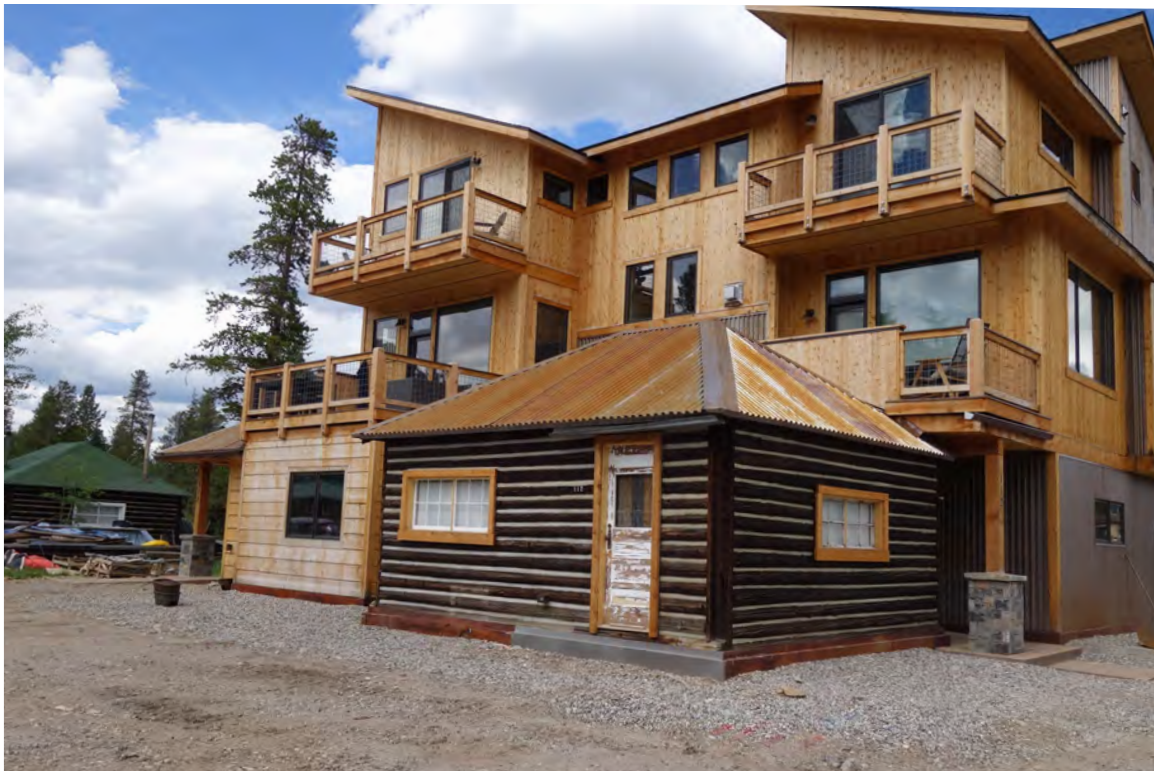
5ST.1745 • Deming Cabin Looking Northeast Image: 112.N5th.1