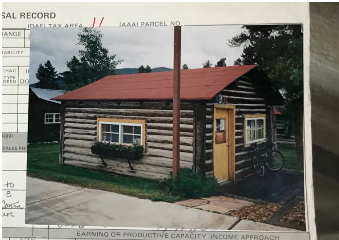
5ST.1763 • Cannam Cabins Cabin 1 Looking Southeast Image: 502a.MAI.9

Summit County, Colorado Date Unknown