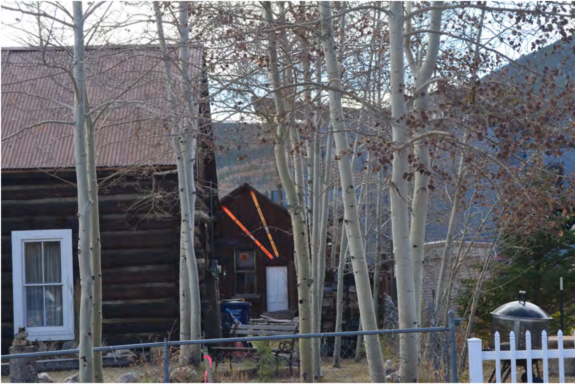
5ST.1752 • Kreamelmeyer House Looking South, Outbuilding 2 Image: 216.GAL.11