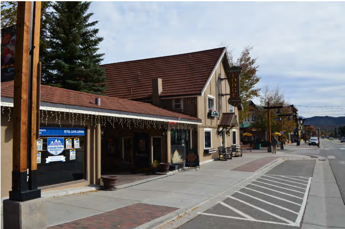
5ST.282 • Frisco Lodge Looking North Image: 321.MAI.2