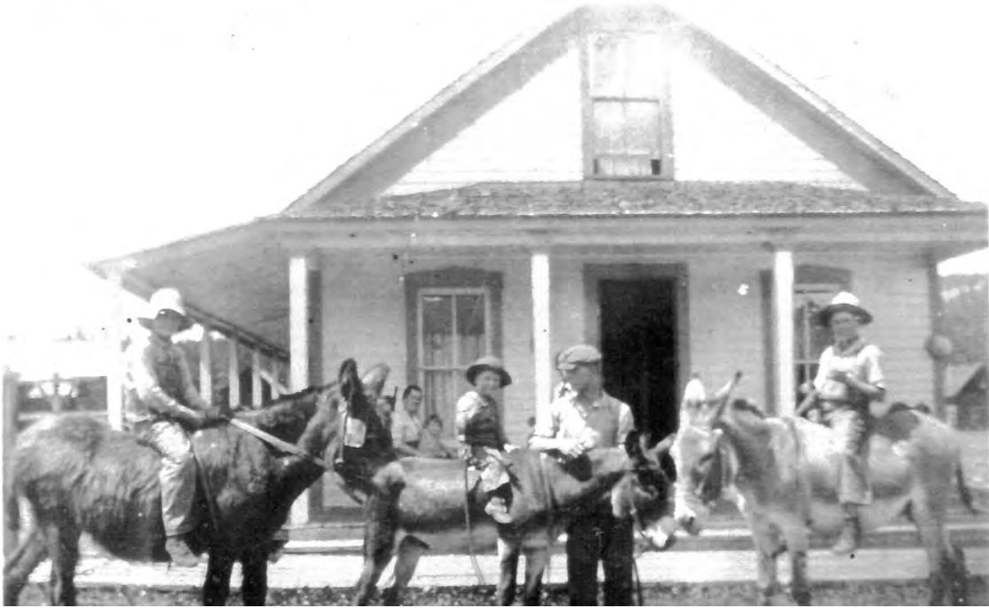
5ST.1757 • Wiley House Looking North Image: 113.GRA.3

Summit County, Colorado 1922