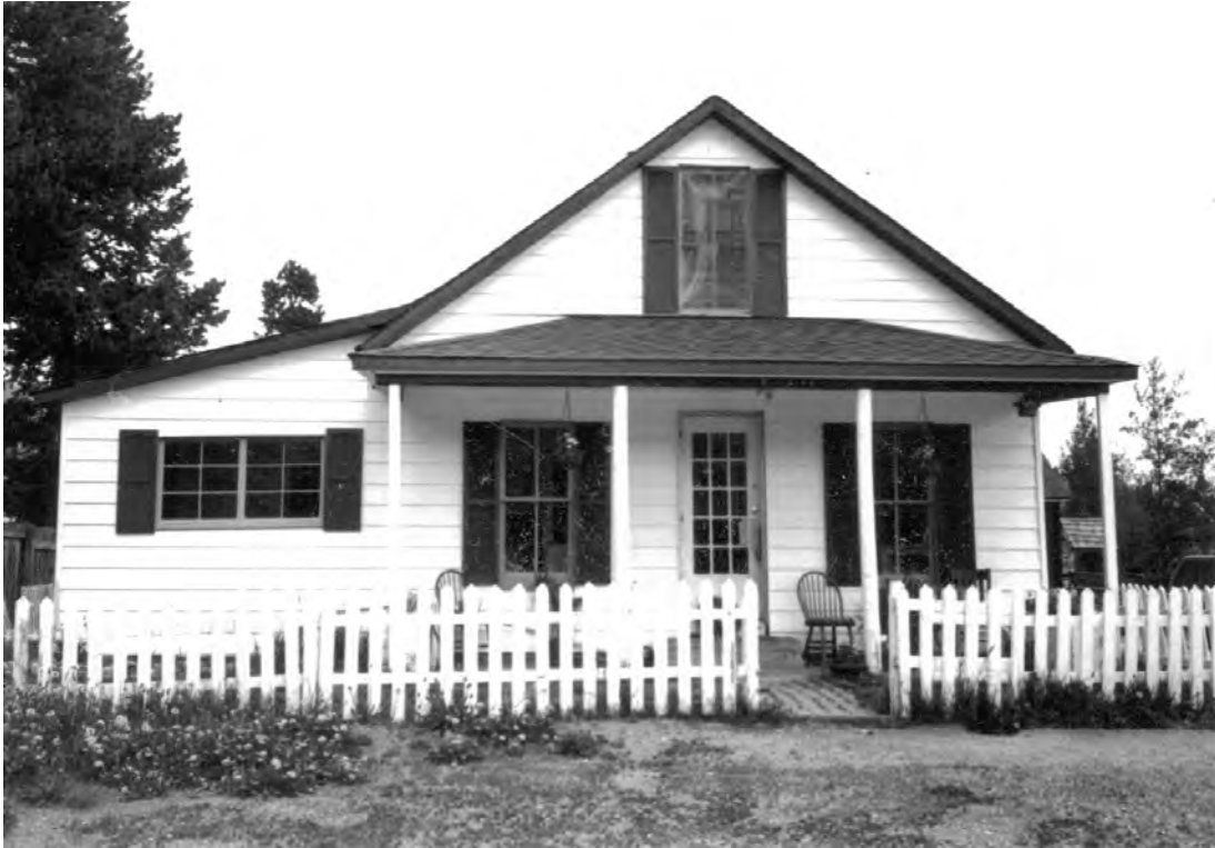
5ST.1757 • Wiley House Looking North Image: 113.GRA.2

Summit County, Colorado Date Unknown