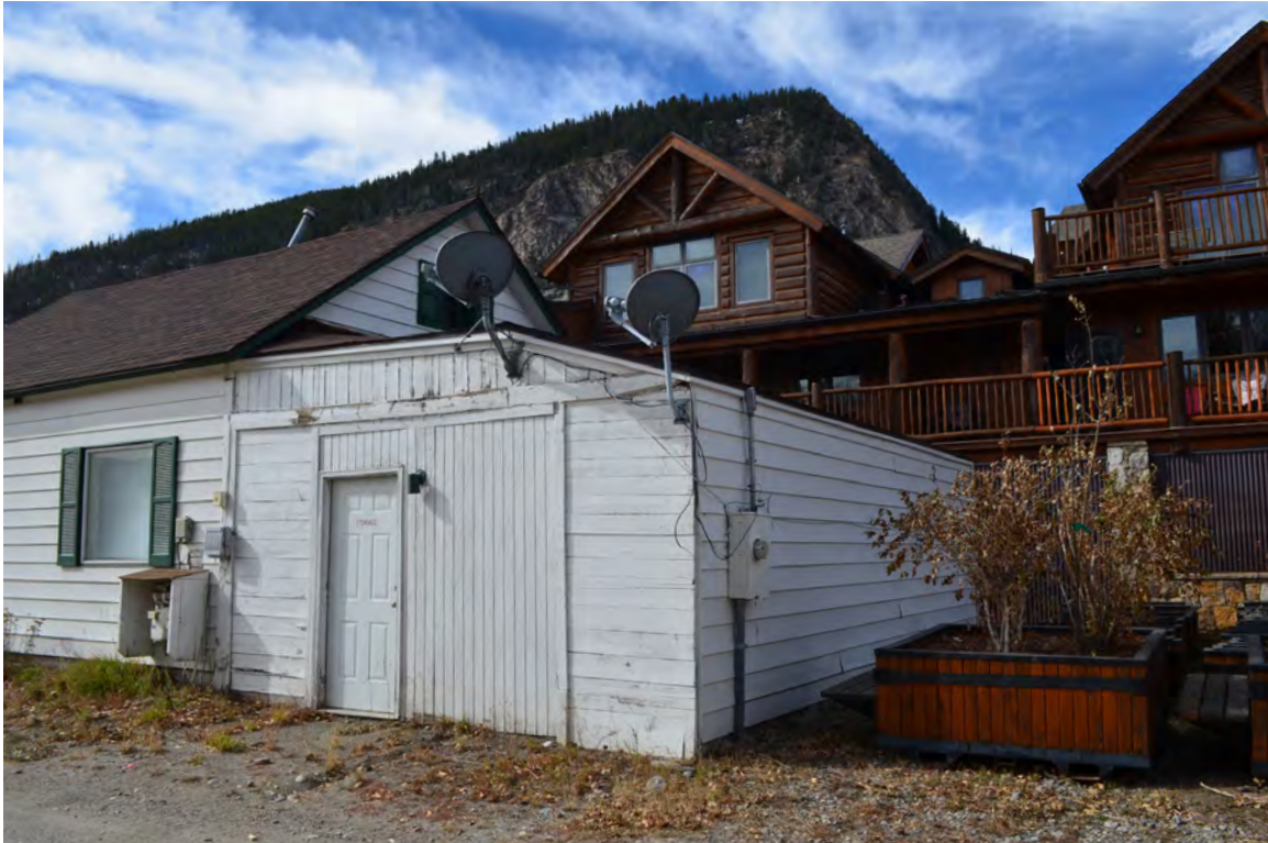
5ST.1757 • Wiley House Looking Southwest Image: 113.GRA.6