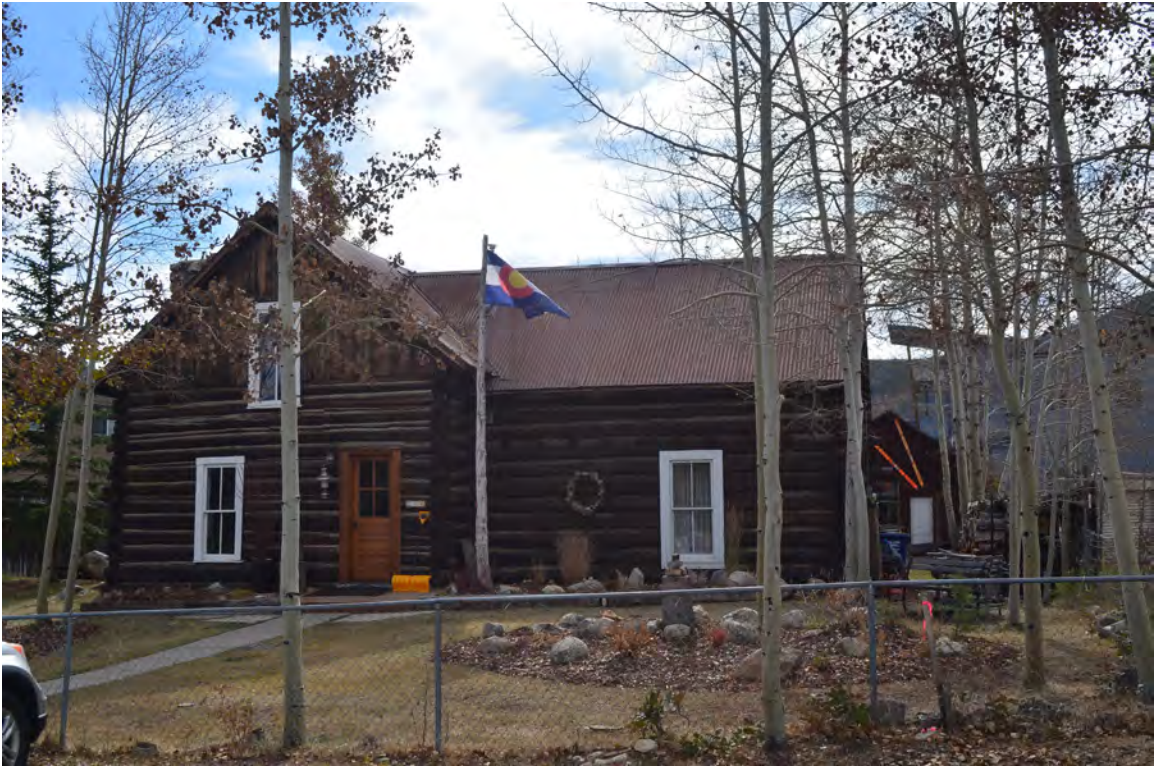
5ST.1752 • Kreamelmeyer House Looking South Image: 216.GAL.1