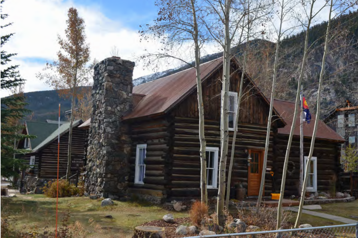
5ST.1752 • Kreamelmeyer House Looking Southwest Image: 216.GAL.4