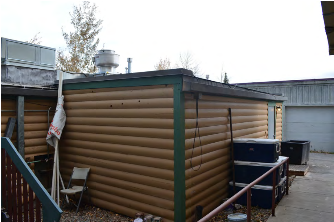
5ST.1760 • Lost Cajun Cafe Looking Northeast Image: 204.MAI.7