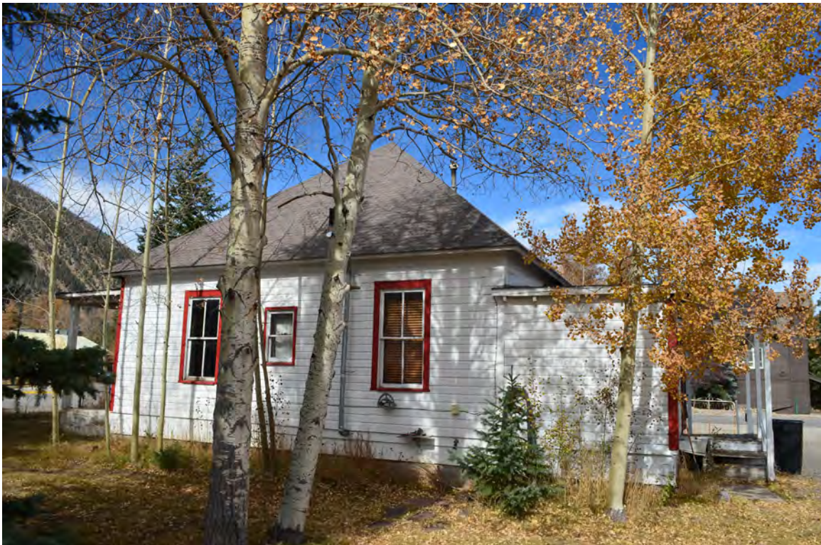
5ST.1744 • Susie Thompson House Looking Northwest Image: 120.N4th.9