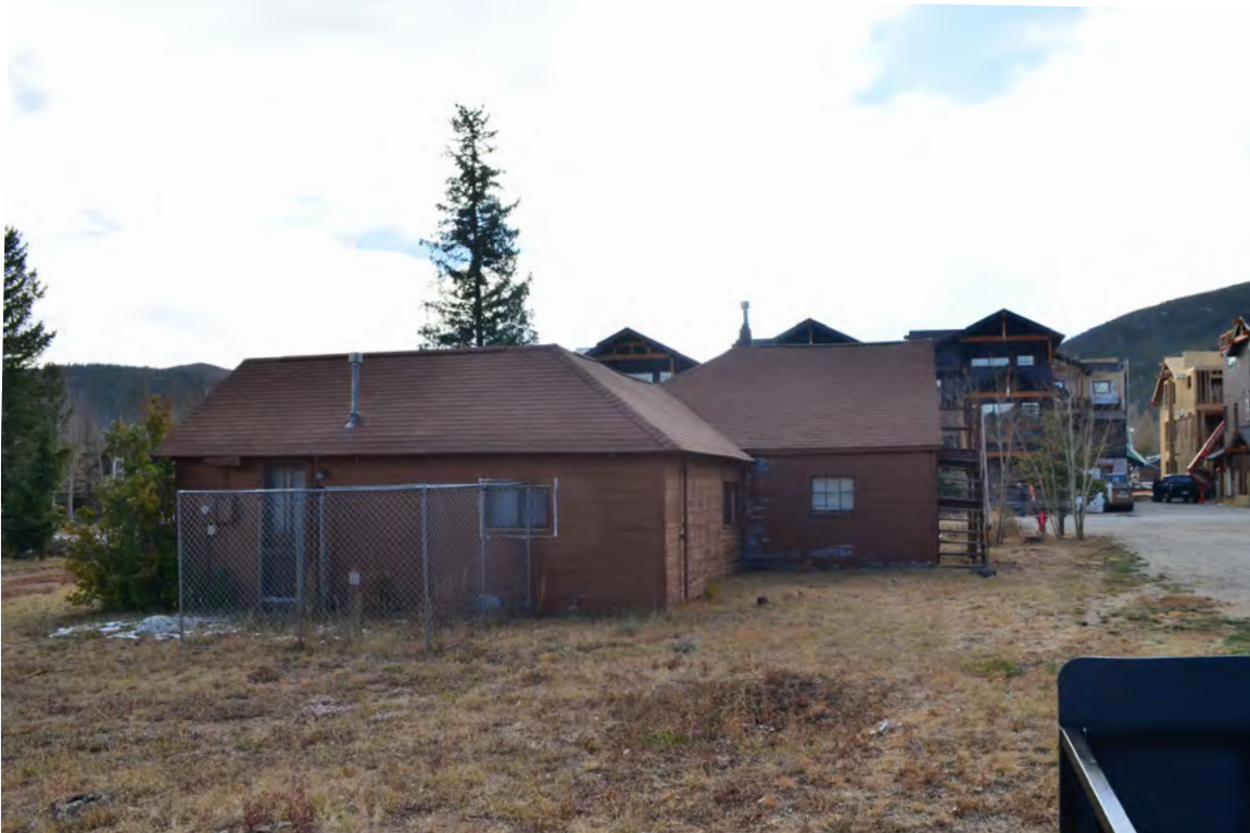
5ST.1750 Looking South Image: 201.GAL.5