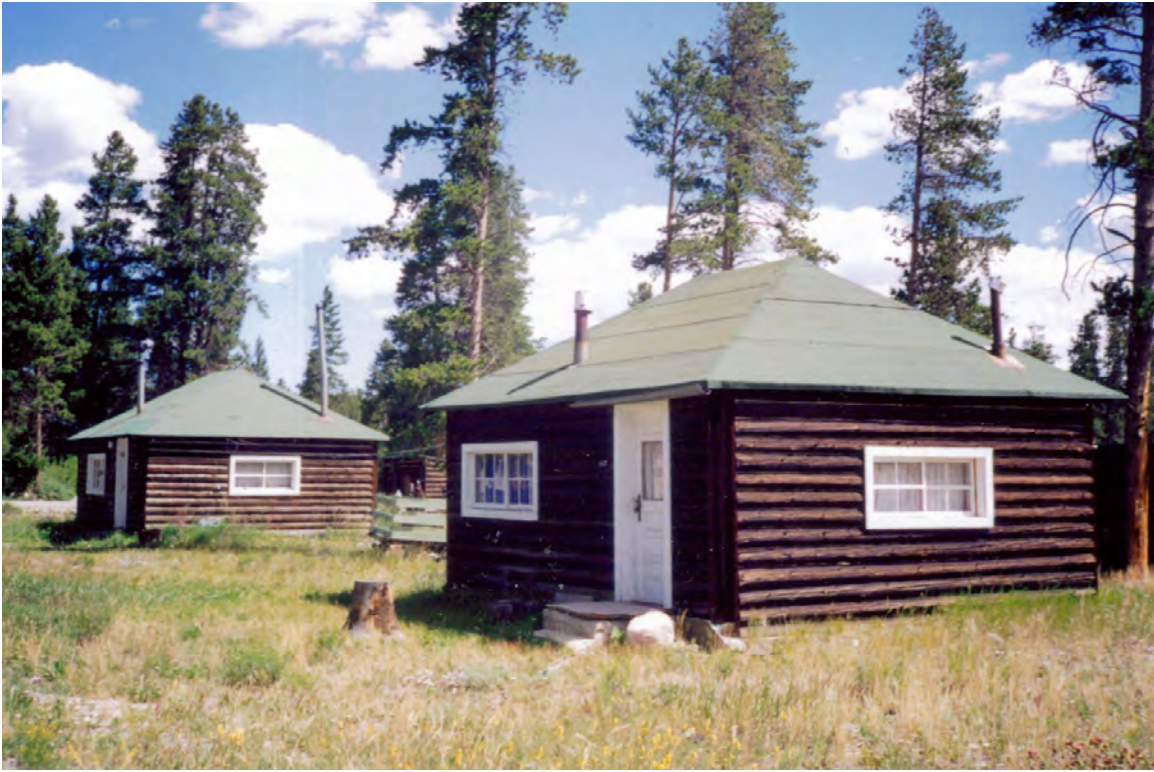
5ST.1745 • Deming Cabin Looking Northeast, 112, foreground and 116 back Image: 112.N5th.3

Summit County, Colorado Date Unknown