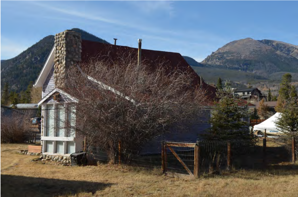
5ST.1749 Looking Northwest Image: 414.8th.4