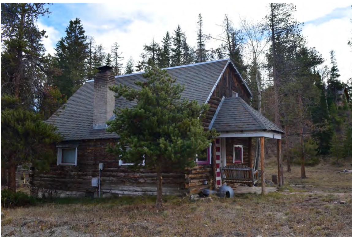
5ST.1748 Looking Southeast Image: 212.N6th.2