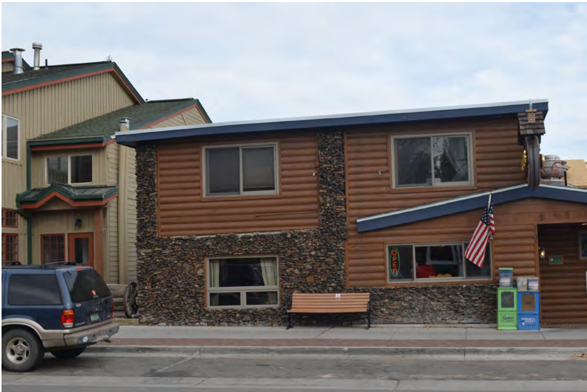
5ST.1759 • Log Cabin Cafe Looking North Image: 121.MAI.1