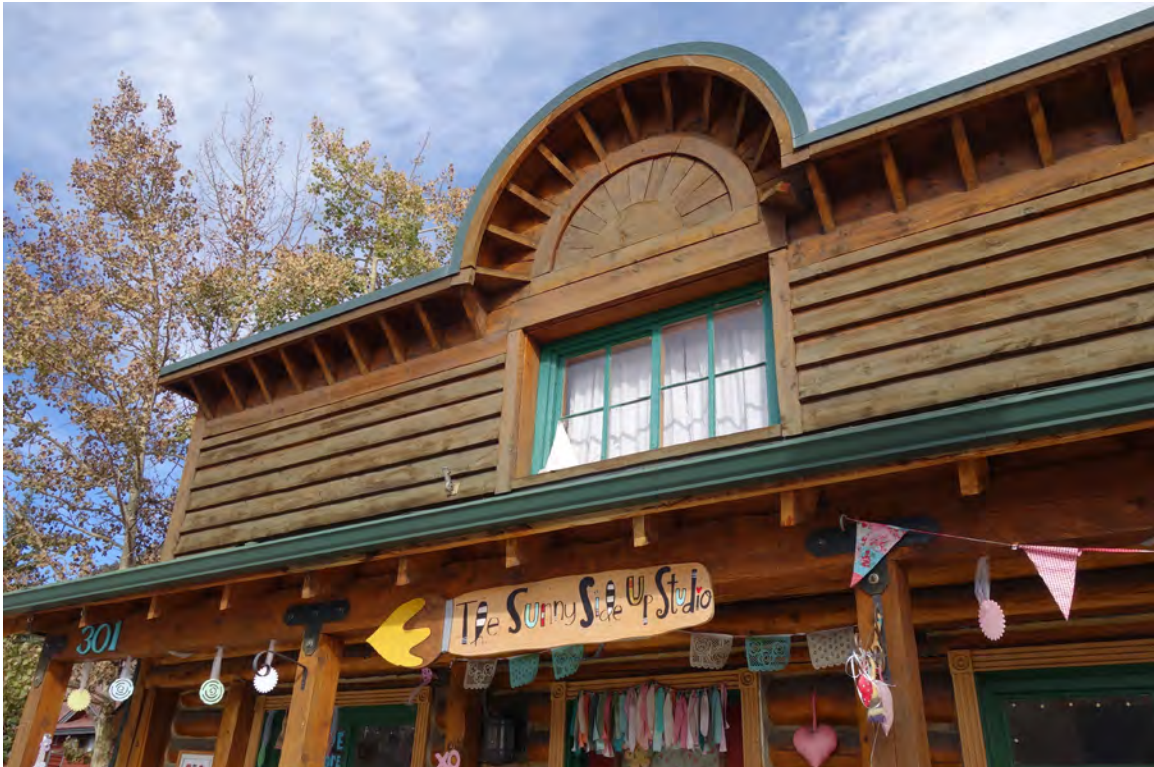
5ST.1762 Looking Northwest, detail Image: 301.MAI.7