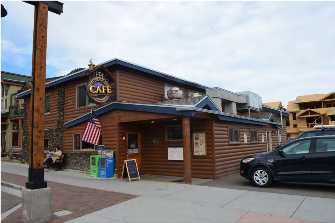
5ST.1759 • Log Cabin Cafe Looking Northwest Image: 121.MAI.3