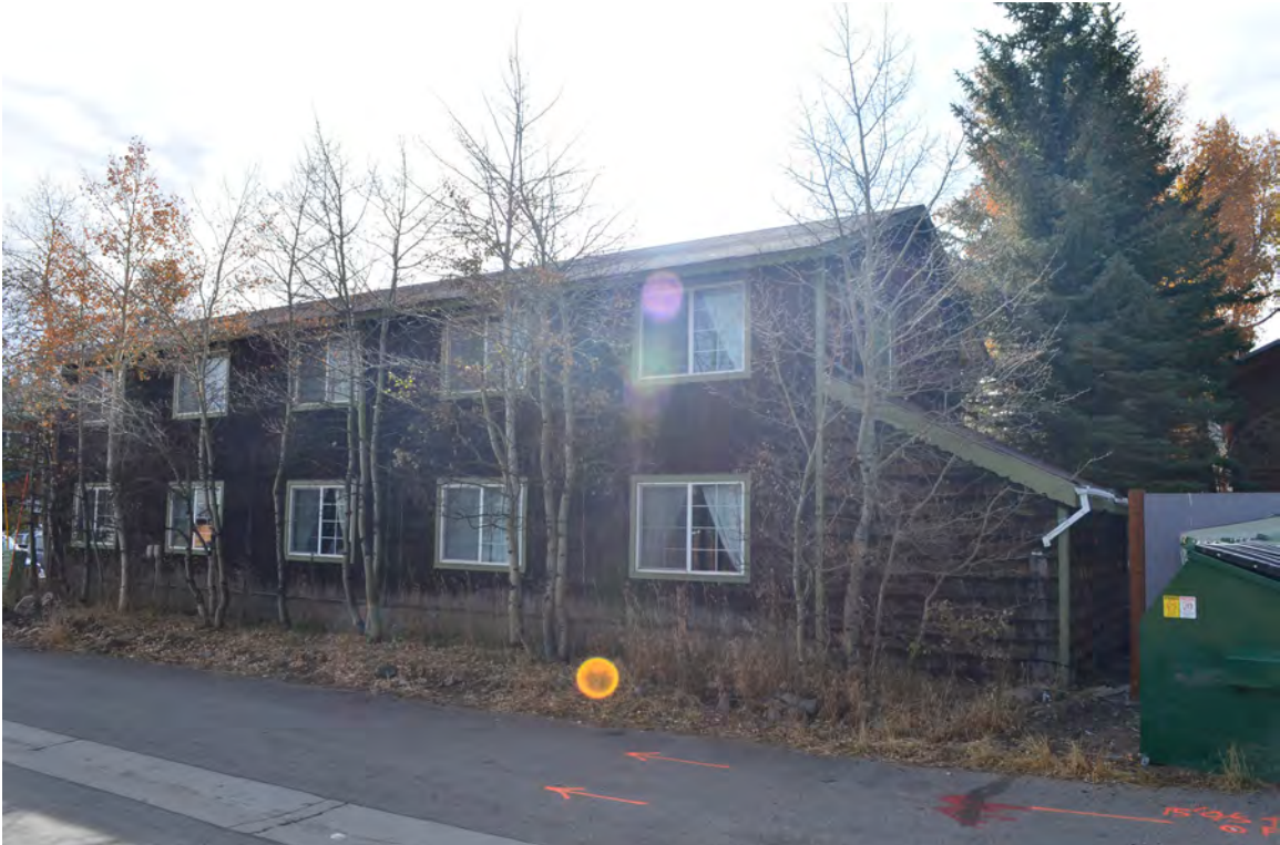
5ST.282 • Frisco Lodge, annex Looking Southeast Image: 321.MAI.12