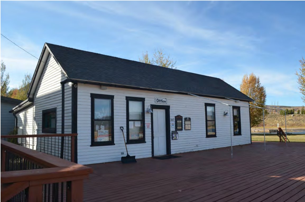
5ST.1765 • Lund House Looking West Image: 267.MAR.3