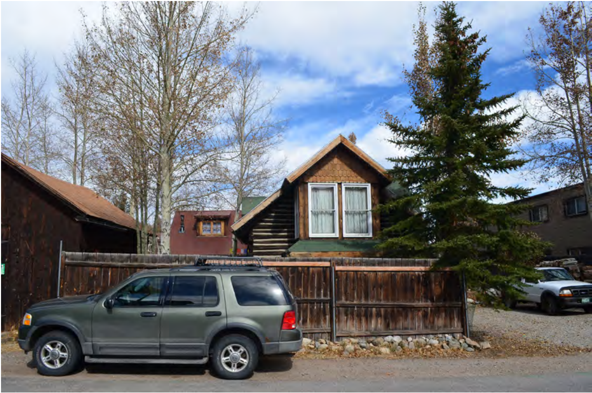
5ST.1752 • Kreamelmeyer House Looking North, Outbuilding 1 Image: 216.GAL.9