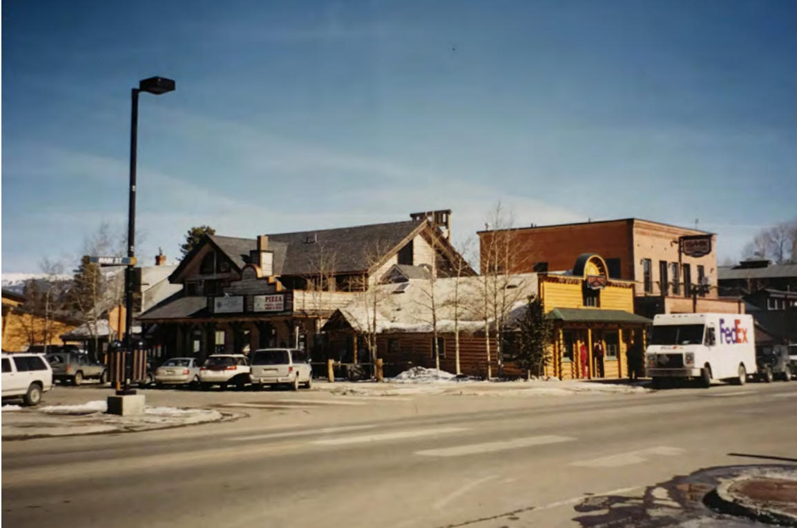
5ST.1762 Looking Northeast Image: 301.MAI.8

Summit County, Colorado date unknown, after 2001