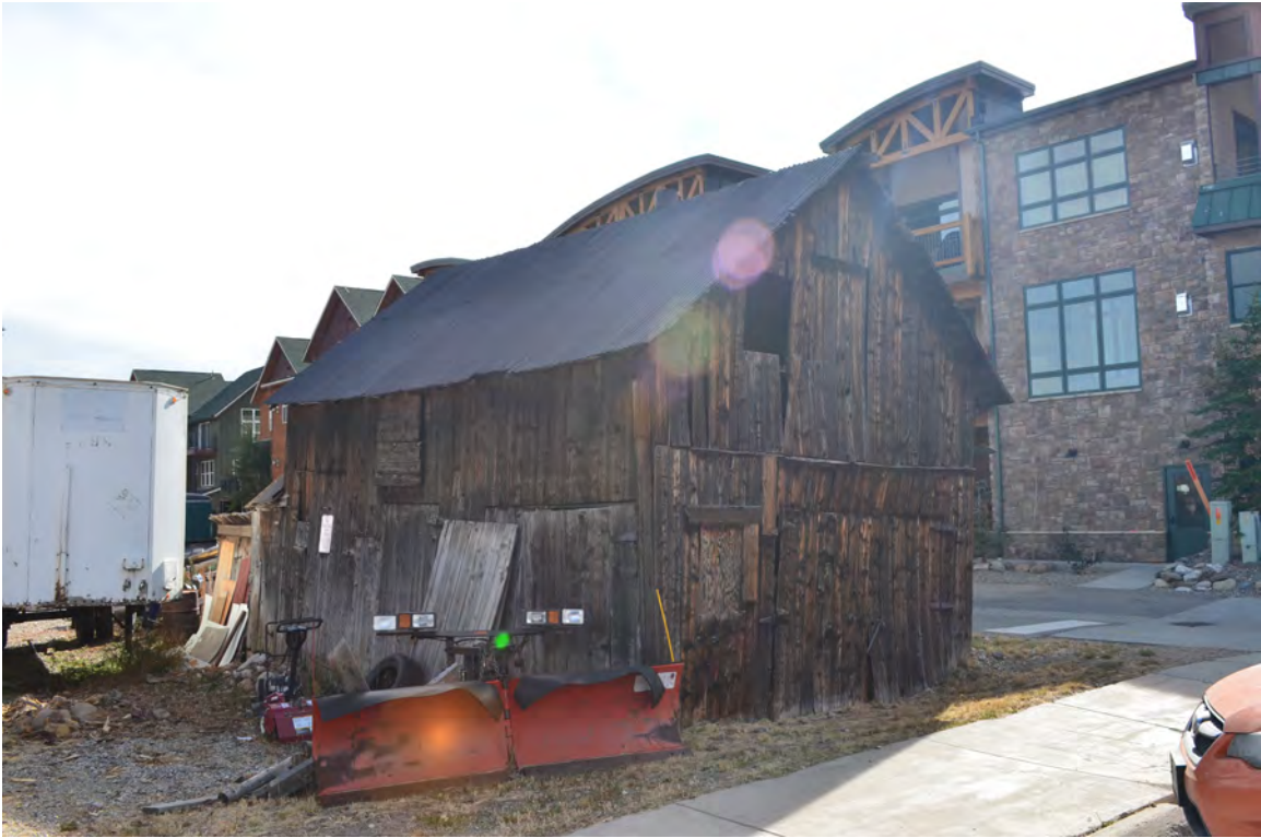
5ST.1764 • Blacksmith Shop Looking Southeast Image: 502b.MAI.3