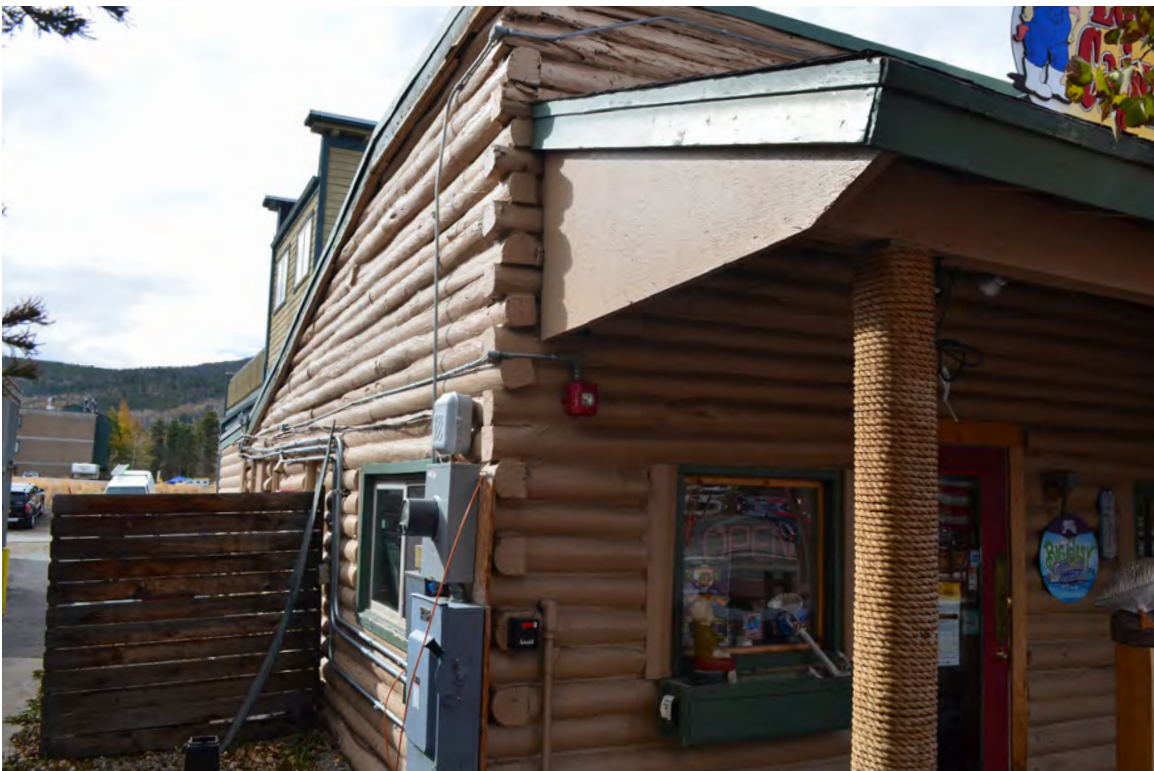
5ST.1760 • Lost Cajun Cafe Looking South Image: 204.MAI.4