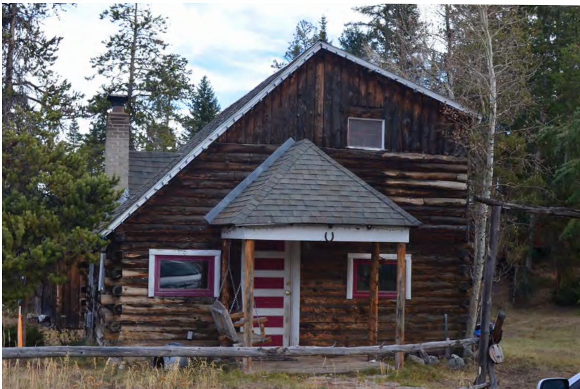
5ST.1748 Looking East Image: 212.N6th.1