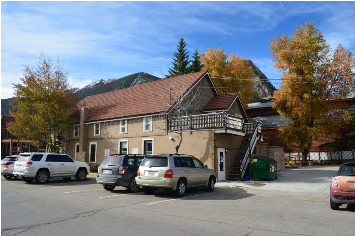
5ST.282 • Frisco Lodge Looking Southwest Image: 321.MAI.5