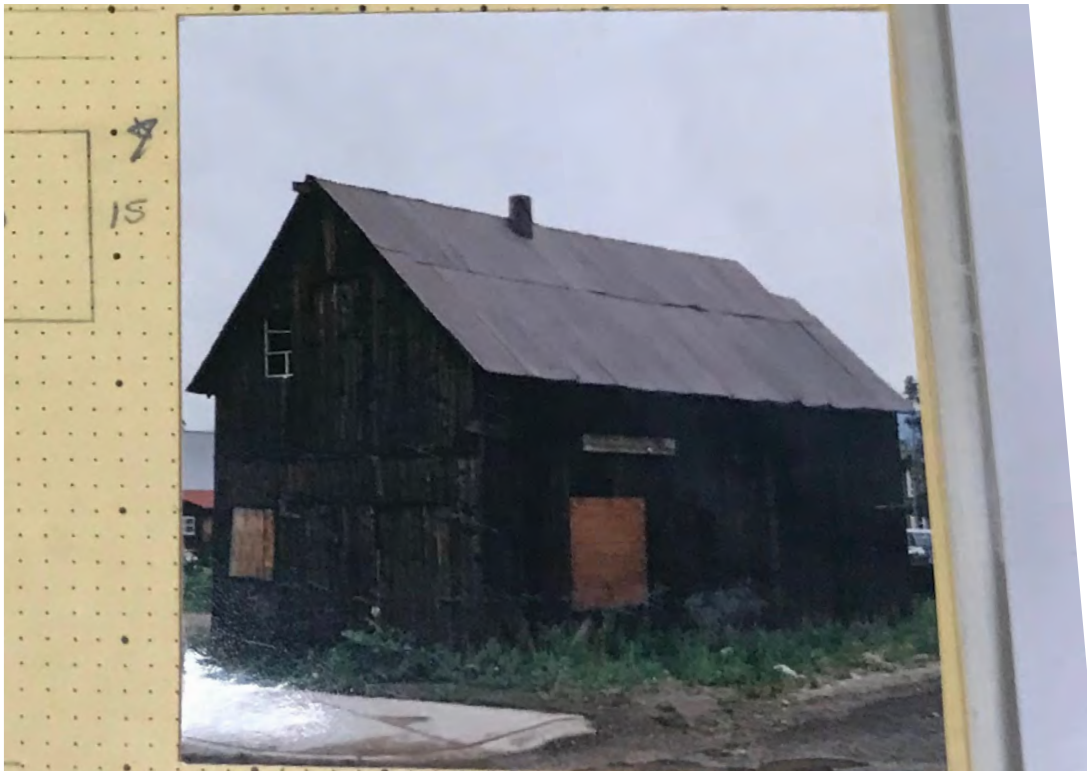
5ST.1764 • Blacksmith Shop Looking Northeast Image: 502b.MAI.5

Summit County, Colorado Date Unknown