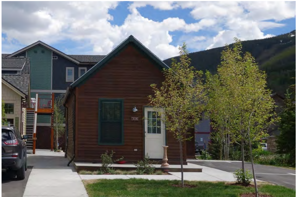
5ST.1753 • Mary Ruth House Looking South Image: 308.GAL.3