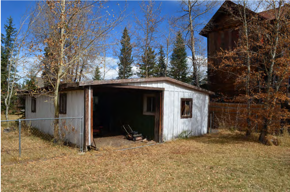
5ST.1744 • Susie Thompson House, outbuilding 1 Looking Northeast Image: 120.N4th.10