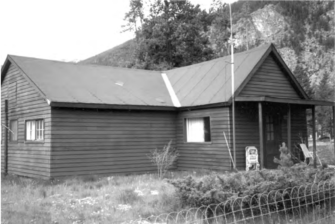
5ST.1751 • Mumford House Looking Southwest Image: 212.GAL.2

Summit County, Colorado Date Unknown