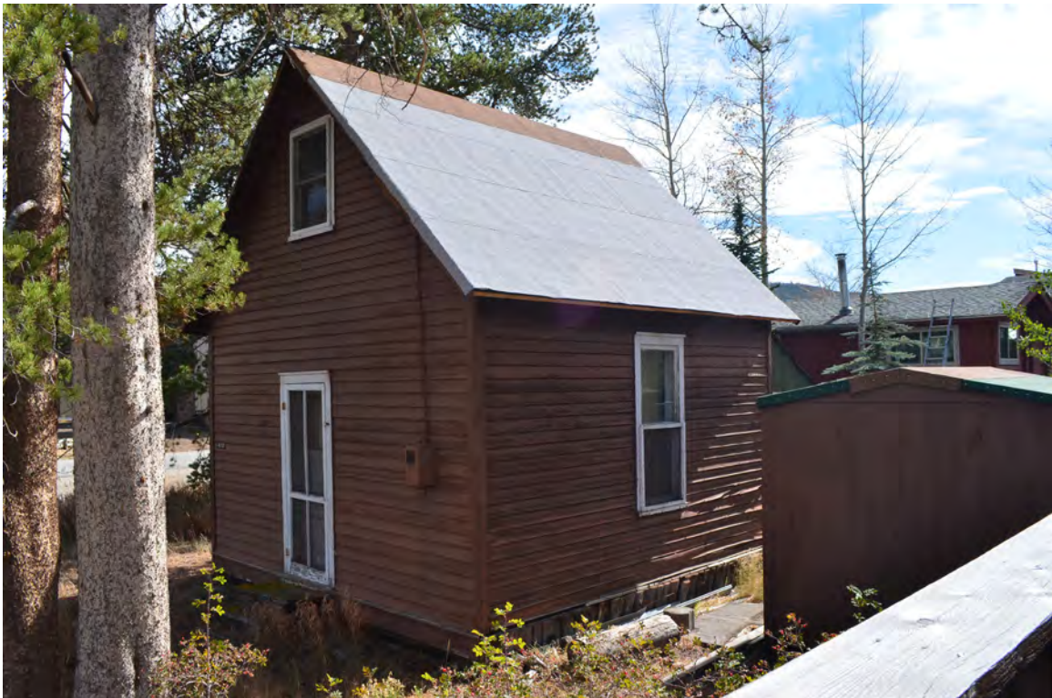
5ST.1756 • Yellow House or Pine Lodge Looking Southeast Image: 420.GAL.5