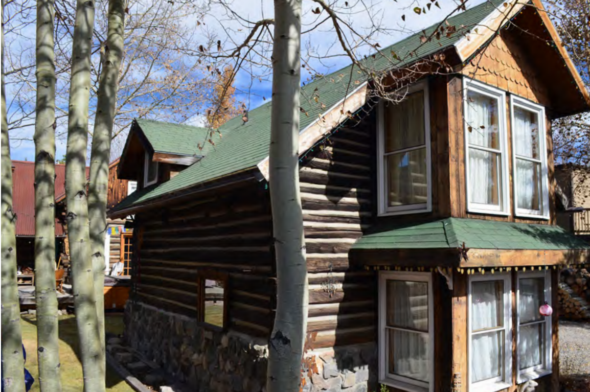
5ST.1752 • Kreamelmeyer House Looking Northeast, Outbuilding 1 Image: 216.GAL.8