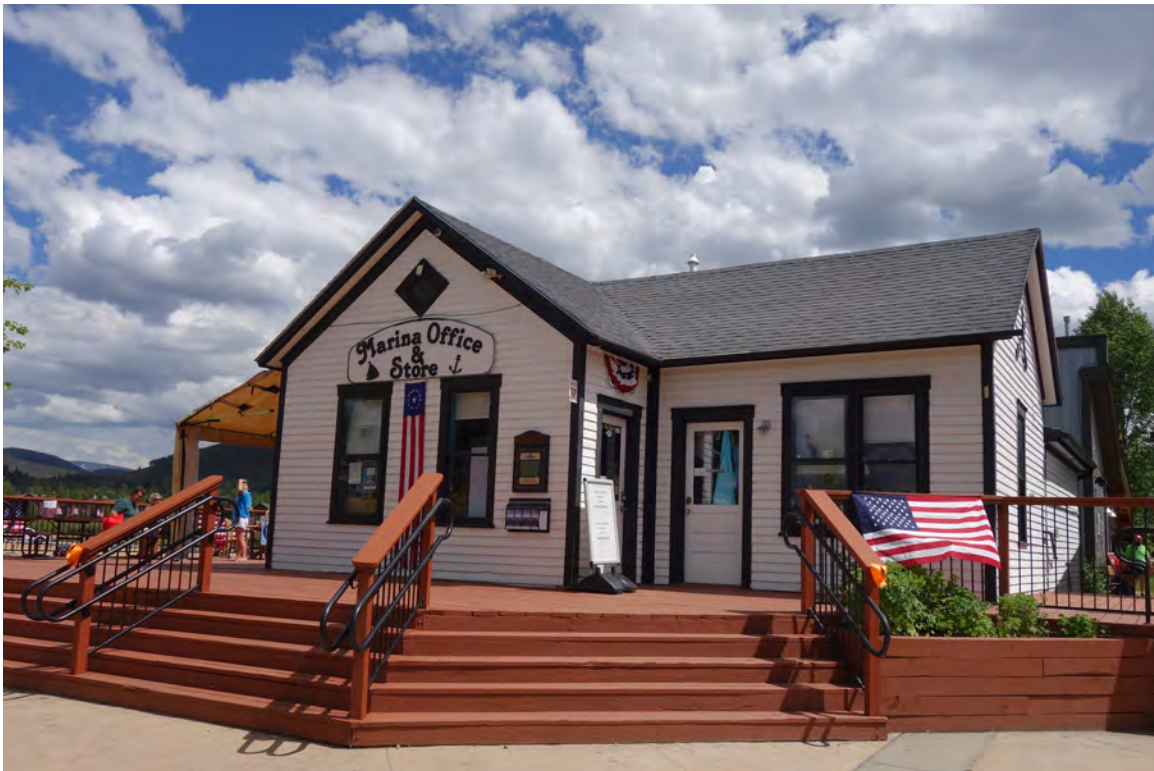
5ST.1765 • Lund House Looking South Image: 267.MAR.1