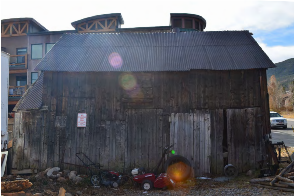
5ST.1764 • Blacksmith Shop Looking South Image: 502b.MAI.2