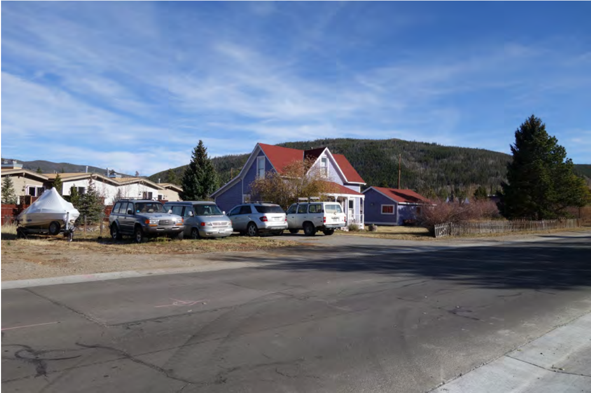
5ST.1749 Looking Southeast Image: 414.8th.6