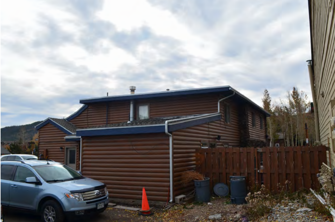
5ST.1759 • Log Cabin Cafe Looking Southeast Image: 121.MAI.4