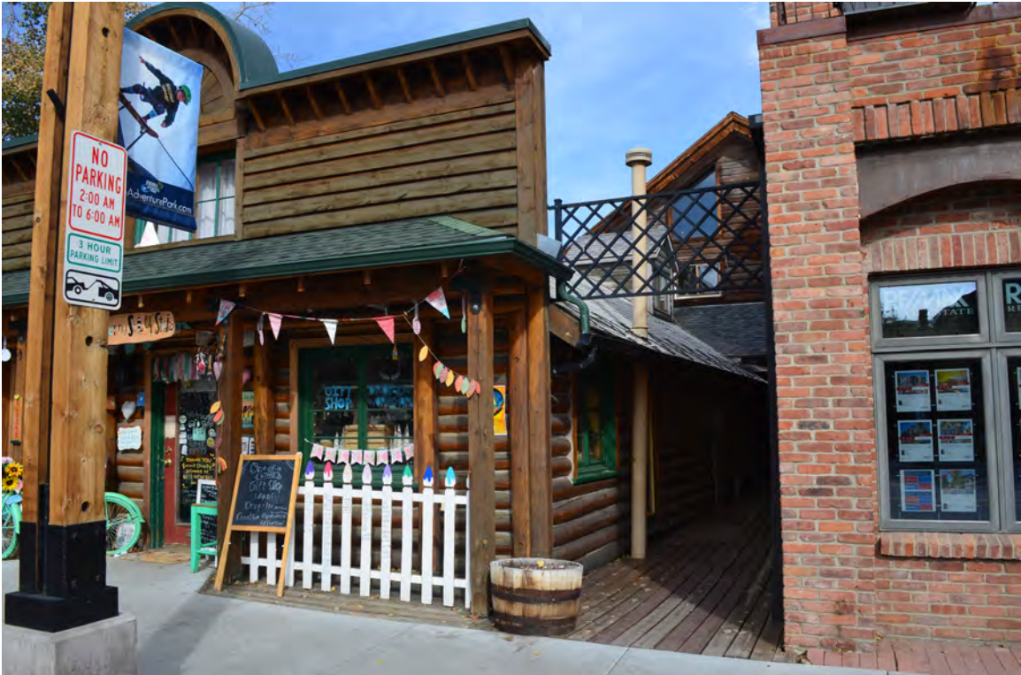
5ST.1762 Looking Northwest Image: 301.MAI.4