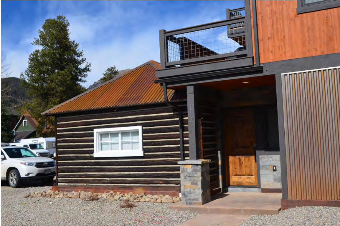
5ST.1745 • Deming Cabin Looking Northwest Image: 112.N5th.6