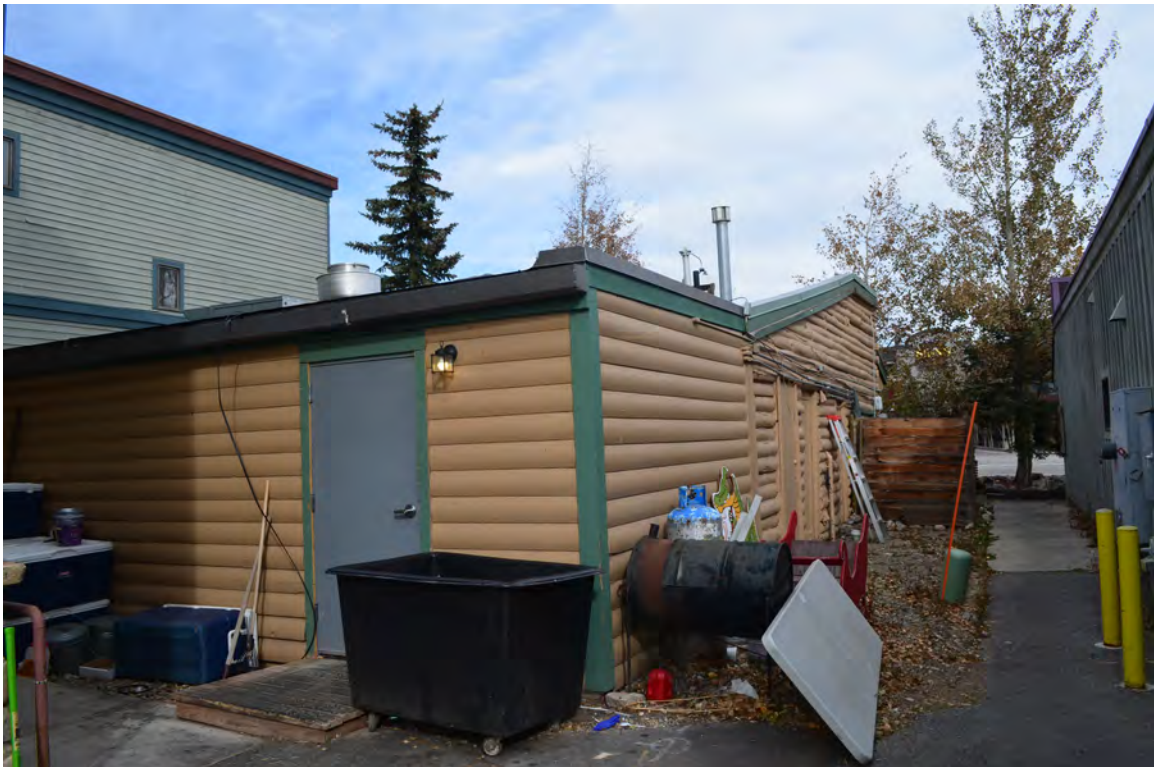
5ST.1760 • Lost Cajun Cafe Looking North Image: 204.MAI.5