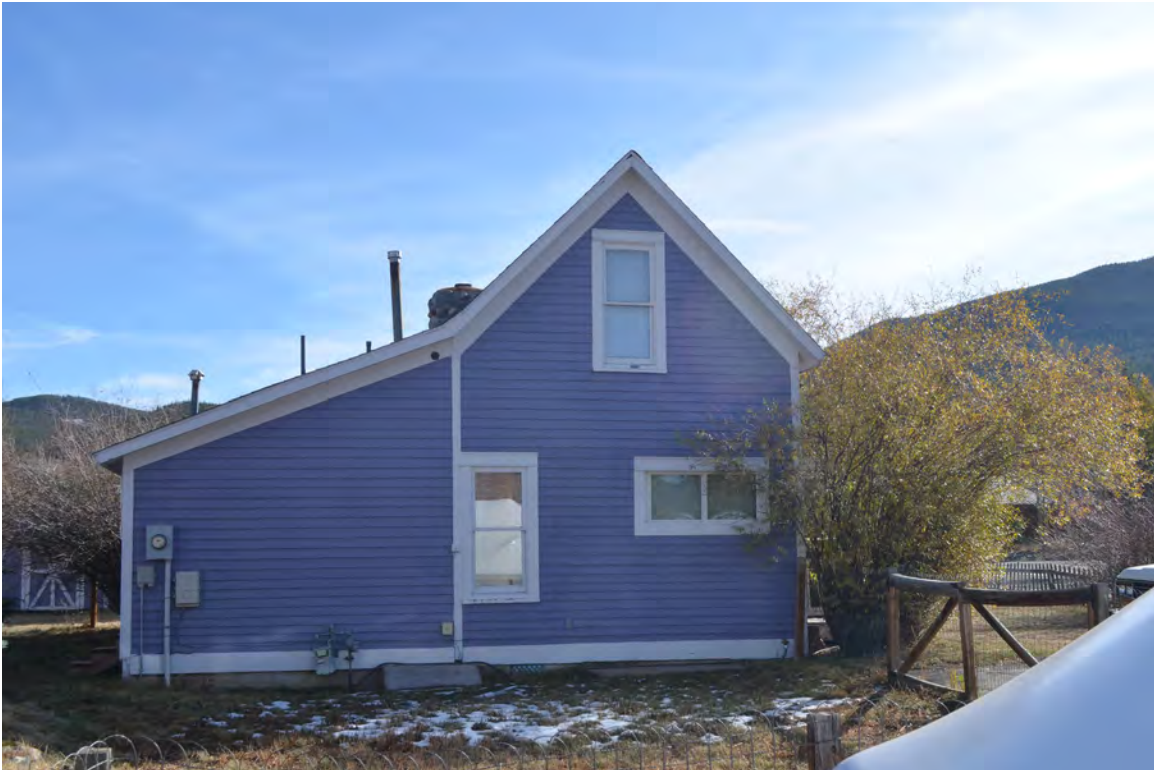
5ST.1749 Looking South Image: 414.8th.3