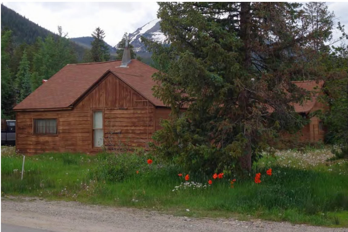
5ST.1750 Looking Northwest Image: 201.GAL.1