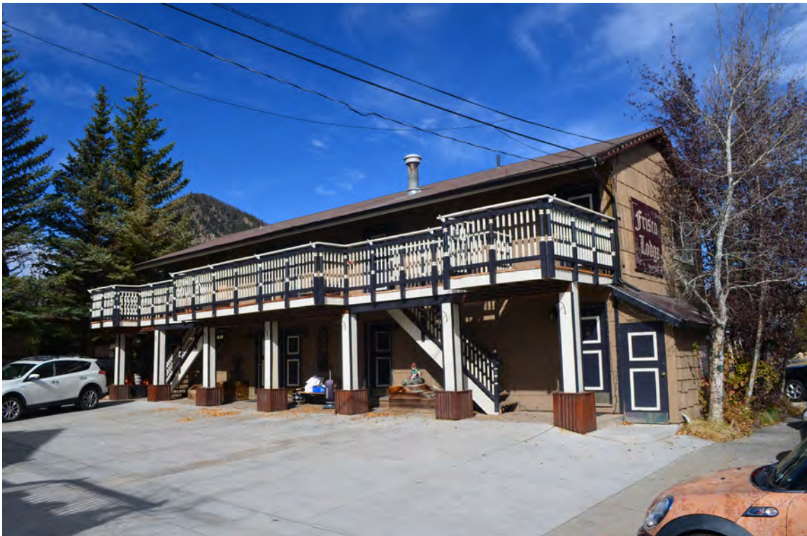
5ST.282 • Frisco Lodge, annex Looking Northwest Image: 321.MAI.9

Summit County, Colorado date unknown