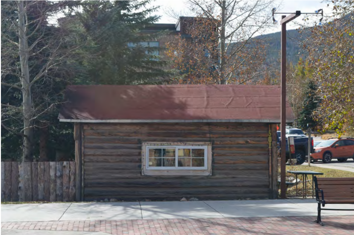
5ST.1763 • Cannam Cabins Cabin 1 Looking South Image: 502a.MAI.2