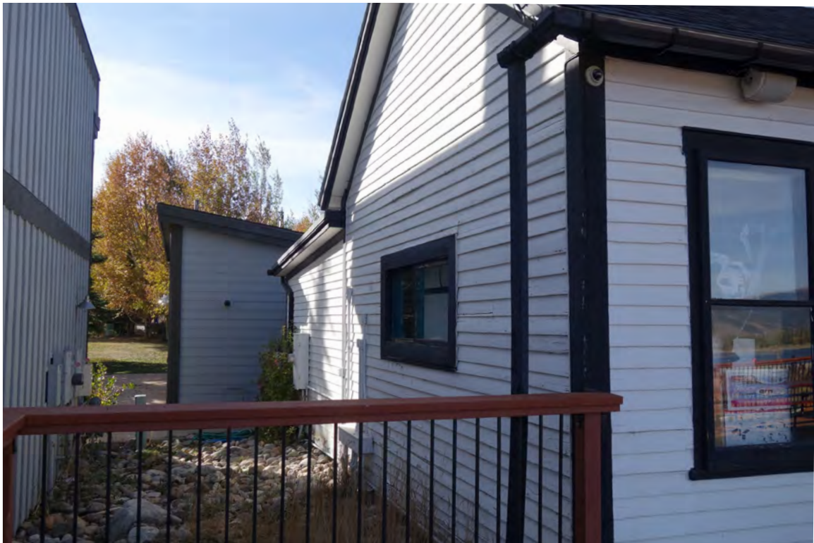
5ST.1765 • Lund House Looking West Image: 267.MAR.9