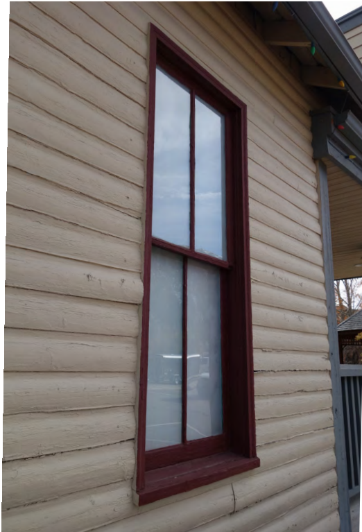
5ST.1073 • Historic Frisco Town Hall Looking Southeast, detail at window Image: 300.MAI.6