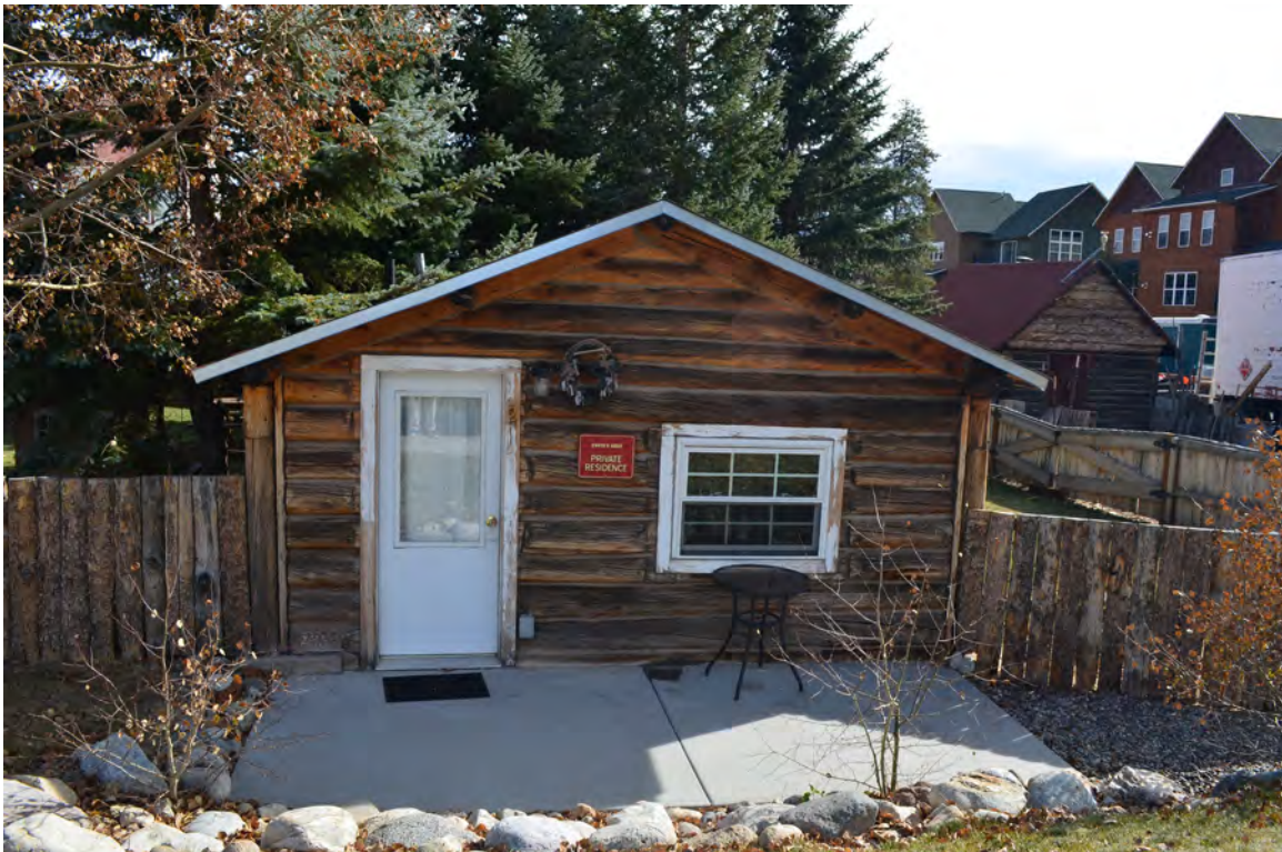
5ST.1763 • Cannam Cabins Cabin 2 Looking East Image: 502a.MAI.5