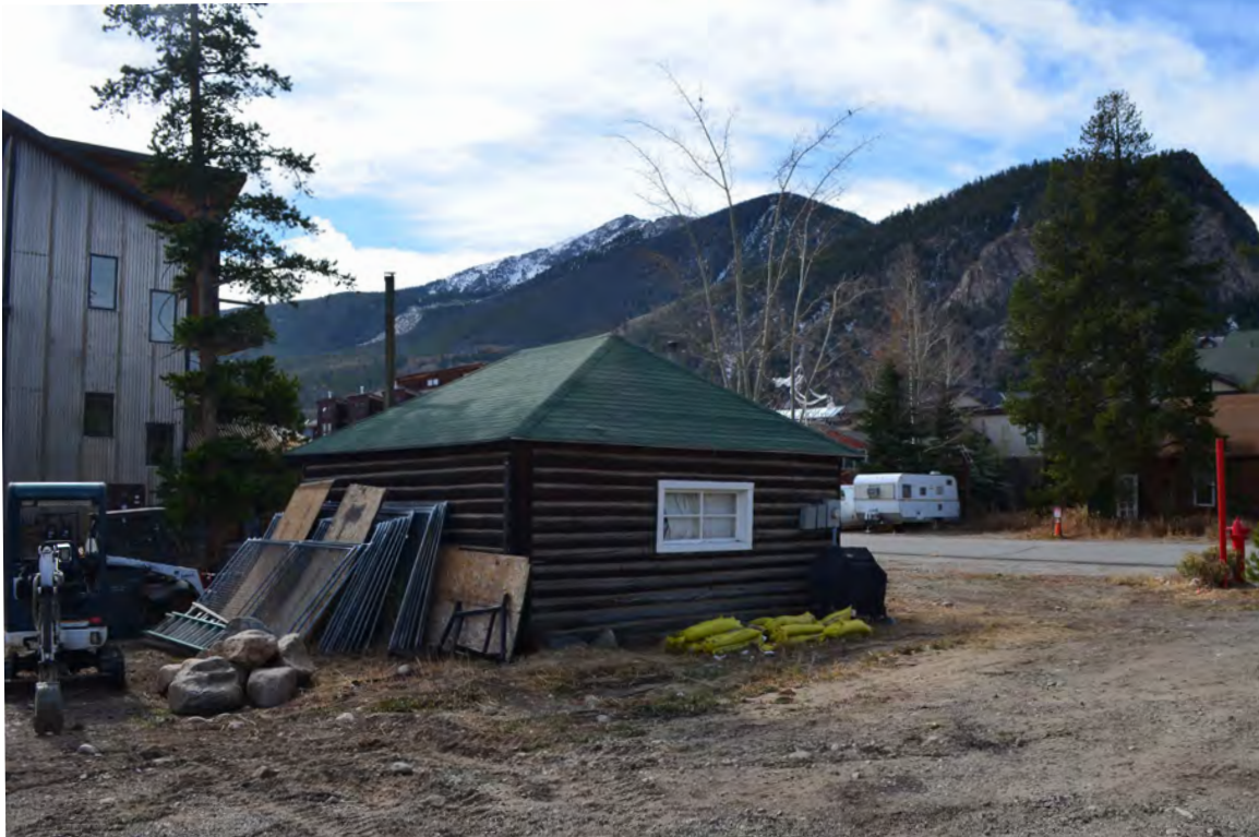
5ST.1746 • Deming Cabin Looking Southwest Image: 116.N5th.4