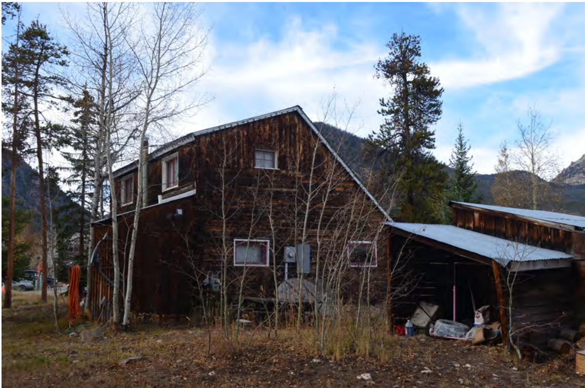
5ST.1748 Looking Northwest Image: 212.N6th.5