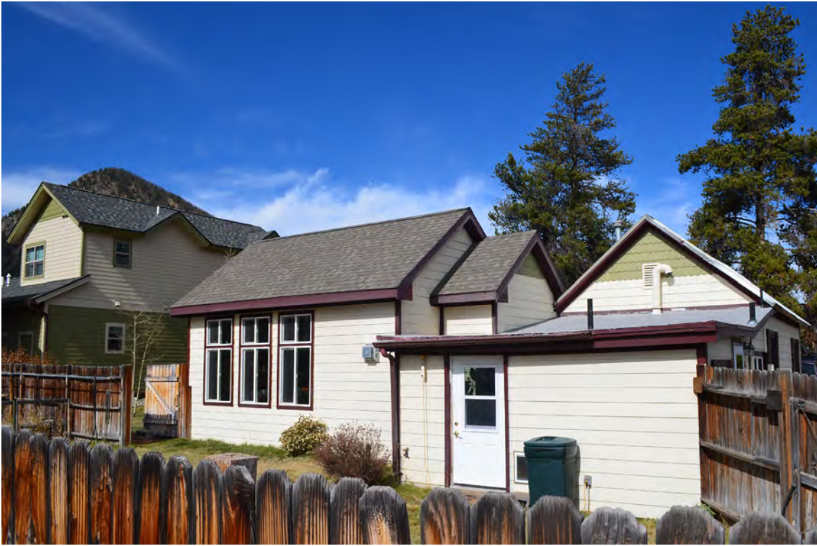
5ST.1755 • Morris House Looking Northwest Image: 318.GAL.7