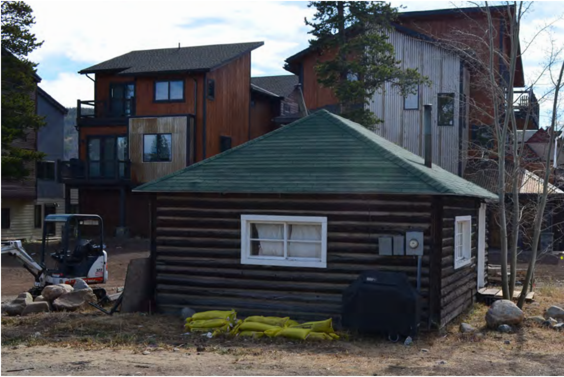
5ST.1746 • Deming Cabin Looking Southeast Image: 116.N5th.3