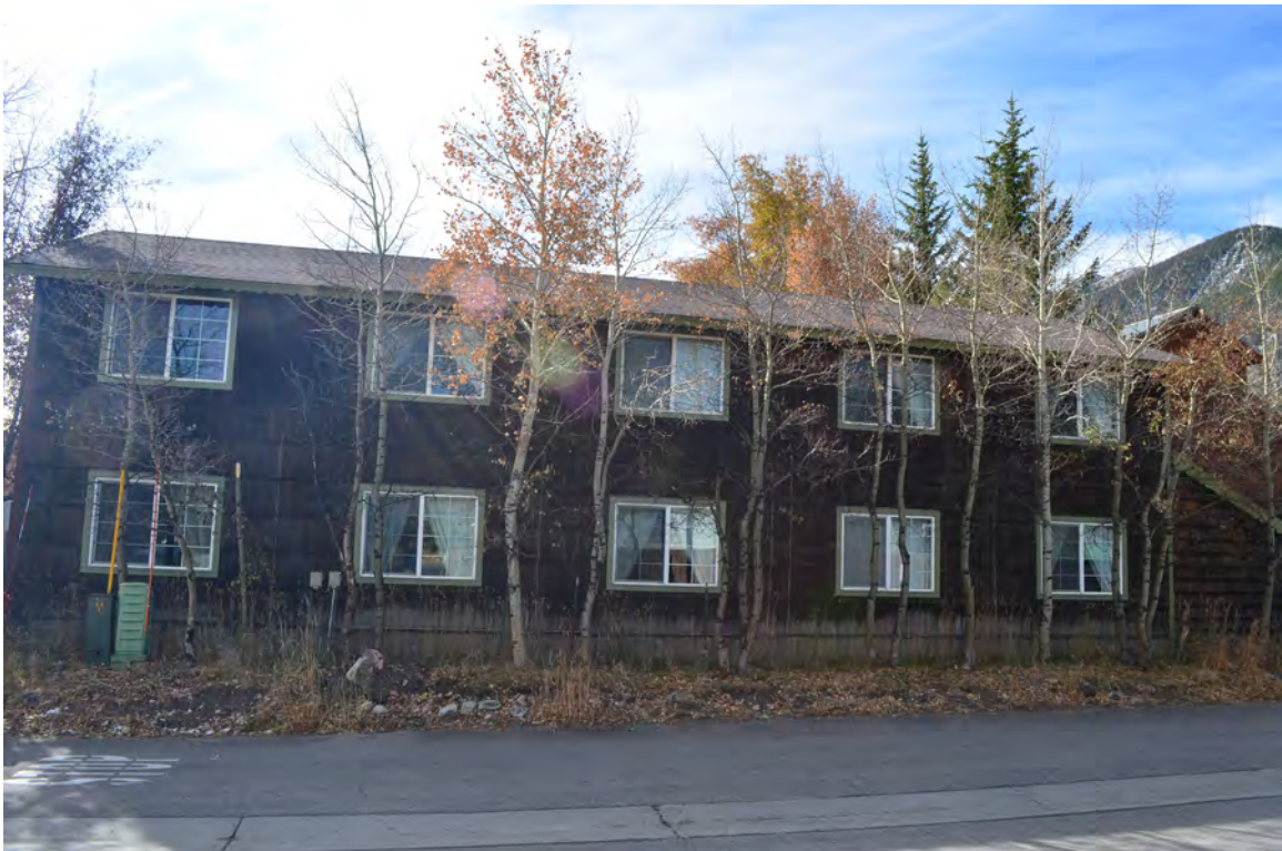
5ST.282 • Frisco Lodge, annex Looking South Image: 321.MAI.11