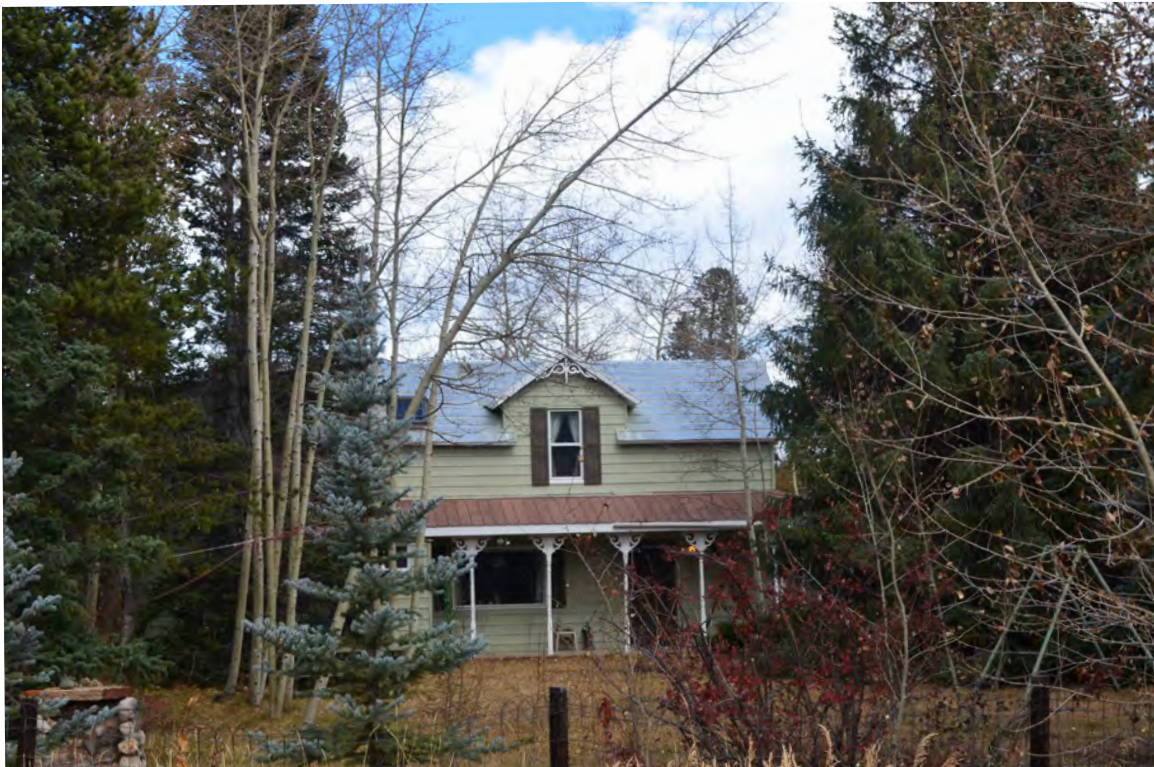
5ST.1743 • Linquist House Looking North Image: 205.N3rd.4