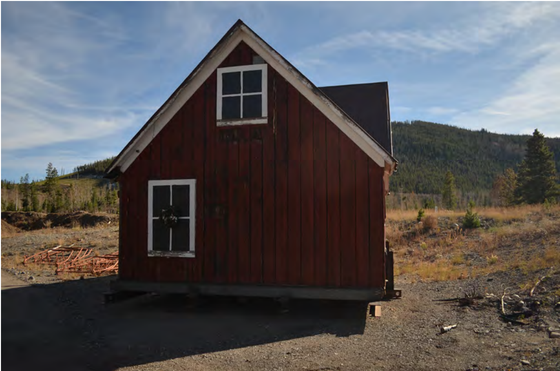
5ST.1766 • Excelsior Mine Office Looking West Image: EXCL.4