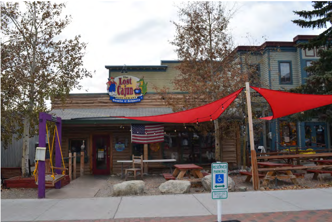
5ST.1760 • Lost Cajun Cafe Looking South Image: 204.MAI.1