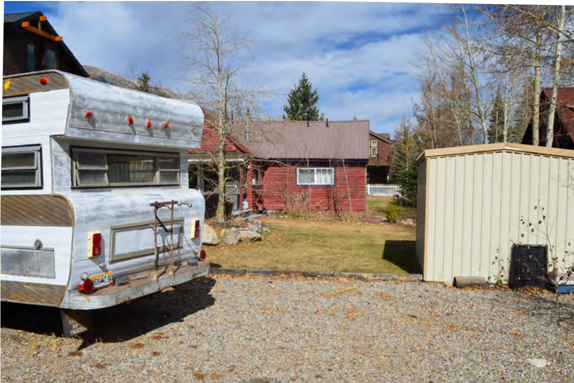
5ST.1751 • Mumford House Looking North Image: 212.GAL.5