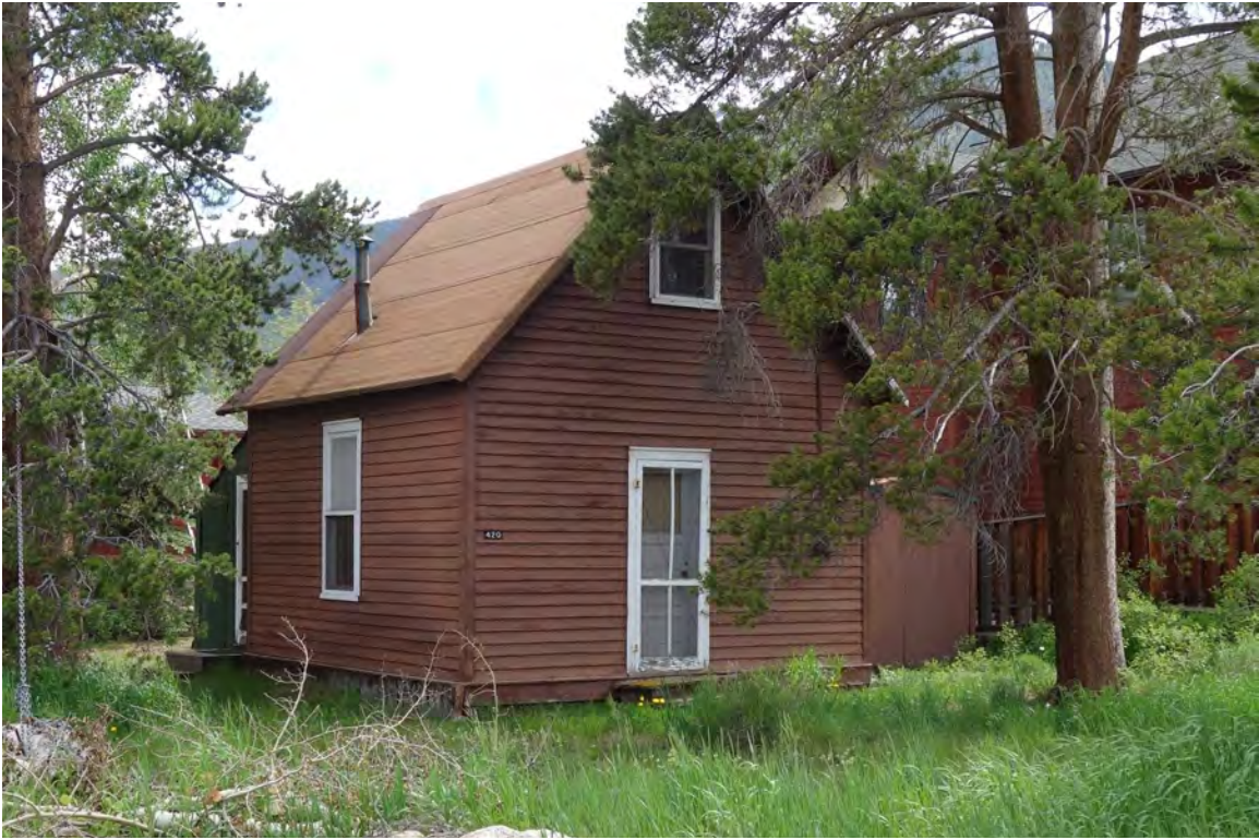
5ST.1756 • Yellow House or Pine Lodge Looking Southwest Image: 420.GAL.1