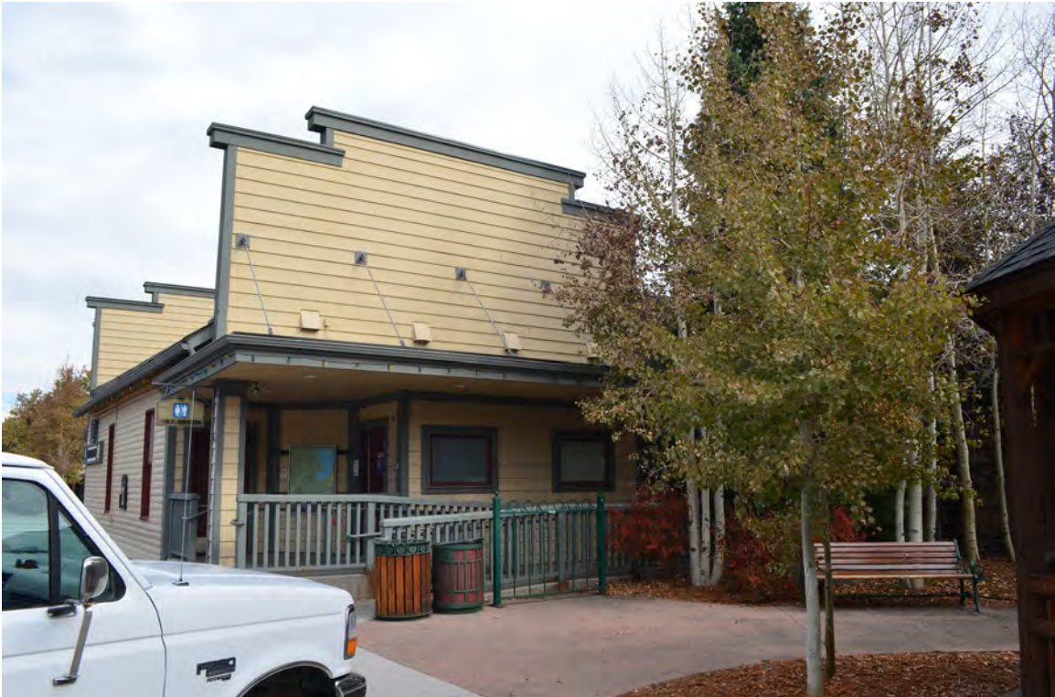
5ST.1073 • Historic Frisco Town Hall Looking North Image: 300.MAI.4