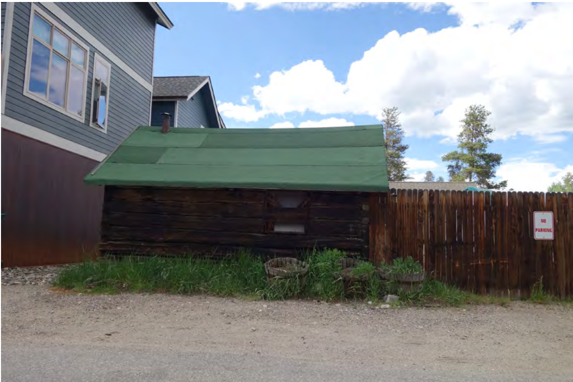
5ST.1755 • Morris House Looking North, Outbuilding 1 Image: 318.GAL.9