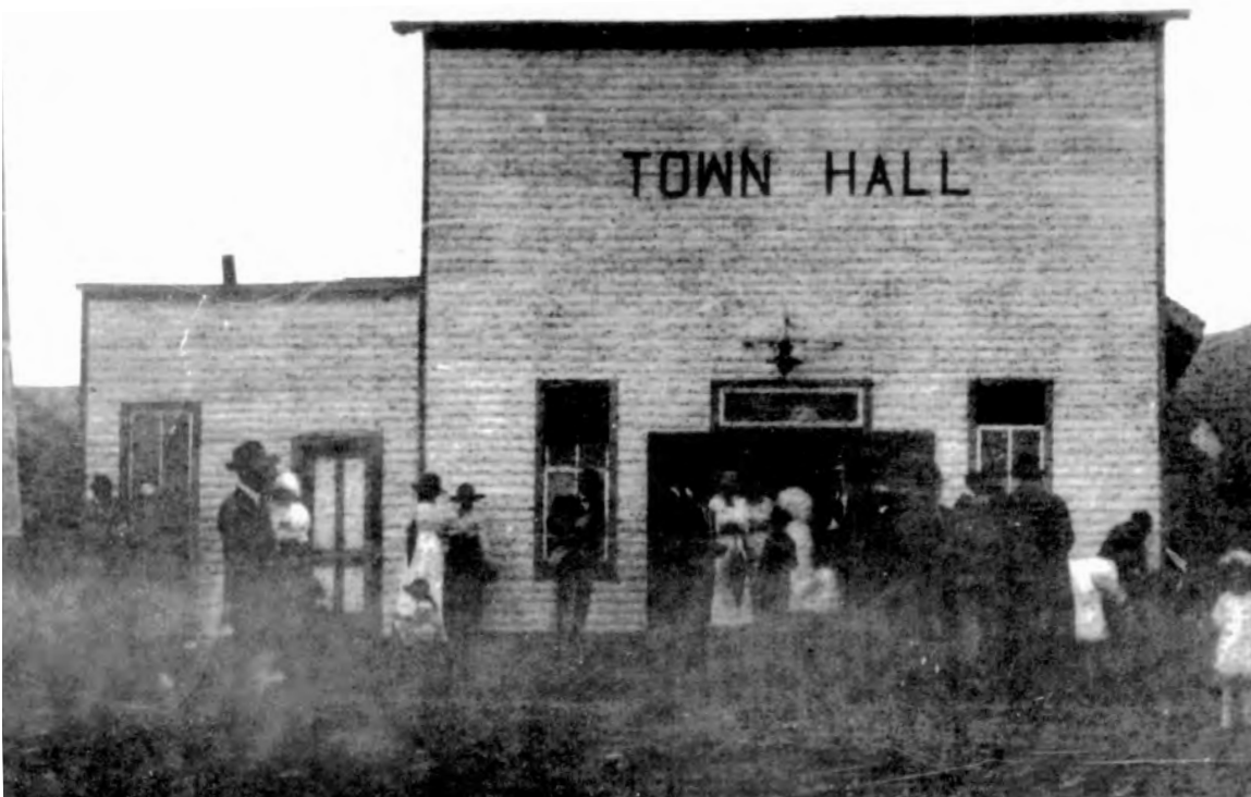
5ST.1073 • Historic Frisco Town Hall Looking South Image: 300.MAI.8

Summit County, Colorado date unknown