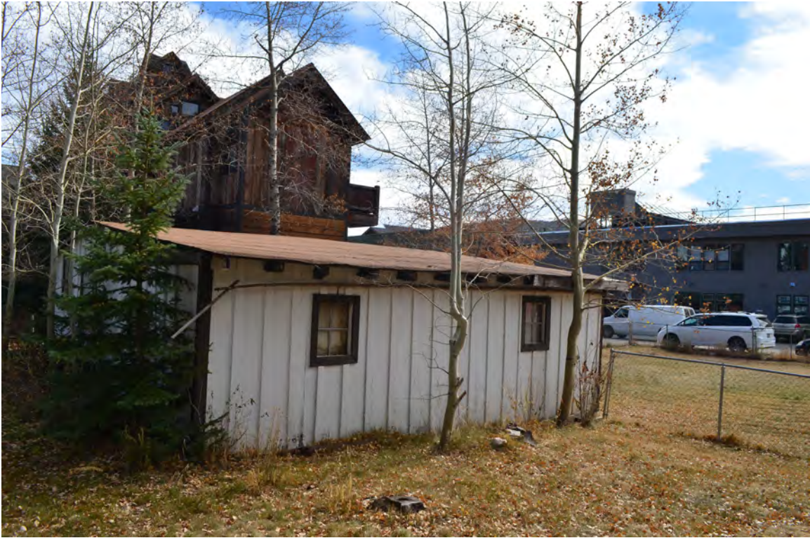
5ST.1744 • Susie Thompson House, outbuilding 1 Looking Southeast Image: 120.N4th.11