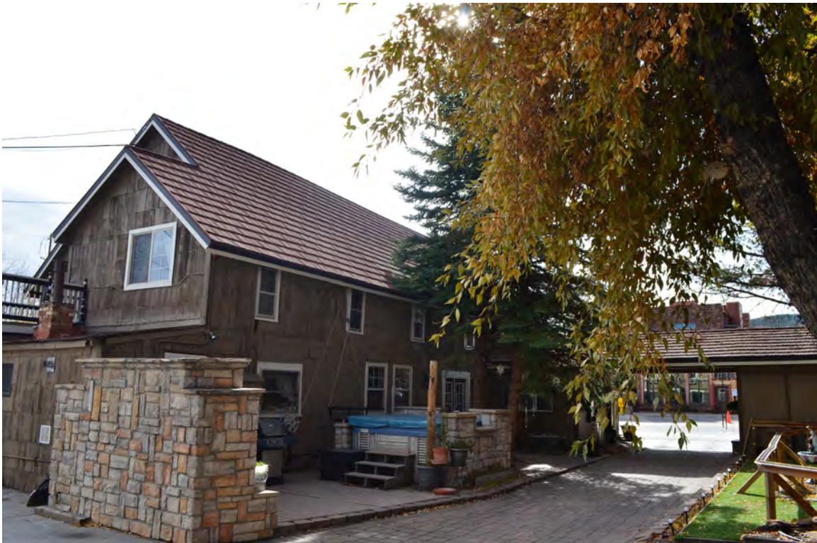
5ST.282 • Frisco Lodge Looking Southeast Image: 321.MAI.7