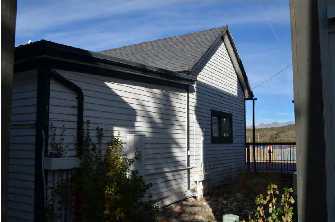
5ST.1765 • Lund House Looking Northeast Image: 267.MAR.6