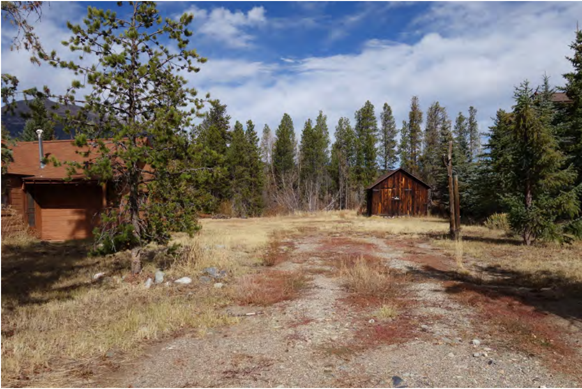
5ST.1750 Looking North with outbuilding Image: 201.GAL.7