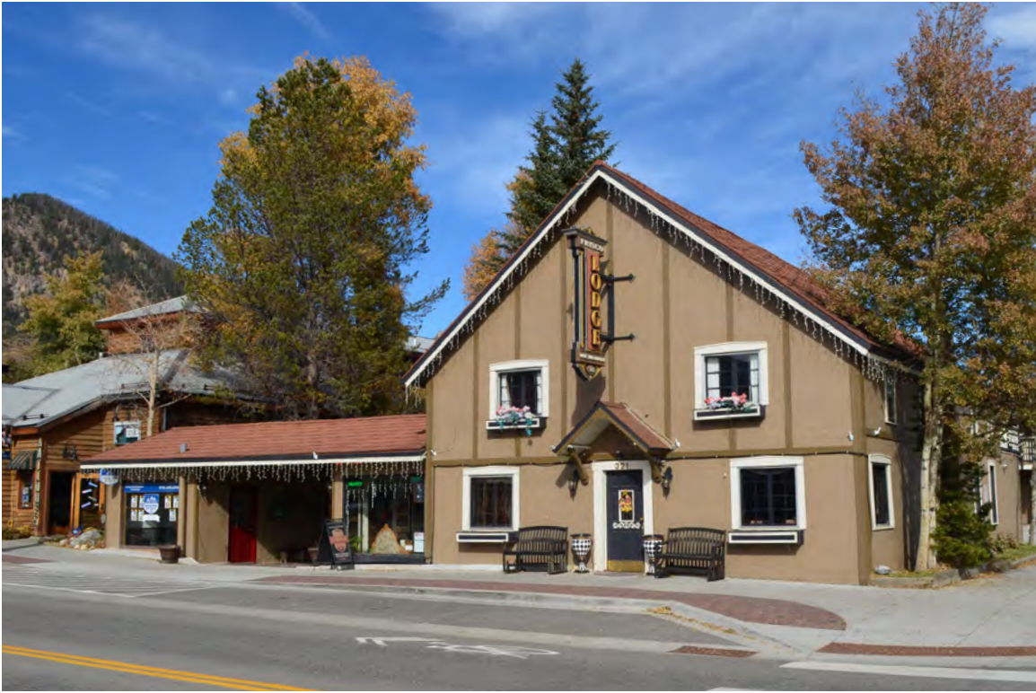
5ST.282 • Frisco Lodge Looking Northwest Image: 321.MAI.3