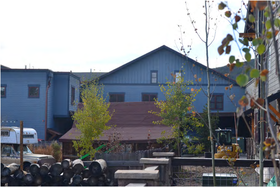
5ST.1751 • Mumford House Looking South Image: 212.GAL.7