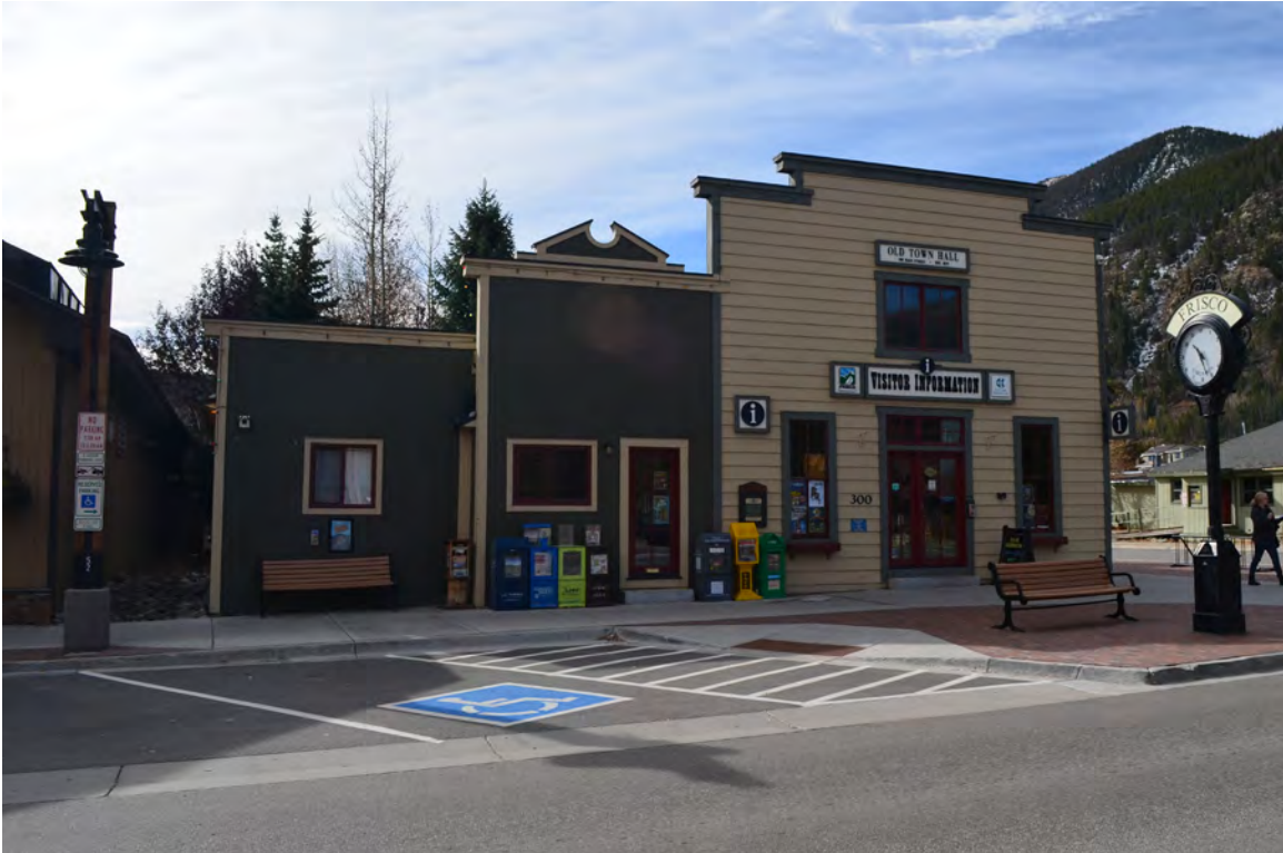
5ST.1073 • Historic Frisco Town Hall Looking South Image: 300.MAI.2